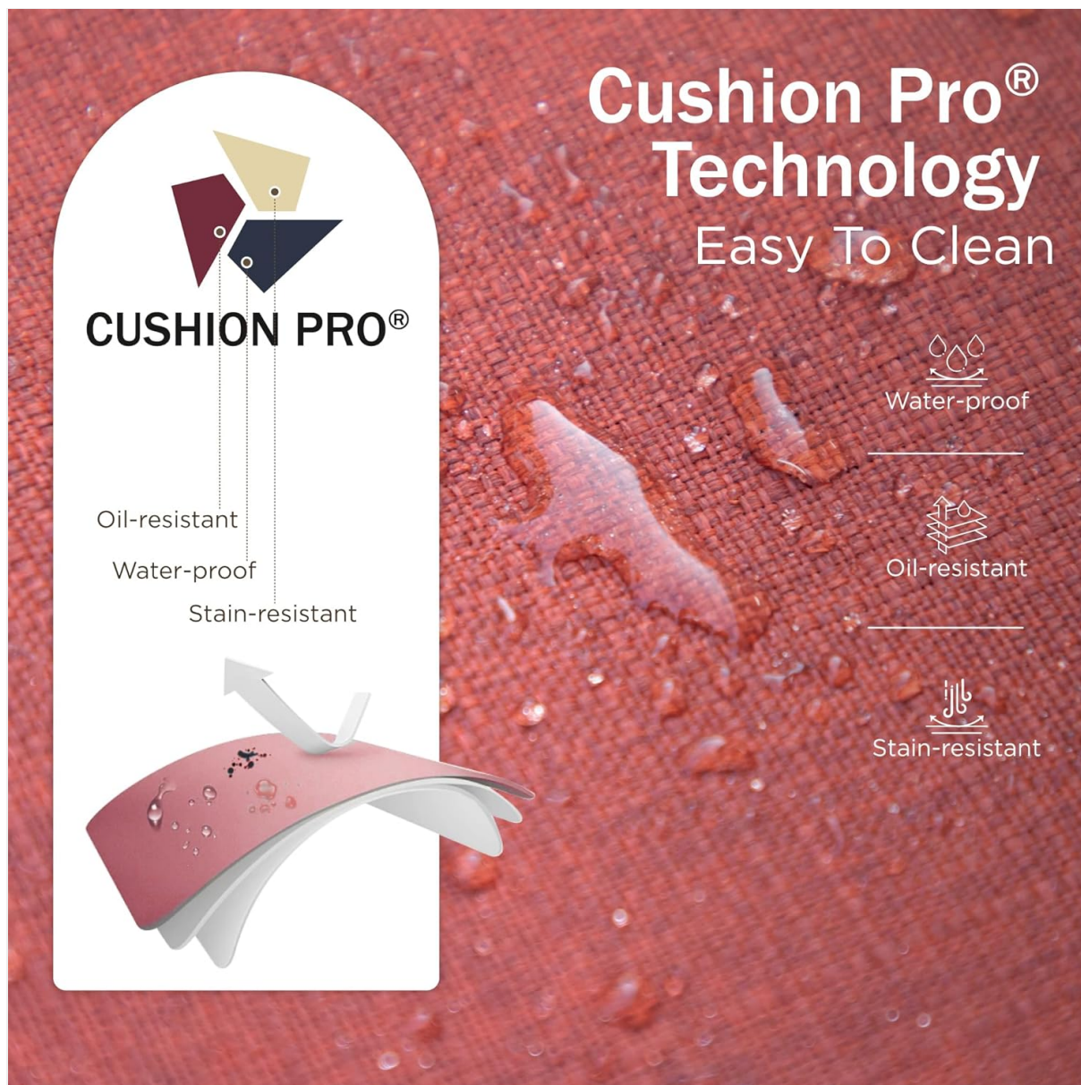
Figure 5: Explanation of Cushion Pro Technology, detailing its water, oil, and stain-resistant properties for easy cleaning.