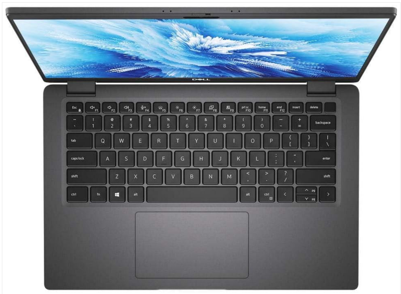
Image: Top-down view of the Dell Latitude 7410 keyboard and touchpad.