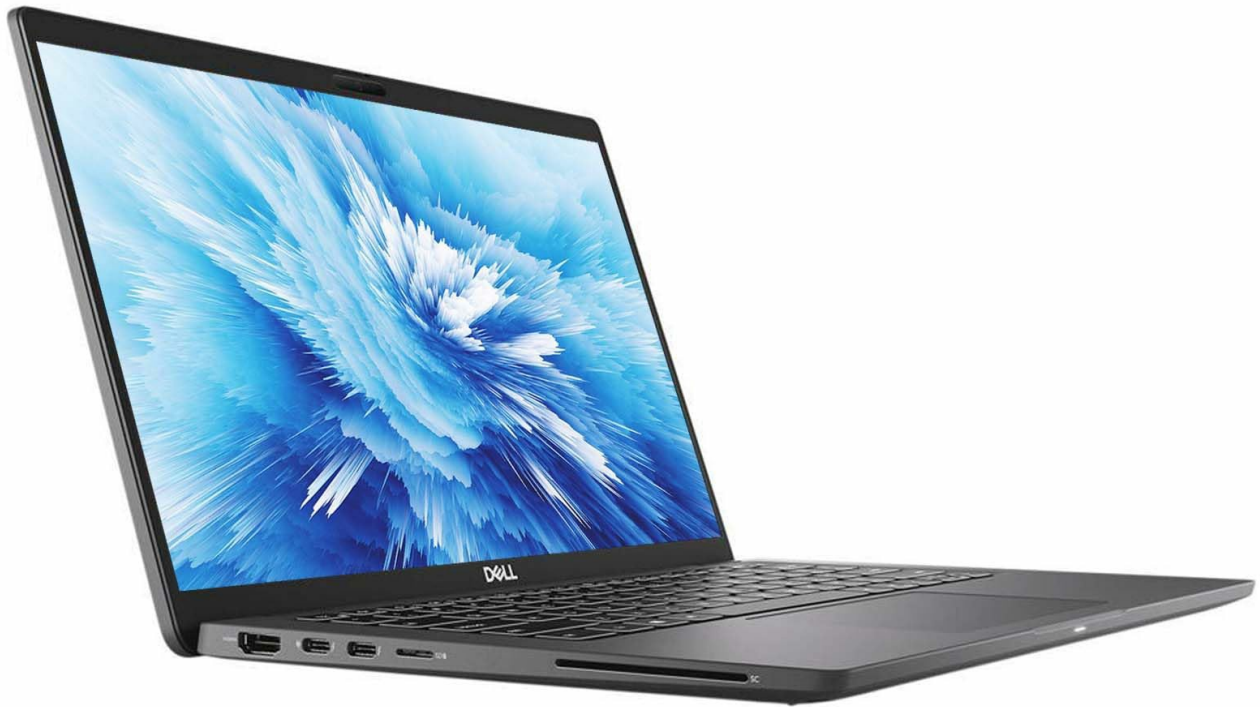
Image: Dell Latitude 7410 Laptop, side view with the screen open.