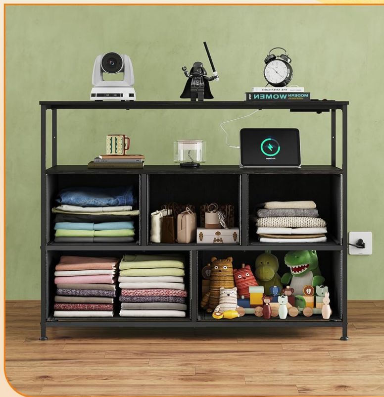
Image: A detailed view of the built-in charging station on the dresser's top surface, showing the three AC outlets and a tablet actively charging.