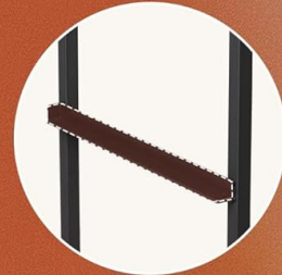
Solid Drawer Slides