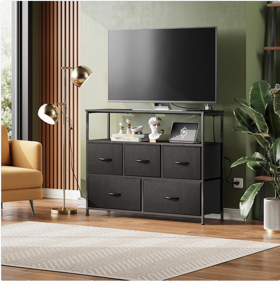
Image: The WLIVE Black Dresser TV Stand with 5 drawers and open shelves, featuring a television on top, in a modern living room environment.