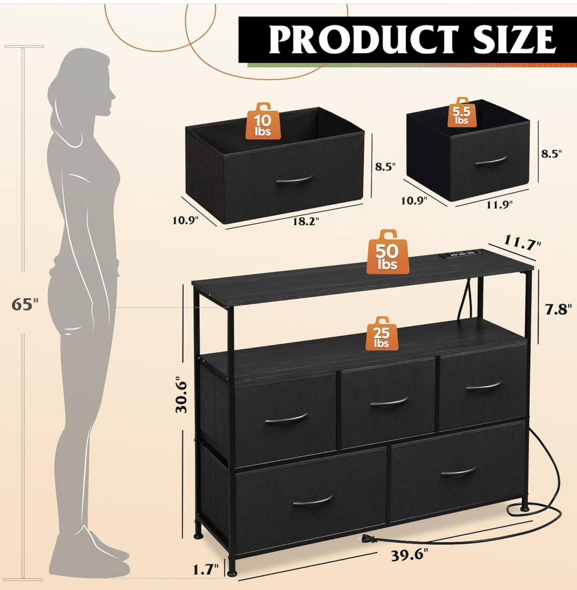
Image: A visual representation of the dresser's dimensions, including height, width, and depth, along with individual drawer capacities.