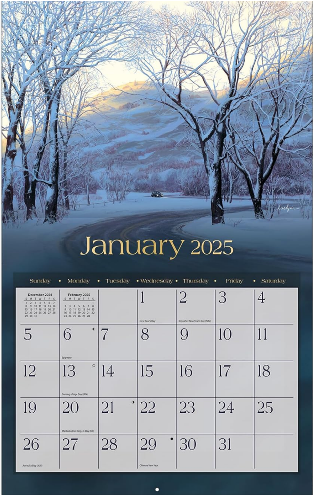
Image: A detailed view of the January 2025 page, highlighting the monthly layout and the winter scene artwork.