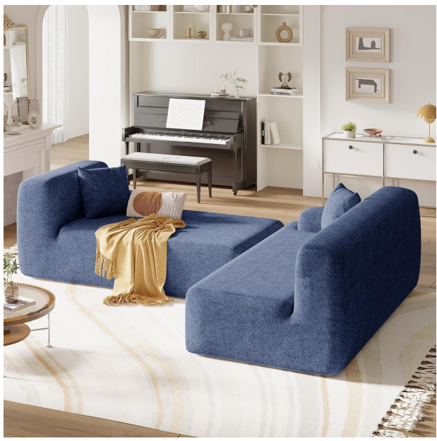
Image 3.1: Illustration of the sofa's frameless pure foam construction, highlighting its comfortable and supportive seating experience.