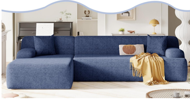
Image 3.3: Visual representation of the generous 27-inch seating depth, designed to provide a spacious and inviting experience for relaxation.

The beautiful patterns on the fabric not only enhance the aesthetics but also ensure a sofa that looks as good as it feels, even after extended use.