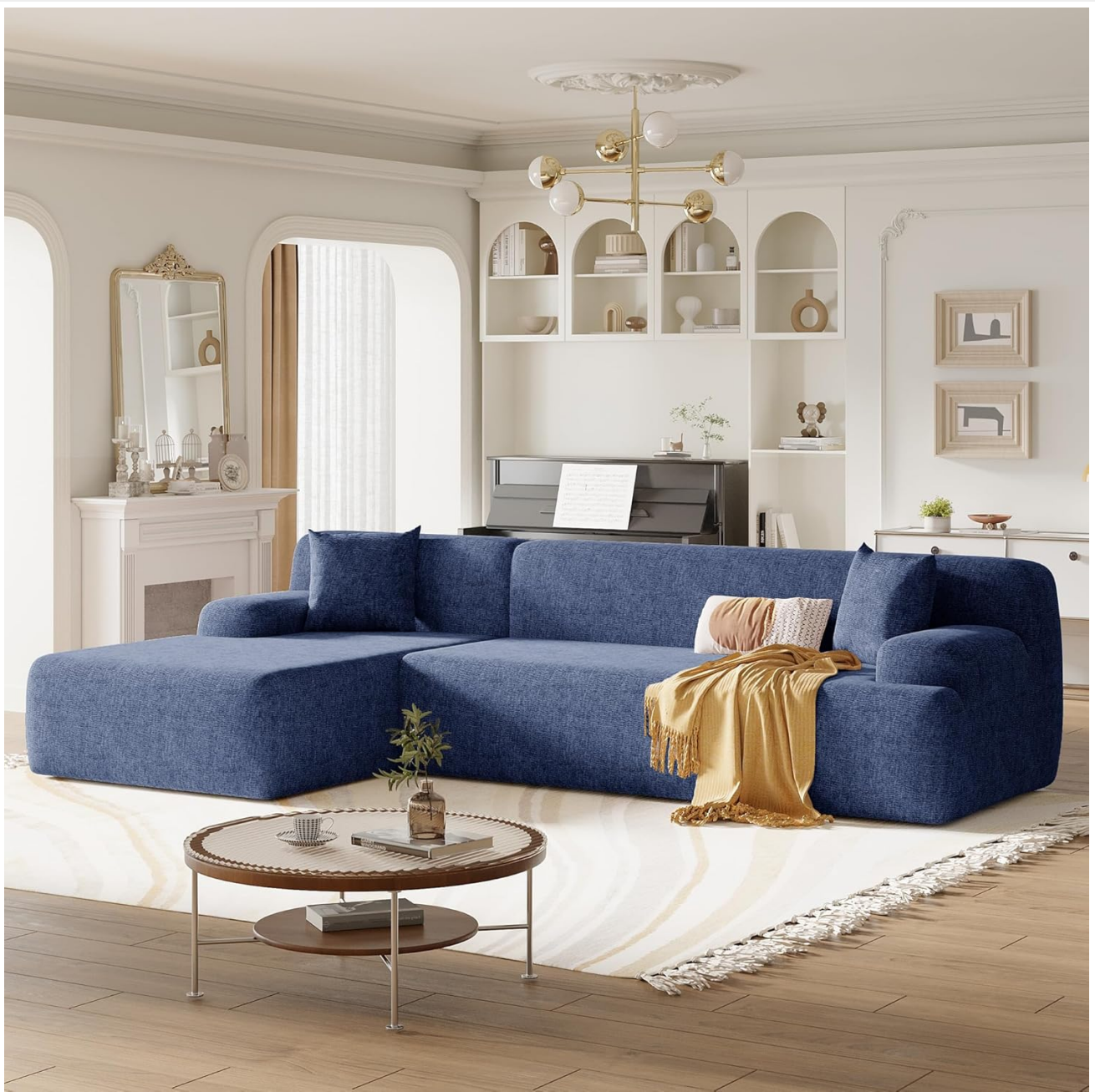
Image 1.1: The HZSSDTKJ 109-inch L-Shape Modular Sectional Sofa in a living room setting, showcasing its blue chenille fabric and modular design.