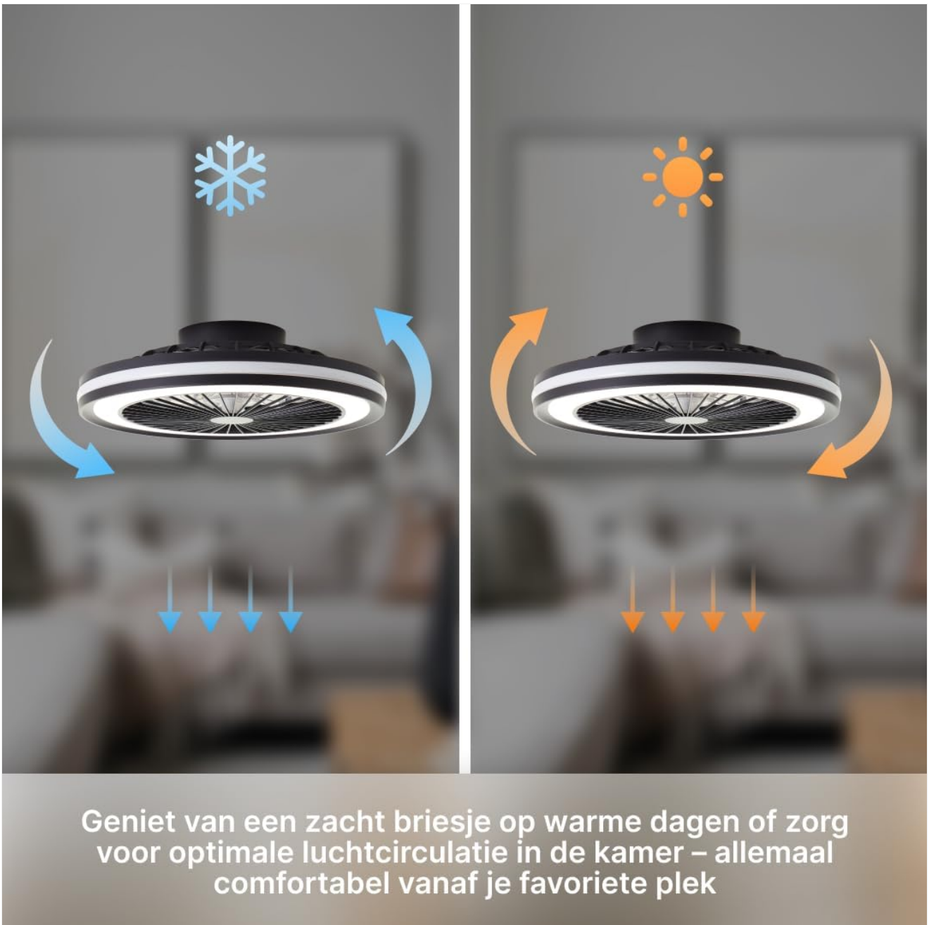
Image 6: Enjoy a gentle breeze on warm days or ensure optimal air circulation in the room, all from your favorite spot.