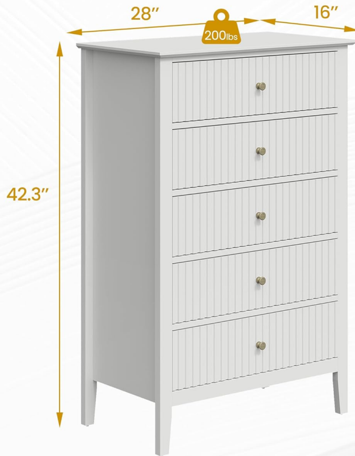
Image 1.2: Visual representation of the dresser's dimensions: 16 inches deep, 28 inches wide, and 42.3 inches high, with a top weight capacity of 200 lbs.