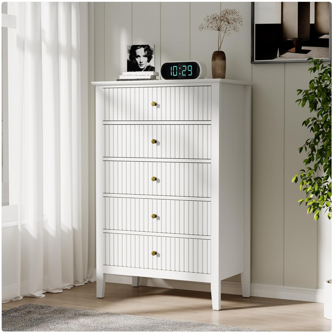
Image 1.1: The RoyalCraft White Fluted 5 Drawer Dresser, showcasing its modern design and five drawers.