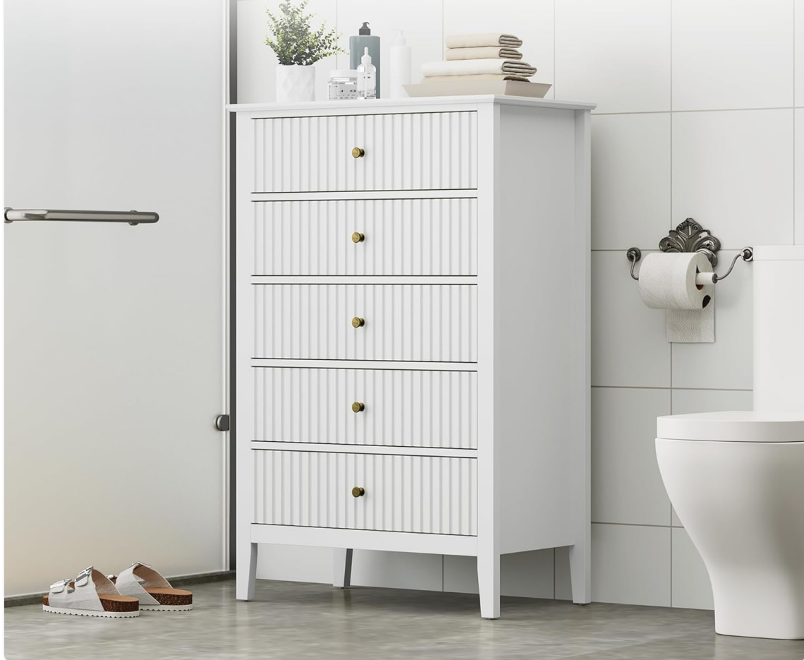
Image 6.1: The dresser positioned in a bathroom, demonstrating its water-resistant properties and suitability for various environments.

Waterproof, durable material perfect for bathrooms. Easy to clean, ensuring long-lasting protection and convenience.