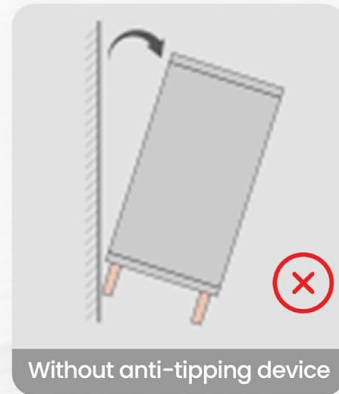
Without anti-tipping device