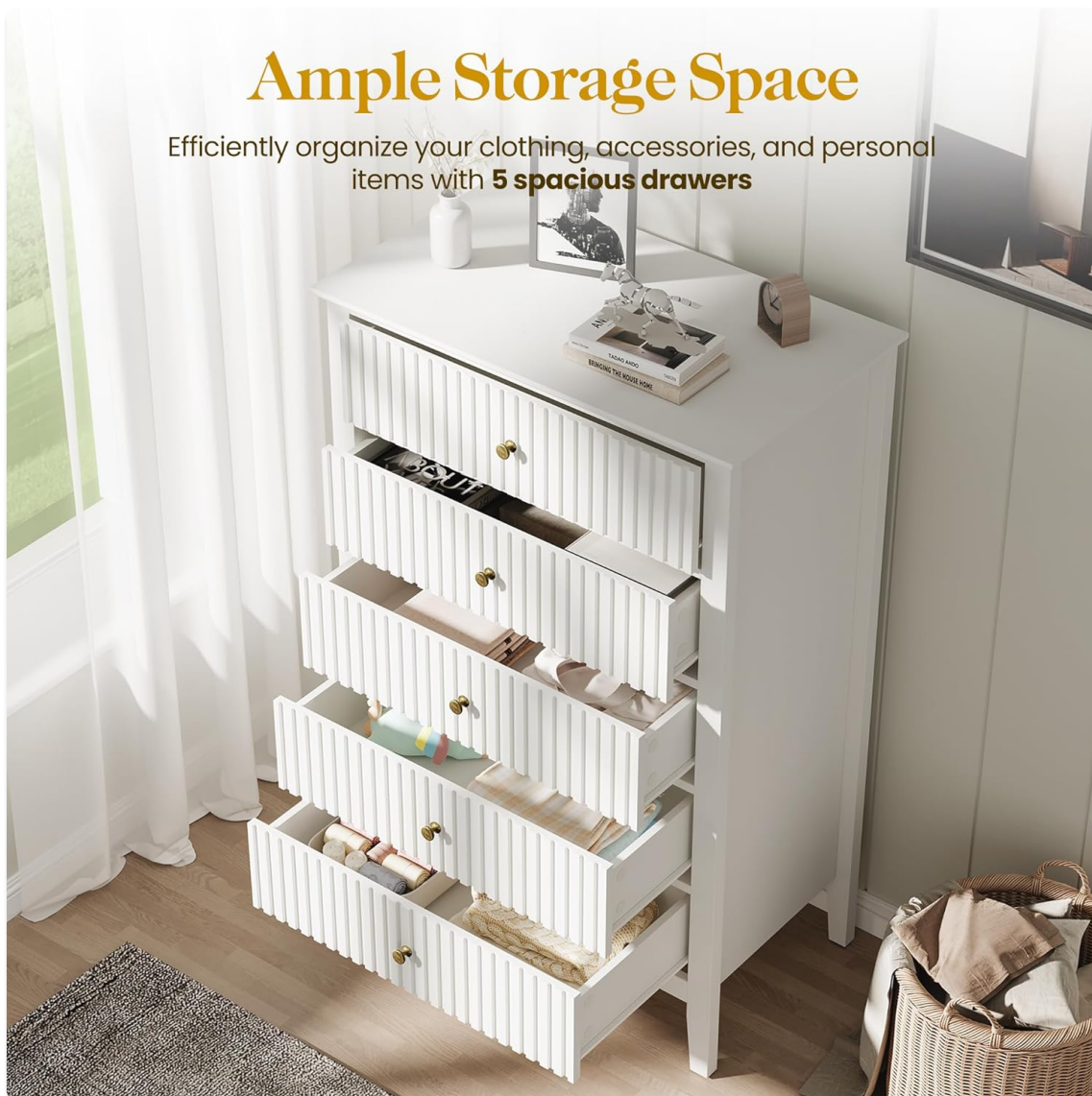
Image 5.1: The dresser with all five drawers open, illustrating the ample storage capacity for various items.