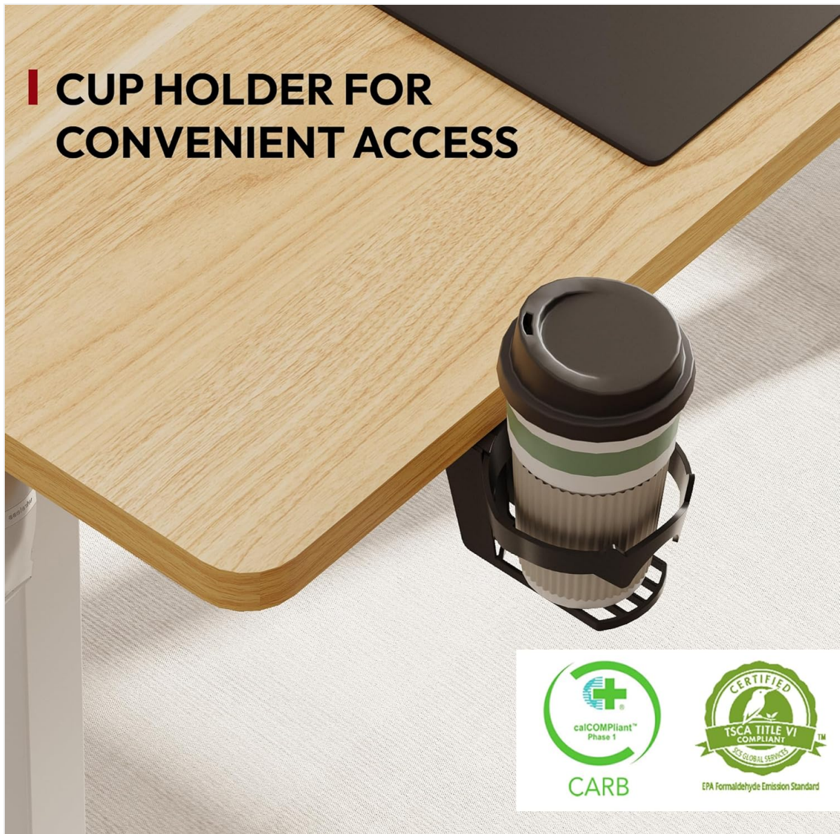
Image: The desk's integrated cup holder, providing convenient access to beverages.

The spacious desktop includes convenient features such as a bottle holder and headphone hook to enhance your working environment.