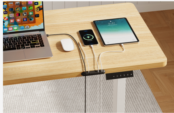
Image: A comparison demonstrating effective cable organization, transforming a cluttered setup into a clean workspace.