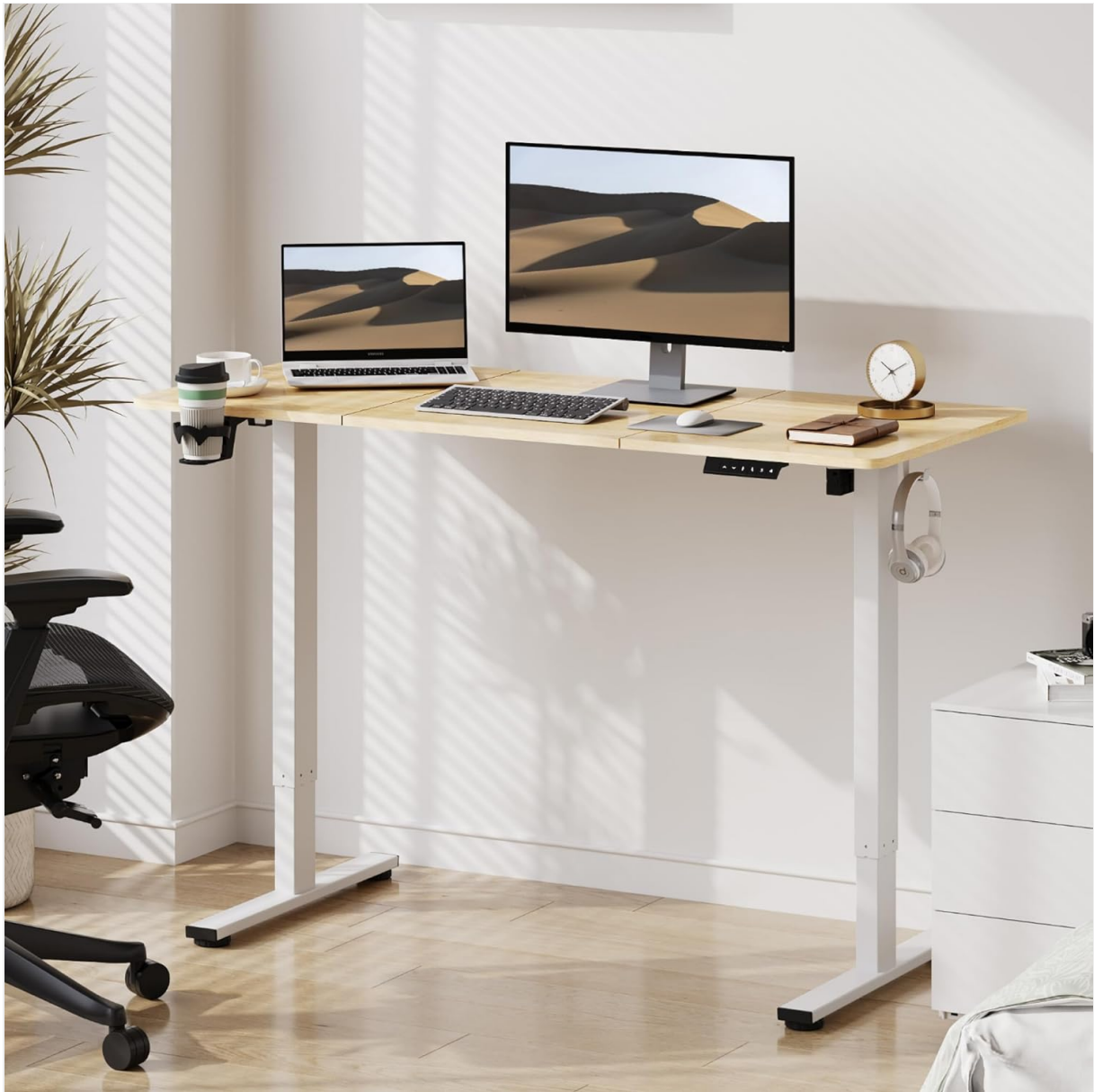
Image: The SANODESK Electric Height Adjustable Standing Desk, 140x60cm, with a maple top and white frame, set up in an office environment.