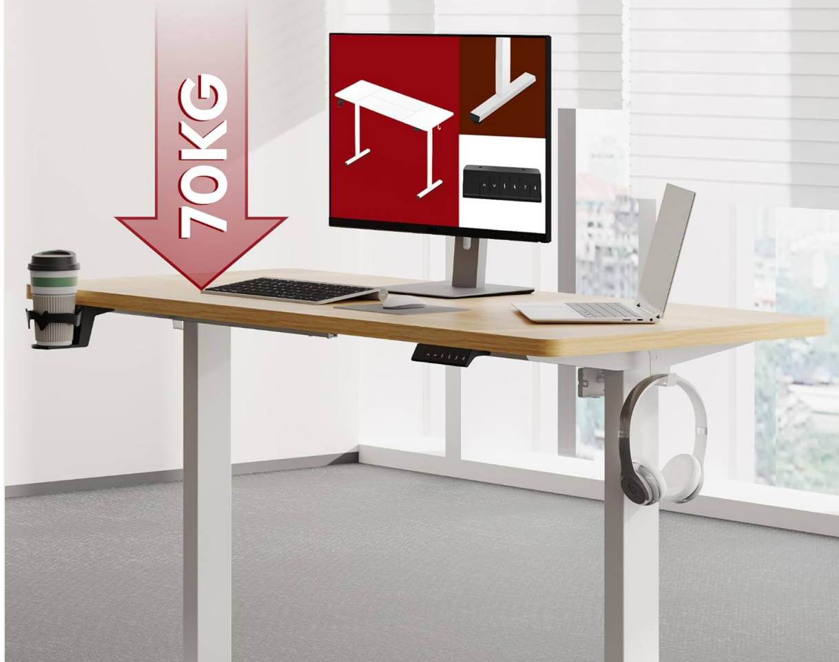
Image: A diagram illustrating the enhanced stability features of the SANODESK frame compared to standard designs.

25% stronger material than others for perfect stability