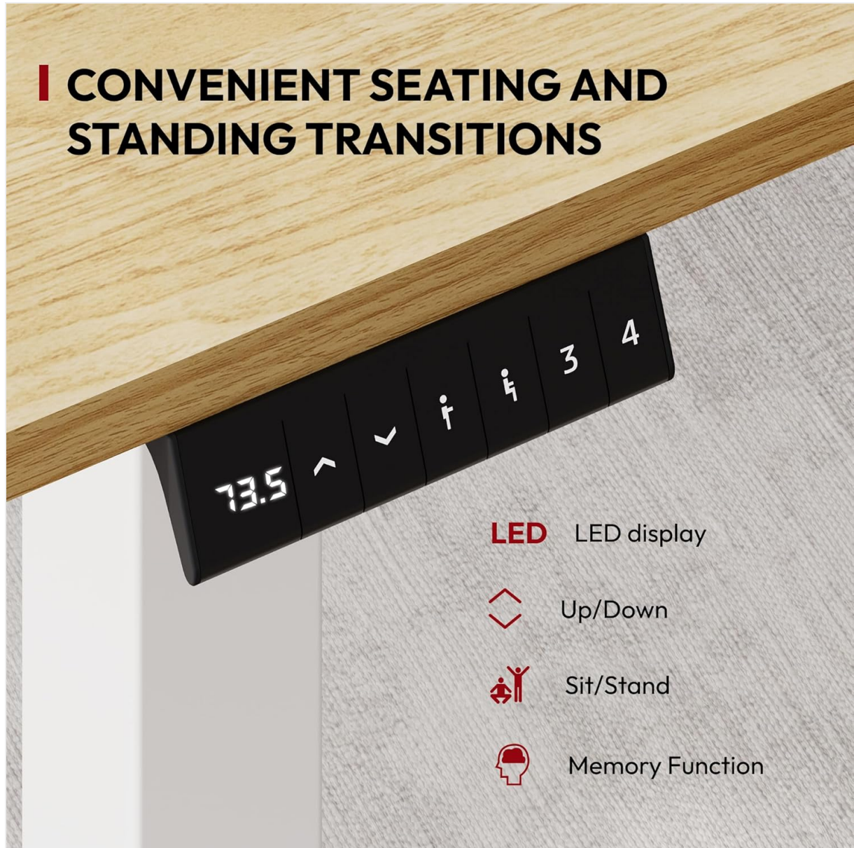
Image: The desk's control panel, detailing the LED display, height adjustment buttons, and memory presets.