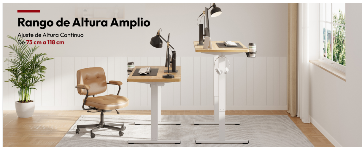
Image: The desk in both sitting and standing configurations, highlighting its ergonomic flexibility.