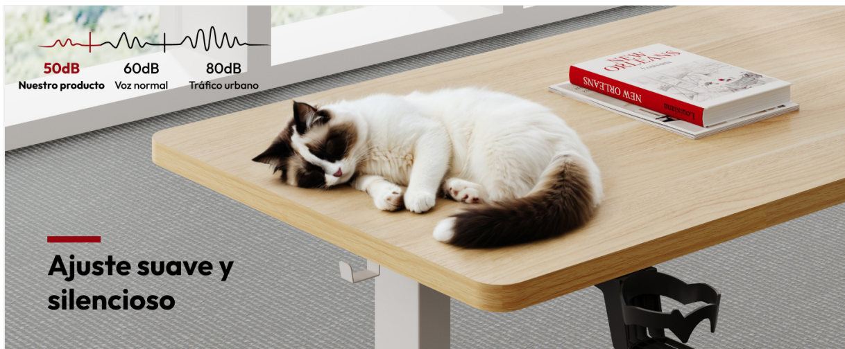
Image: A visual representation of the desk's quiet operation, comparing its noise level to a normal voice and city traffic.