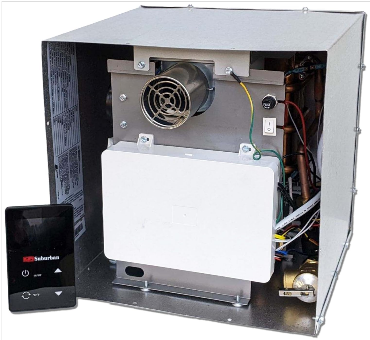
Figure 3.1: The Suburban ST-42 Tankless Water Heater unit, showing internal components and the included digital control center.