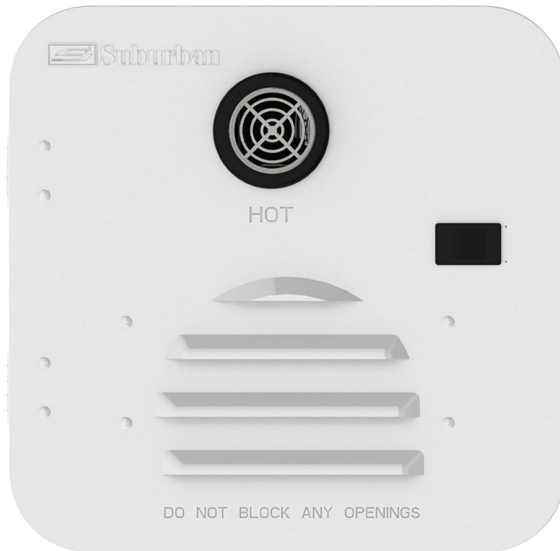
Figure 3.2: Example of an exterior water heater door, which is sold separately and necessary for installation.