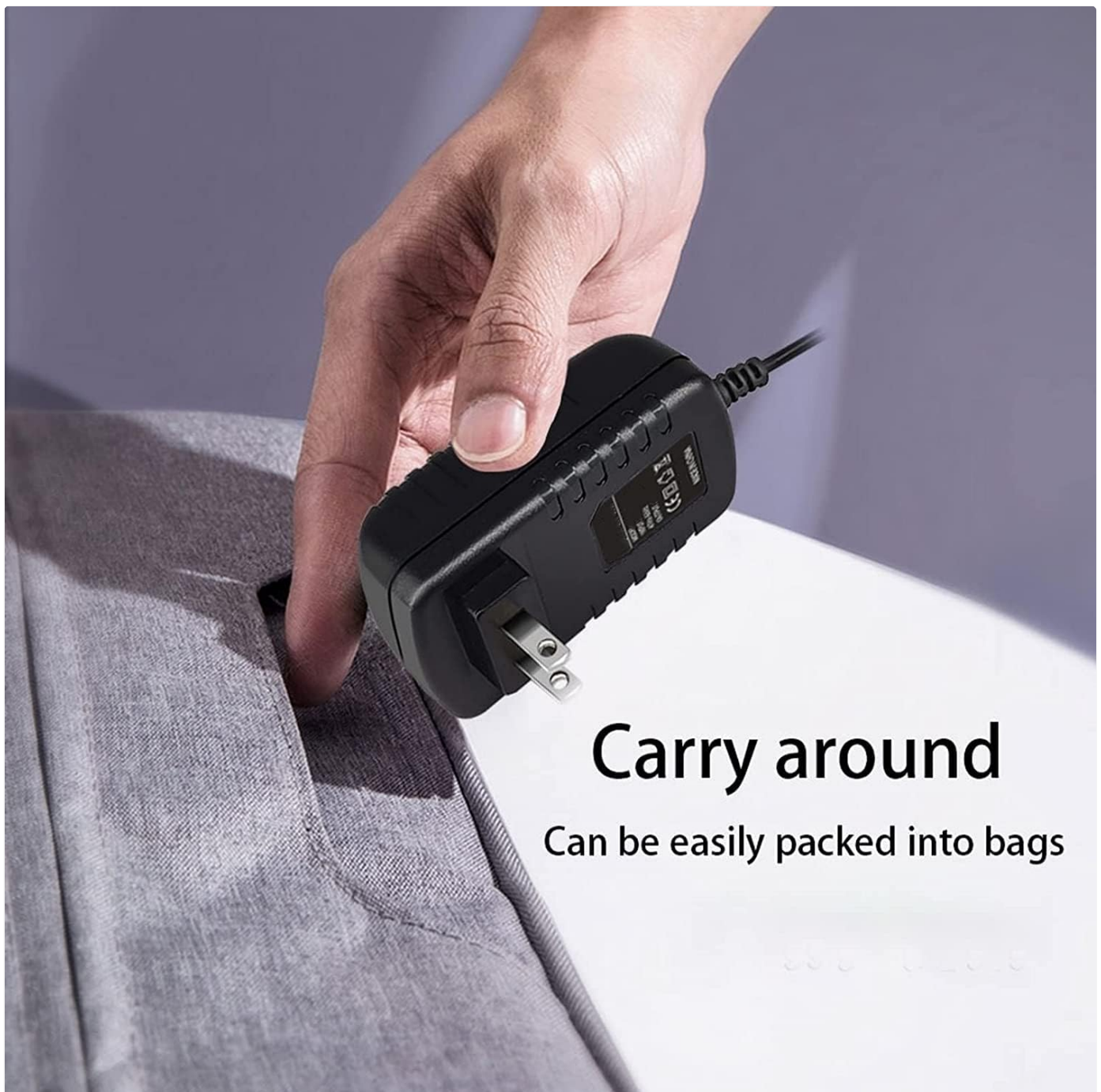
Image 3: A hand demonstrating the portability of the adapter by placing it into a bag, emphasizing its small and lightweight design for easy transport.