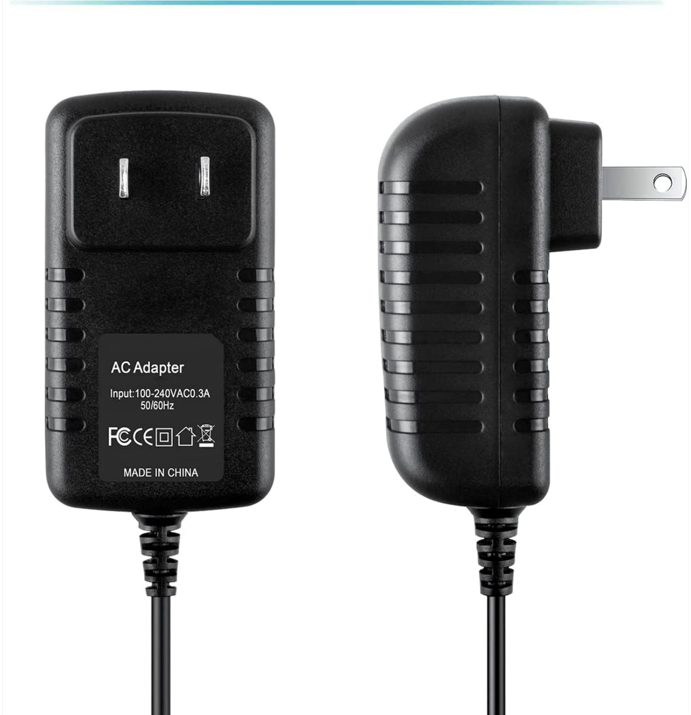
Image 2: This image displays the front and side views of the AC/DC adapter, highlighting its compact design and the input specifications printed on the front surface.