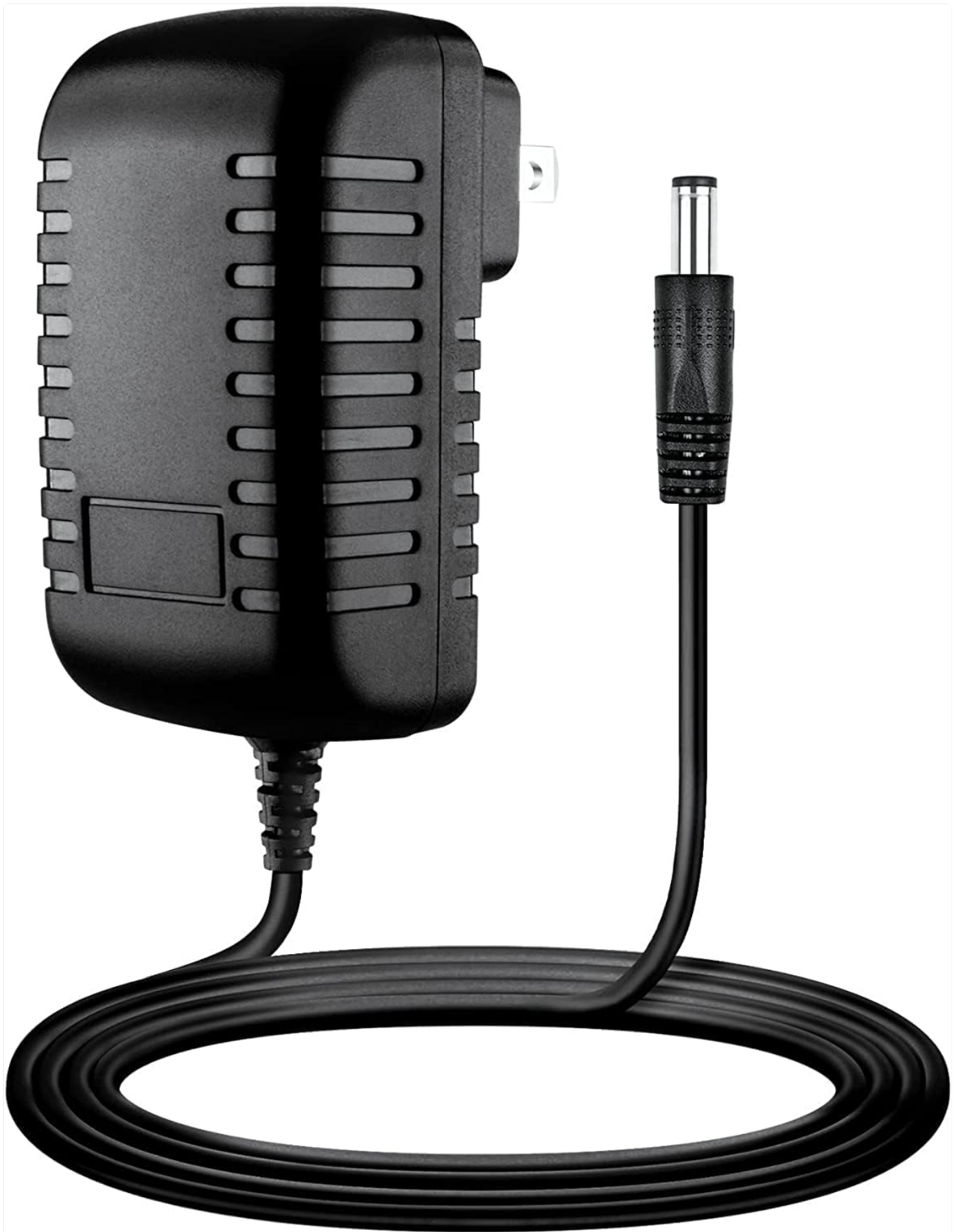
Image 1: The GUY-TECH AC/DC Adapter showing the main unit and the connected power cable with the DC output plug. This image illustrates the complete adapter unit.