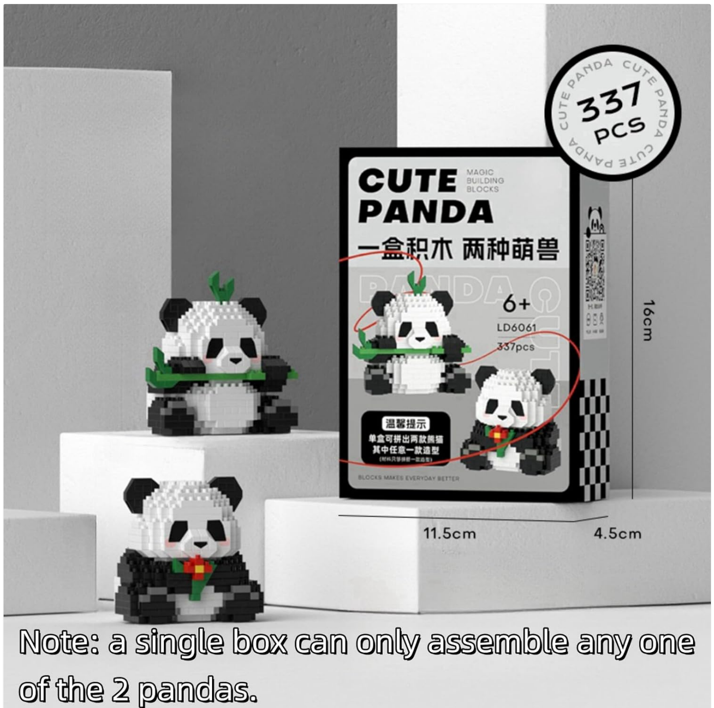
Figure 4: Assembly Options. The product packaging illustrates that while multiple designs are possible, the set contains enough pieces to build one panda at a time.

Your browser does not support the video tag.