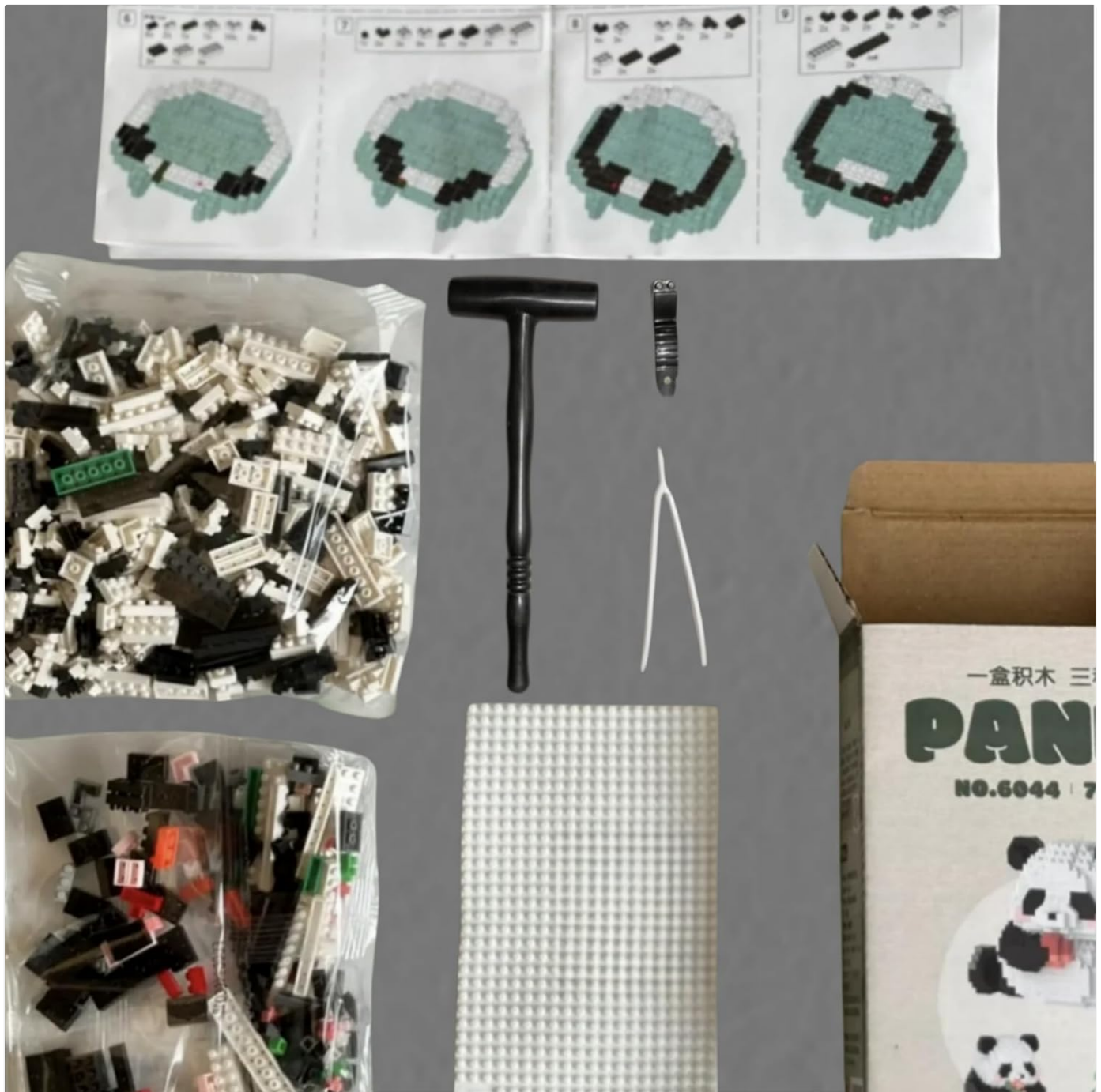
Figure 1: Contents of the QMEAKMONY Mini Building Blocks Panda Set. This image displays the various components included in the box, such as the building blocks, a tweezer for handling small pieces, a plastic hammer, a building block mat for assembly, and a block piece opener.