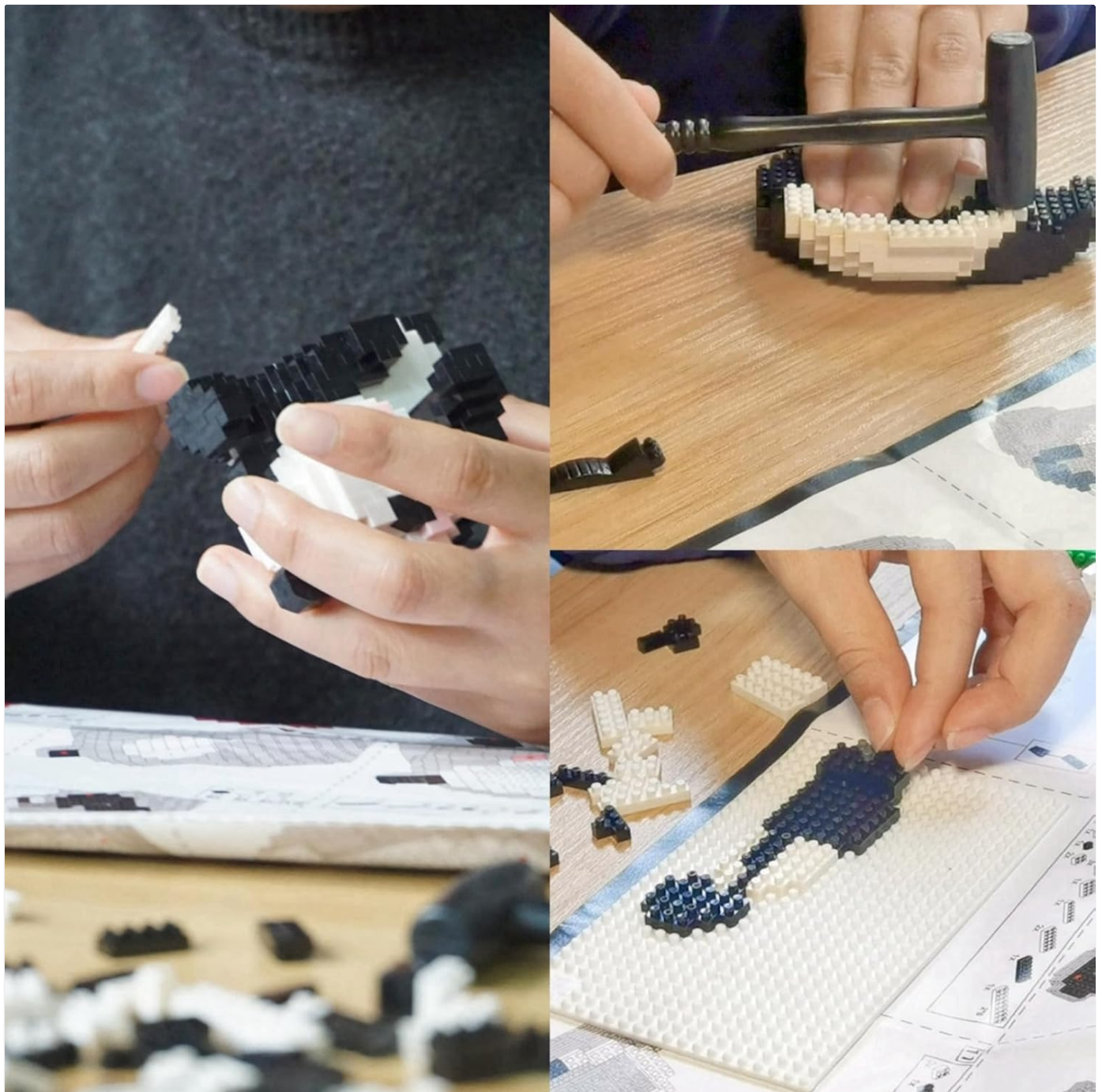
Figure 3: Assembly in Progress. This collage shows various techniques for assembling the blocks, including using the plastic hammer to secure pieces and the building mat to organize the construction.