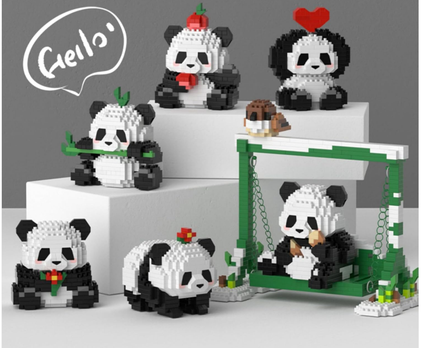
Figure 5: Stylish Decoration. This image shows multiple assembled panda figures arranged as decorative elements, demonstrating their aesthetic appeal for home or office display.