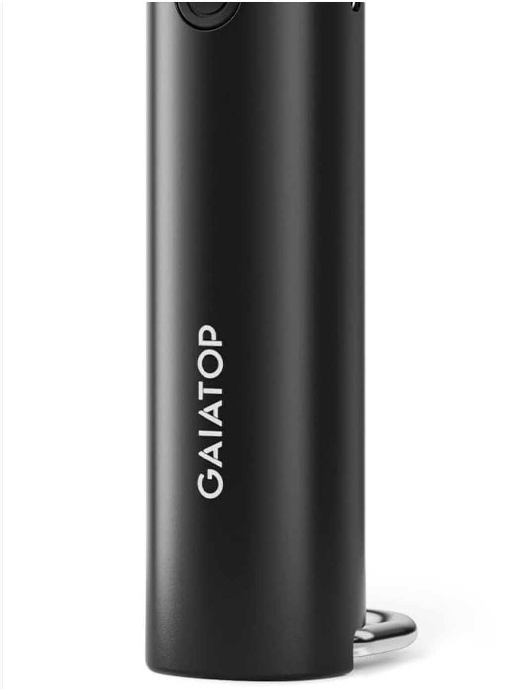
Figure 1: Gaiatop Portable Mini Fan (Black)