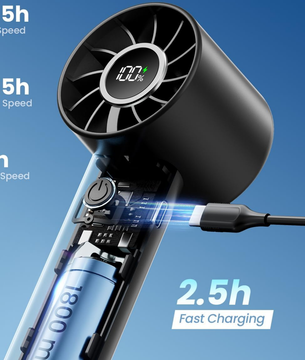
Figure 3: Charging the fan via Type-C port. A full charge provides 2-7 hours of operation depending on speed setting.