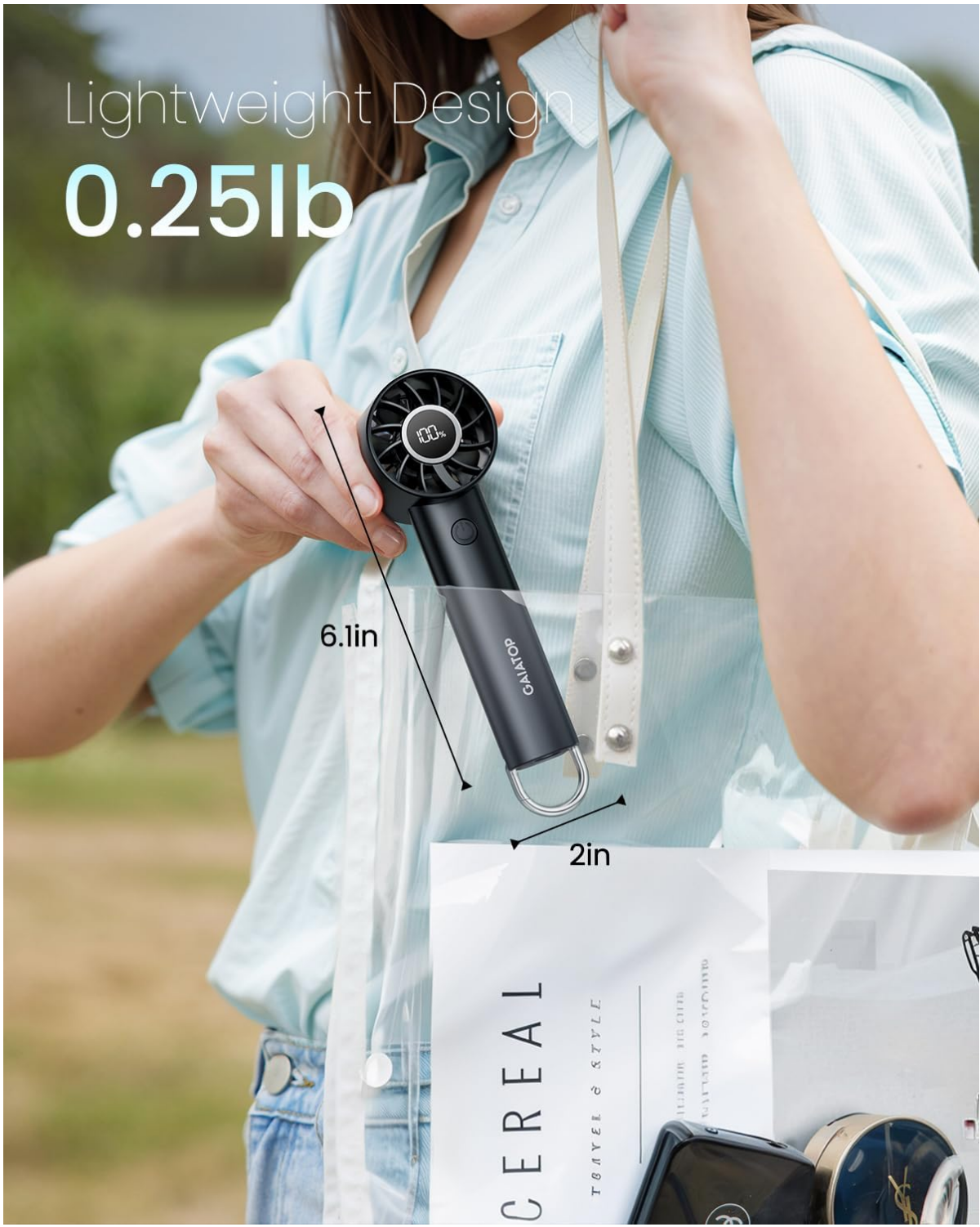
Figure 6: Demonstrating the fan's lightweight and portable design.