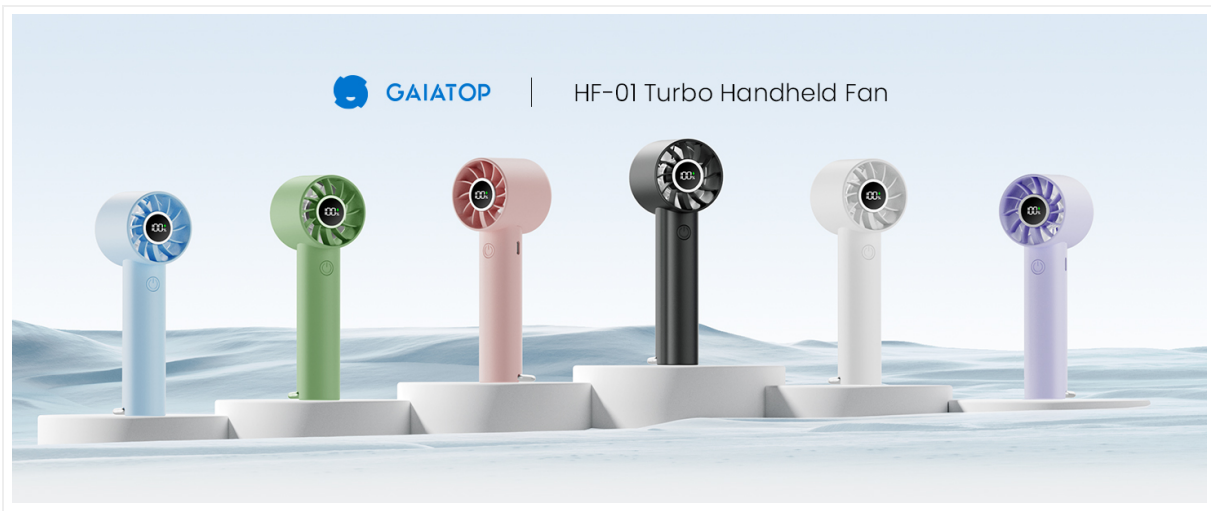
Figure 7: Illustration of the fan's powerful brushless motor.