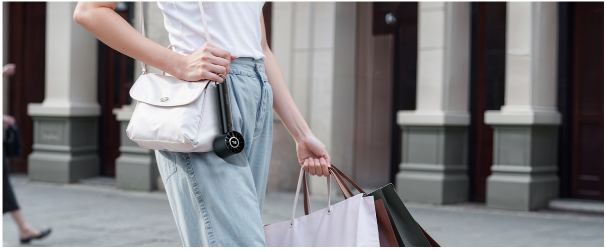
Figure 2: Key features of the Gaiatop Portable Mini Fan