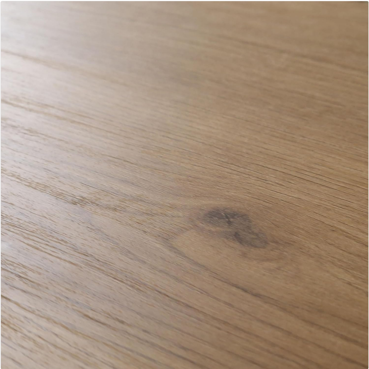
Figure 5: A close-up image illustrating the high-quality oak wood grain texture of the furniture's surface.