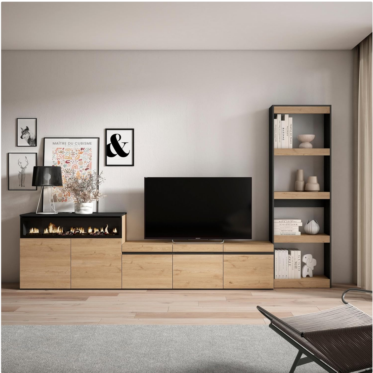
Figure 2: An overall view of the assembled Skraut Home TV unit set, featuring the electric fireplace, TV module, central buffet, and a four-shelf unit.