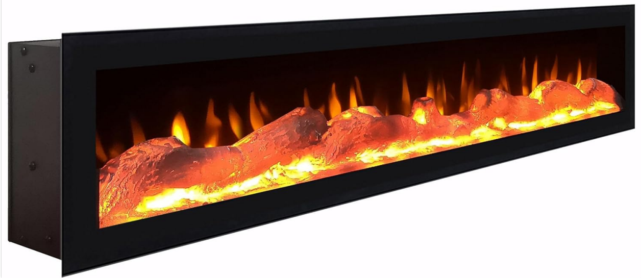
Figure 4: A detailed perspective of the electric fireplace unit, highlighting its design and integration into the furniture.