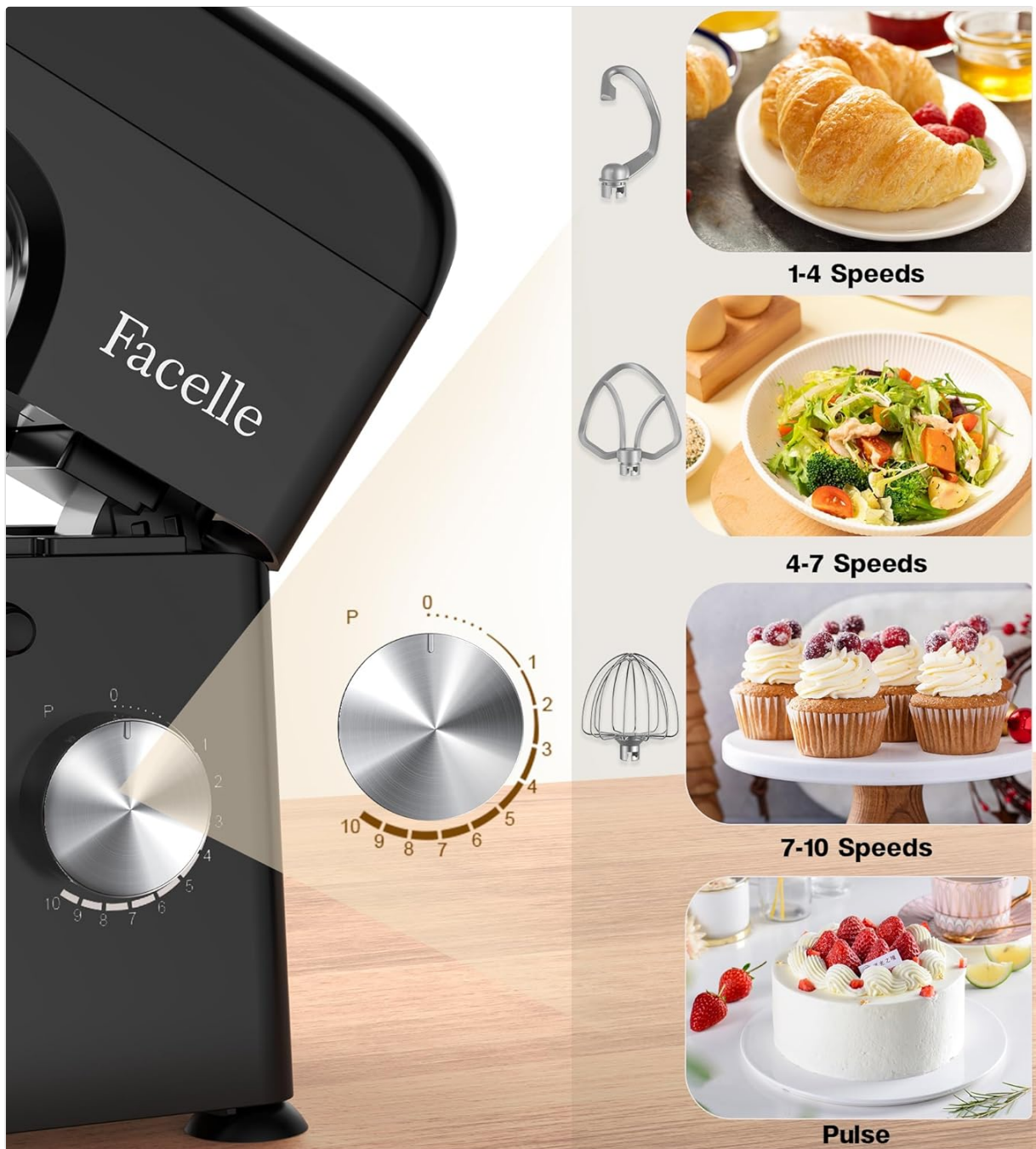
Figure 4.1: Visual guide for speed settings and corresponding attachments. Speeds 1-4 for dough, 4-7 for flat beater, 7-10 for whisk, and 'P' for pulse.