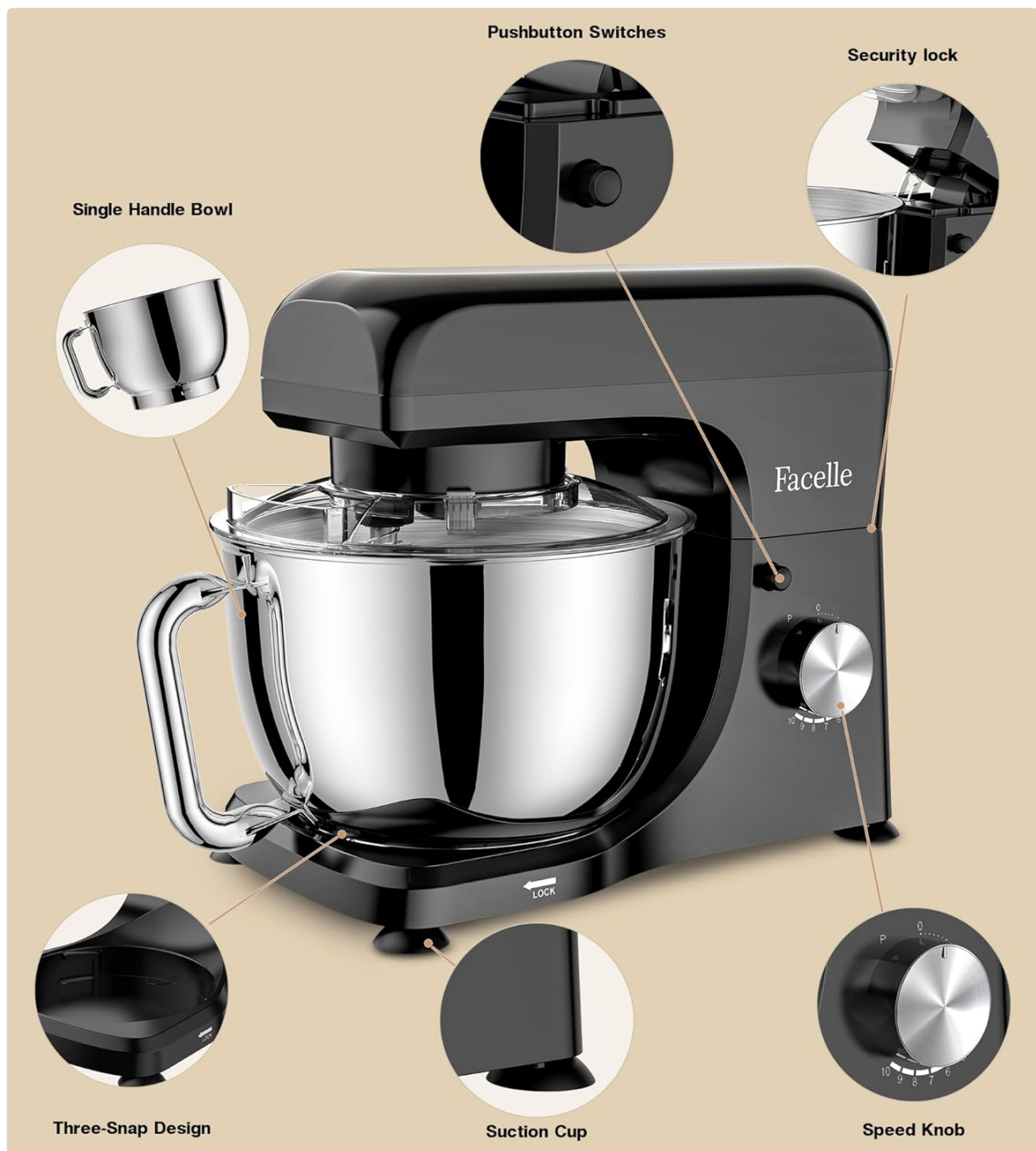
Figure 2.2: Detailed view of the mixer's control panel and design features, highlighting the pushbutton switches, security lock, single-handle bowl, three-snap design for stability, suction cups on the base, and the speed control knob.