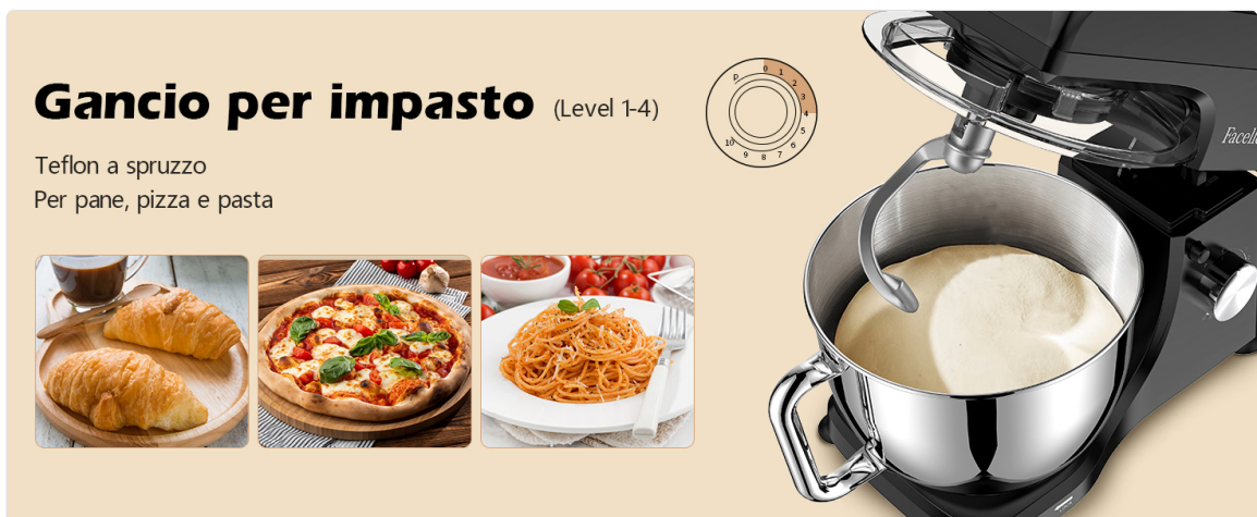
Figure 4.2: The dough hook attachment, designed for efficient kneading of various dough types.