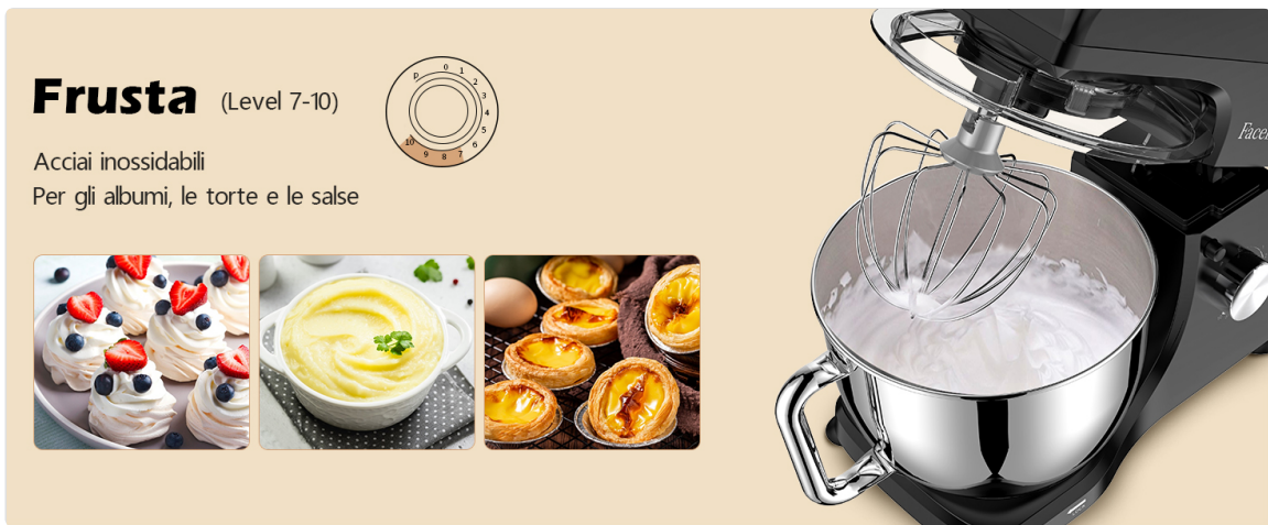
Figure 4.4: The whisk attachment, designed for whipping and aerating ingredients.