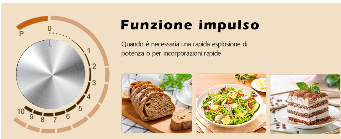
Figure 4.5: The pulse function provides immediate maximum speed for short durations.