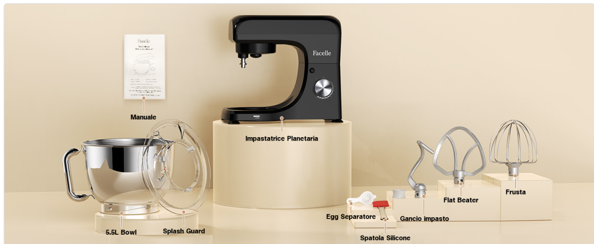
Figure 3.1: The tilt-head design allows for easy attachment and removal of the mixing bowl and accessories.