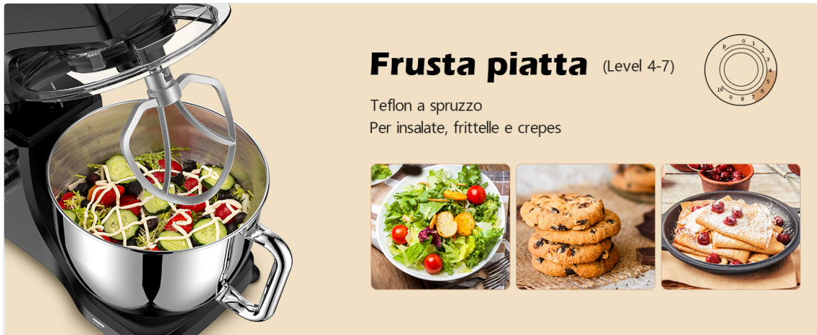
Figure 4.3: The flat beater attachment, used for general mixing tasks.