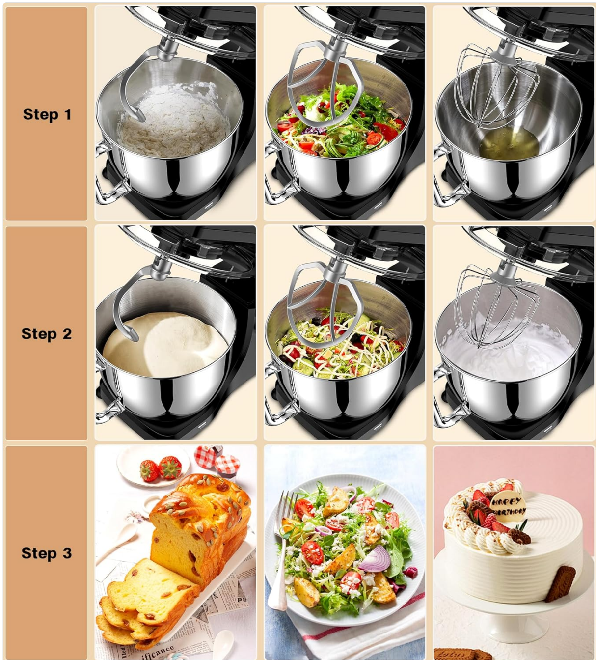
Figure 4.6: An example of the mixing process, from adding ingredients to achieving the desired consistency for various recipes.