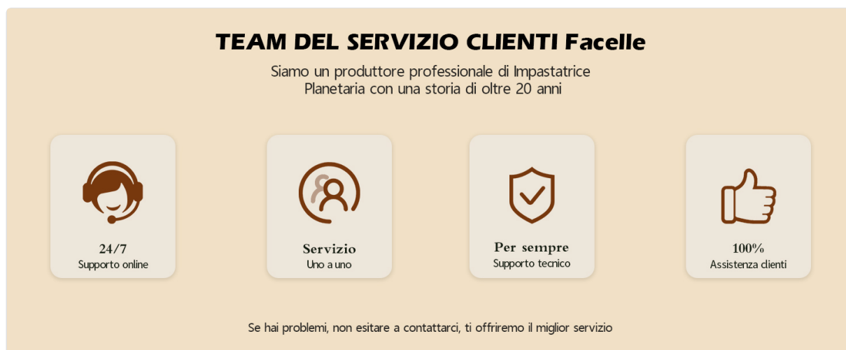
Figure 8.1: Facelle Customer Service Team offers 24/7 online support, one-to-one service, lifetime technical support, and 100% customer assistance.

If you have any problems, do not hesitate to contact us. We will offer you the best service.