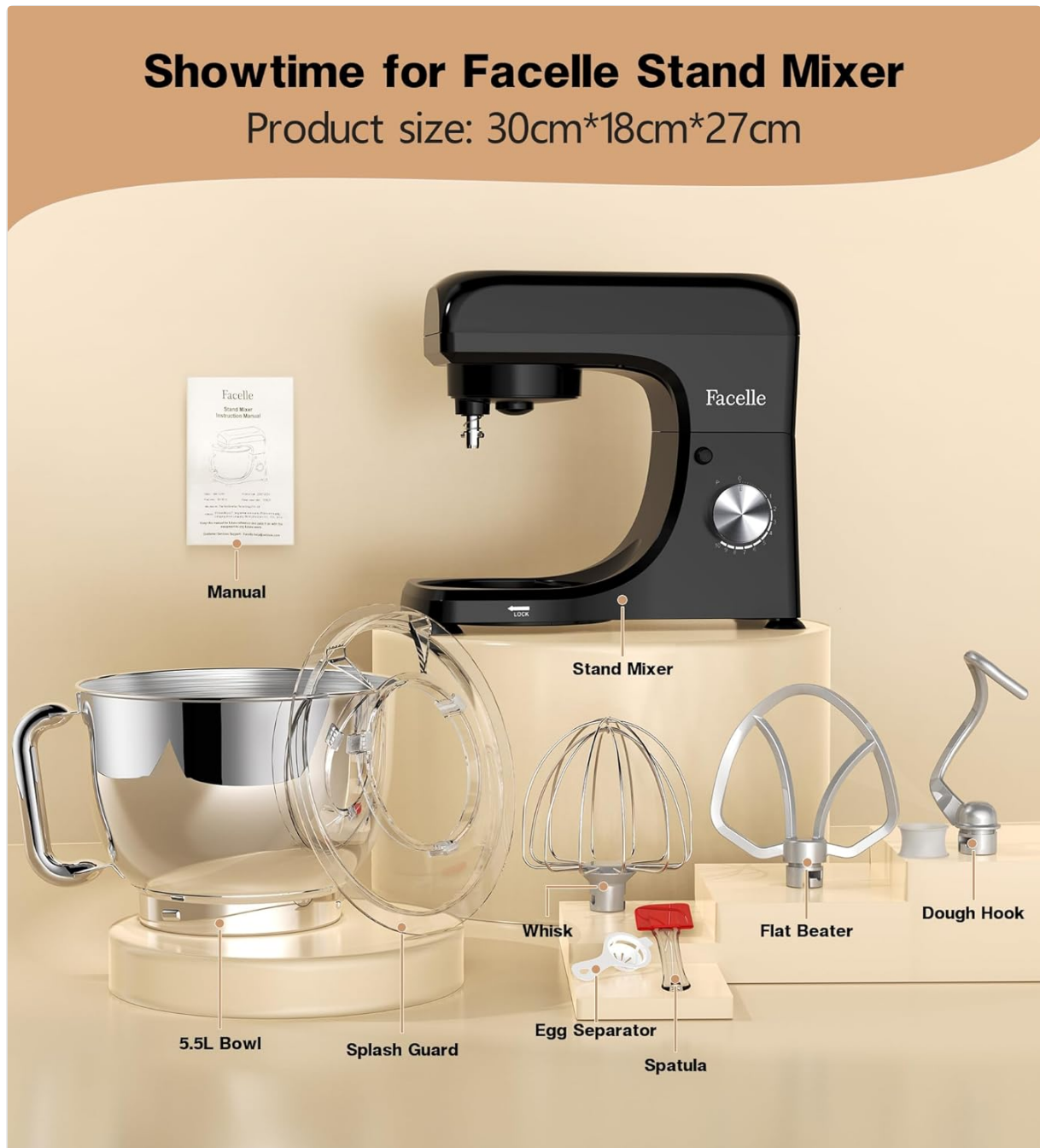
Figure 2.1: Main components of the Facelle Stand Mixer. Includes the mixer unit, 5.5L stainless steel bowl, splash guard, whisk, flat beater, dough hook, egg separator, spatula, and instruction manual.

The Facelle SM-1521X Stand Mixer is designed for various kitchen tasks, from kneading dough to whipping cream. Familiarize yourself with its components: