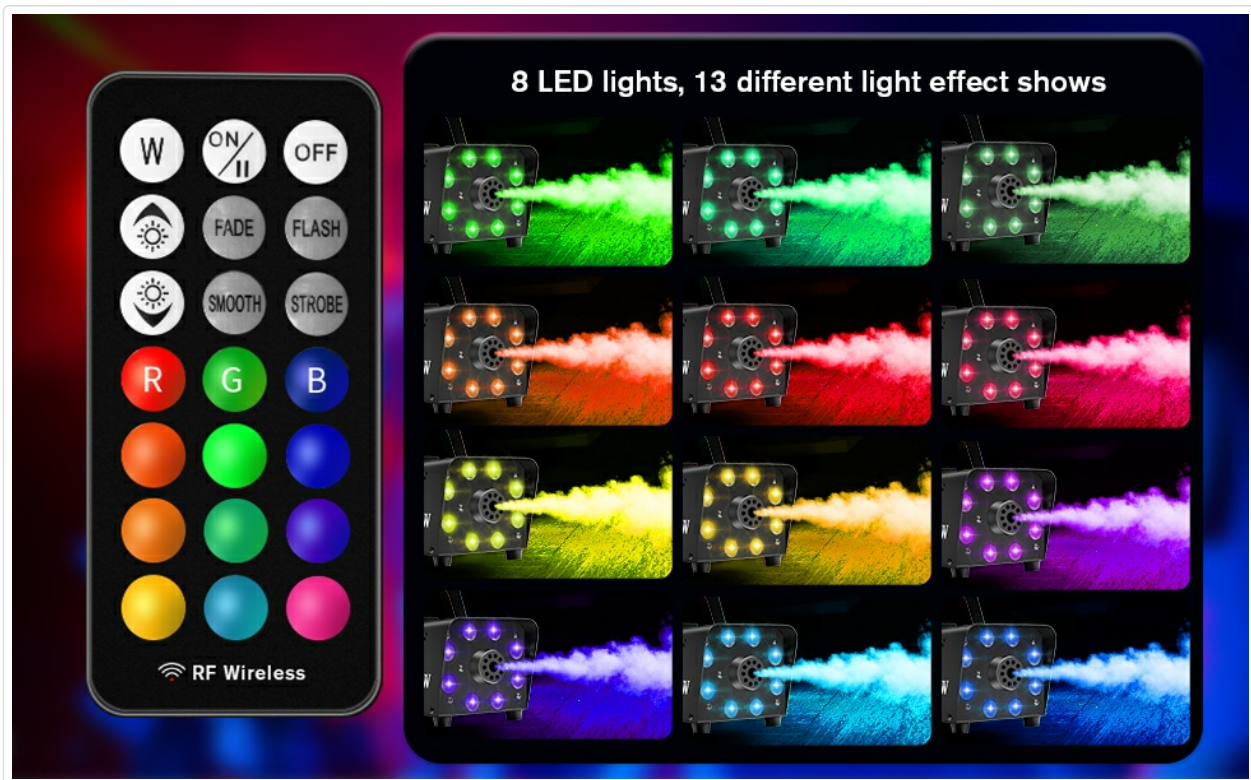
Figure 6.3: This image displays various colored fog outputs, demonstrating the 13 different color effects achievable with the 8 LED lights, including red, green, blue, purple, yellow, and cyan.