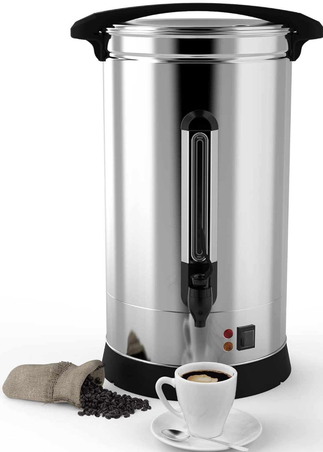
Figure 4: Illustration of the urn's quick brewing capability: 60 cups in 40 minutes.