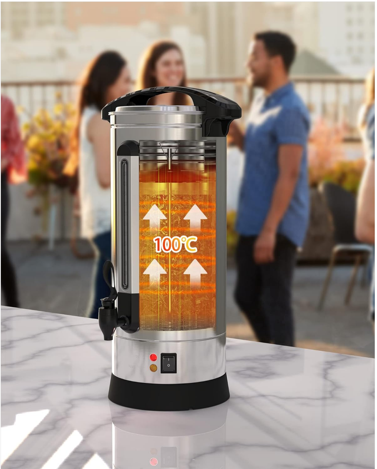
Figure 2: Internal heating process of the coffee urn, illustrating efficient water heating.