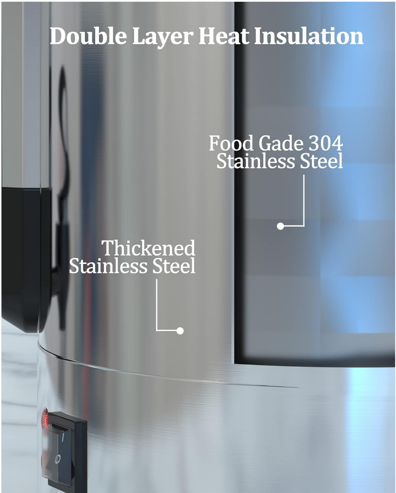
Figure 6: Detail of the urn's double-layer heat insulation and 304 stainless steel construction.