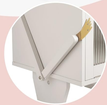
Lovely Side Swinging Arms