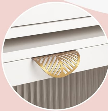
Sophisticated Gold-Toned Pull