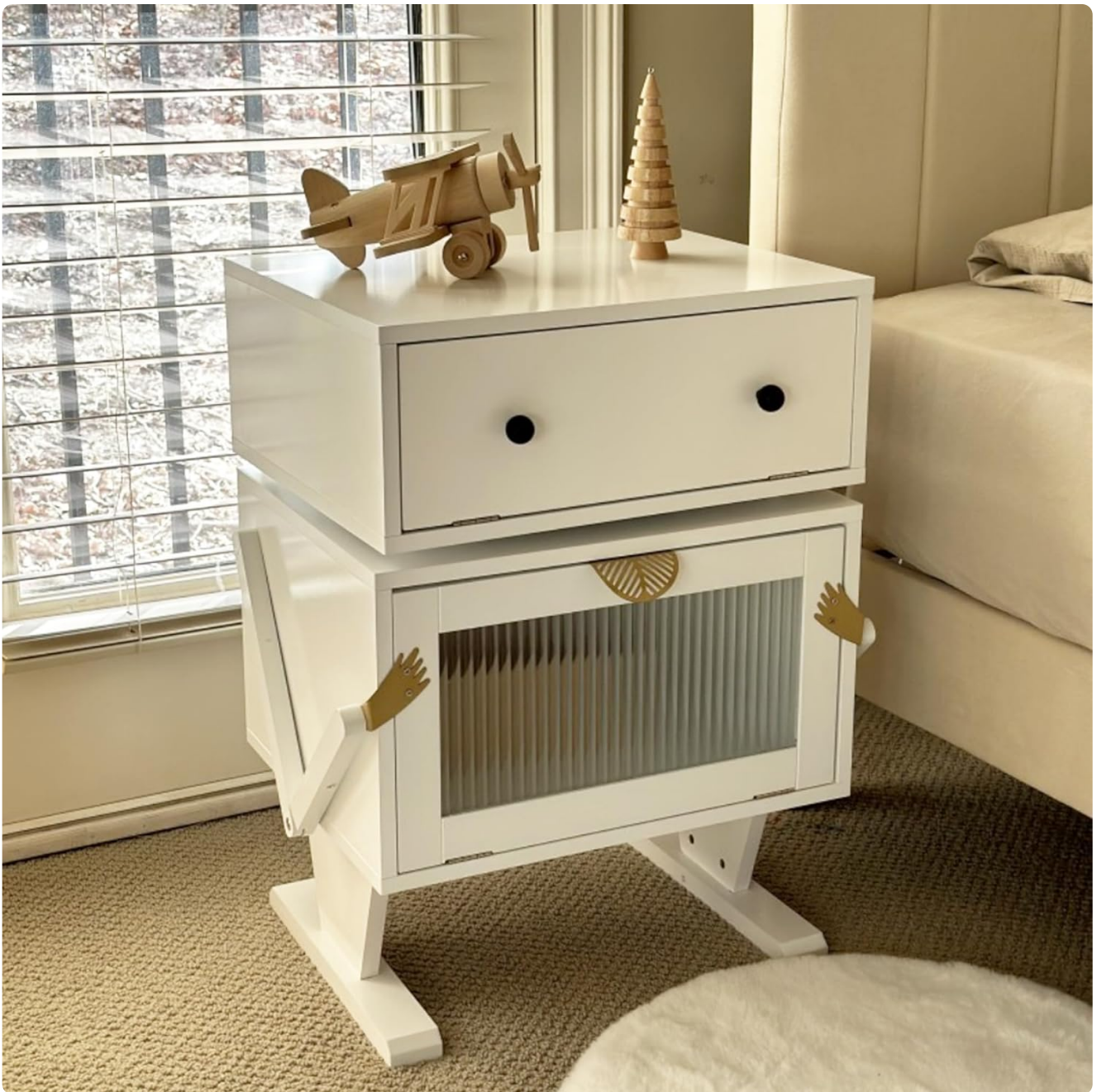
Figure 1: RoyalCraft Nightstand with LED Light Strips in a bedroom.