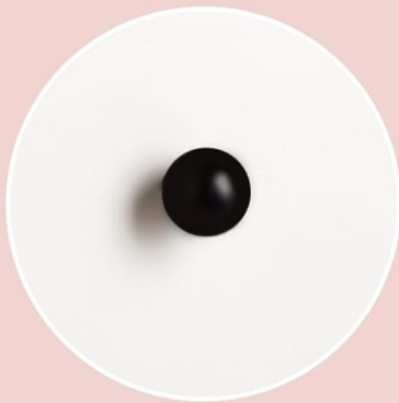
Black Round Handles