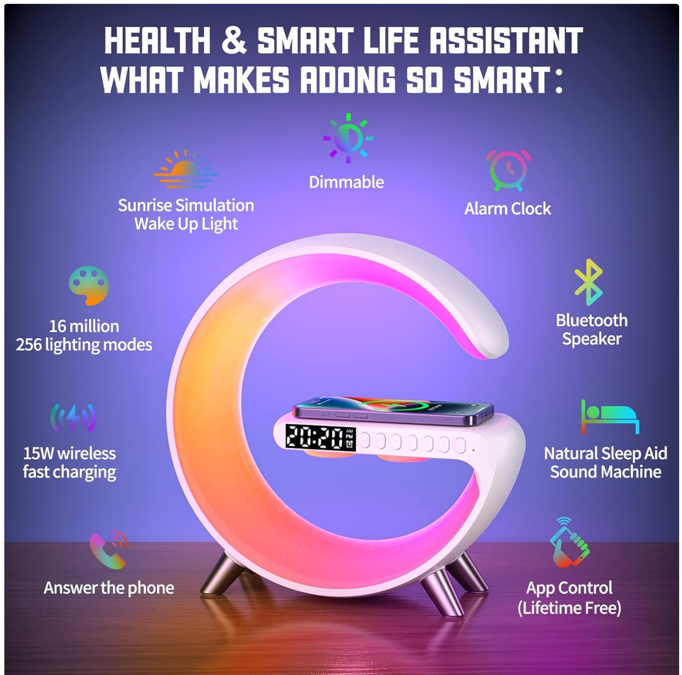
Figure 2: Visual representation of the device's core functionalities, highlighting its role as a health and smart life assistant.