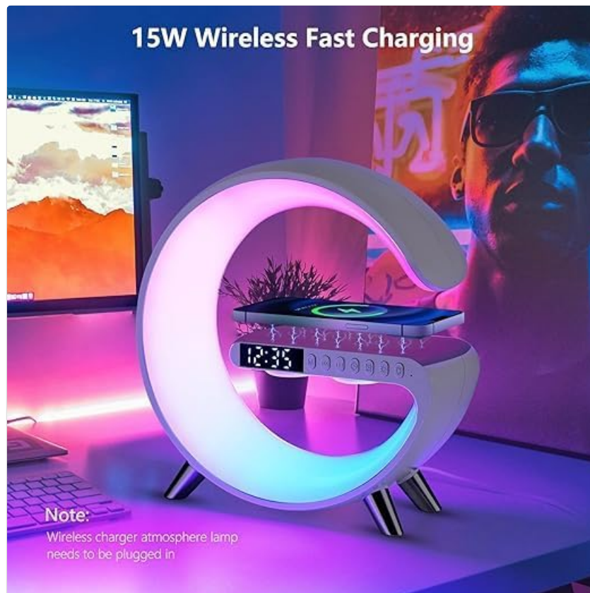
Figure 3: The device in operation, demonstrating wireless charging and its need for a power connection.