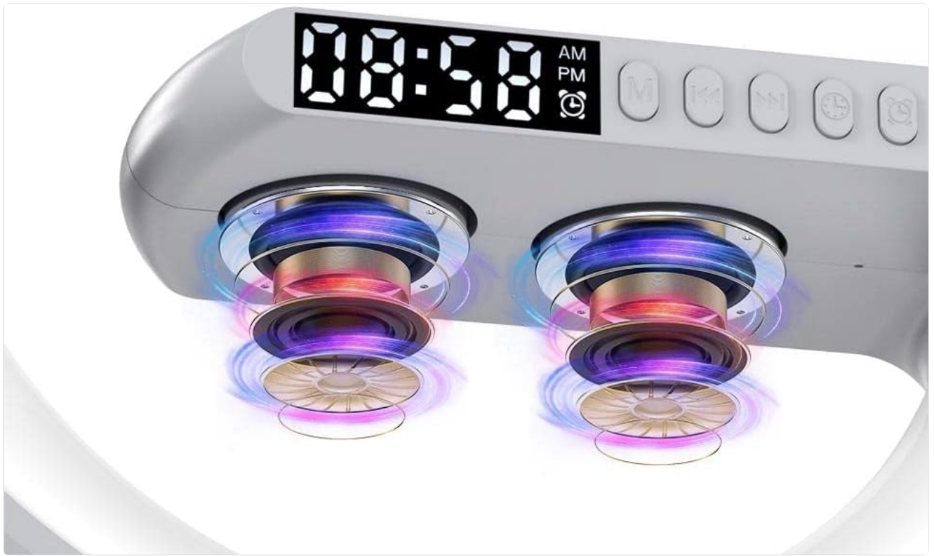
Figure 4: Internal speaker components, illustrating the audio capabilities for Bluetooth connectivity.