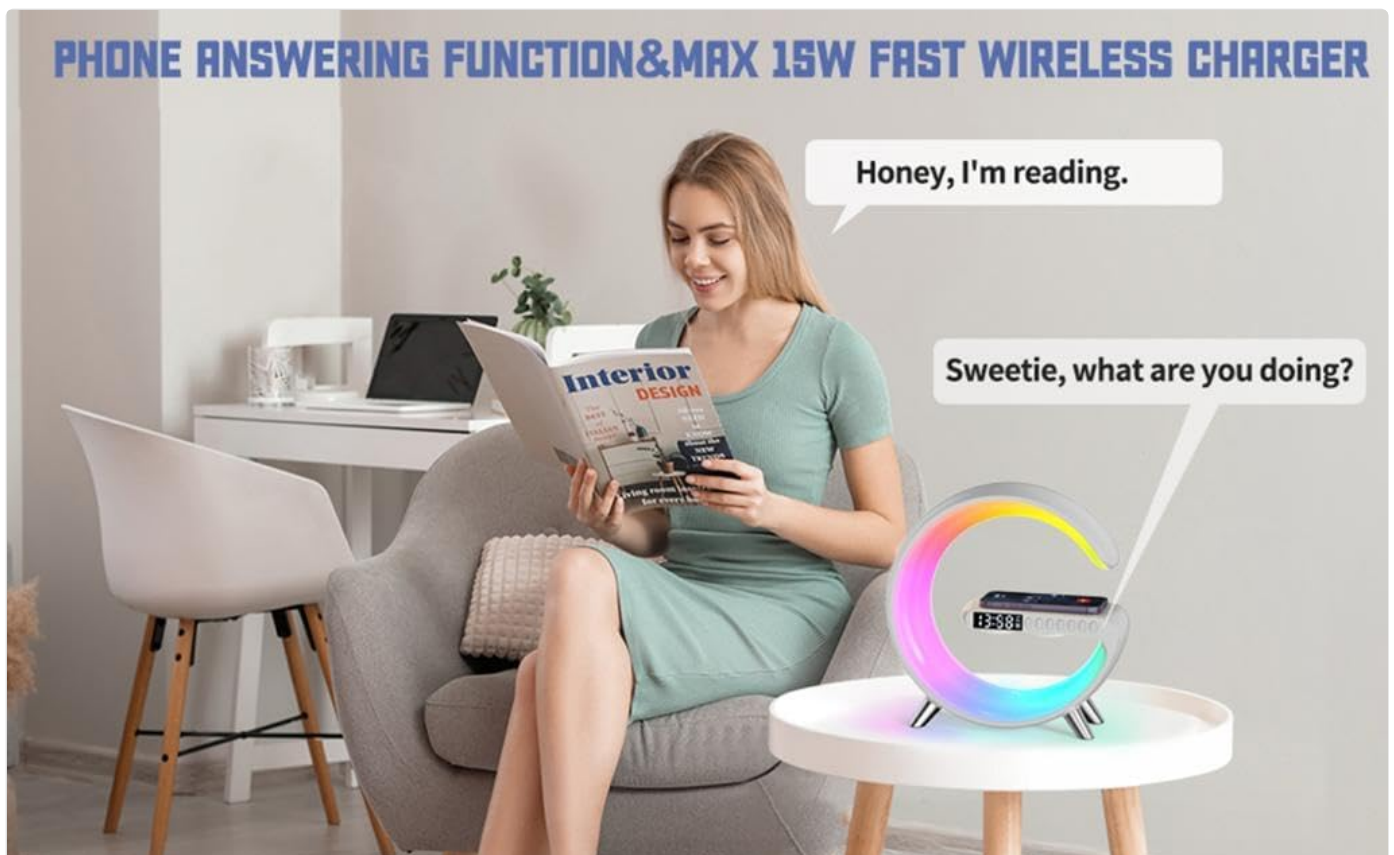
Figure 6: Demonstrating the 15W fast wireless charging and phone answering capabilities.