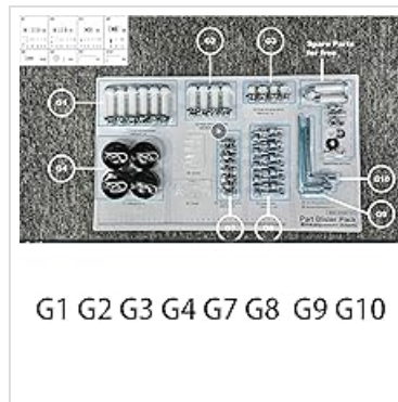
Image 3.1: Detailed view of the hardware package, including various bolts, washers, and tools.