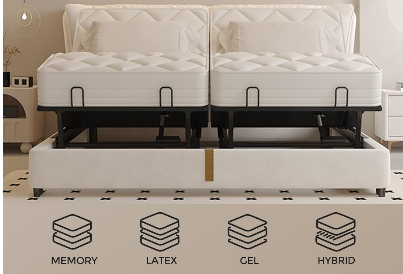
Image 6.3: Mattress compatibility with memory foam, latex, gel, and hybrid types.

Recommended for memory foam, latex, gel, or hybrid mattresses, our adjustable bed base fits directly into bed frames.