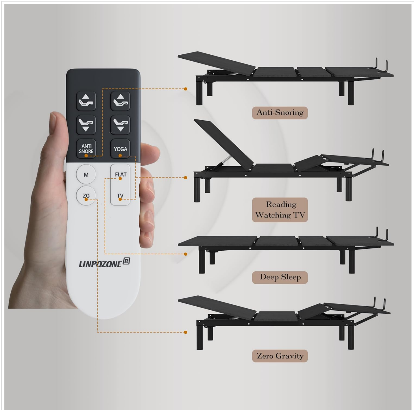
Image 5.1: Wireless remote control with buttons for Anti-Snore, Yoga, Flat, TV, Zero Gravity, and memory presets.

Your QFP Adjustable Bed Frame is operated using a wireless remote control. Familiarize yourself with the remote's functions to customize your comfort.