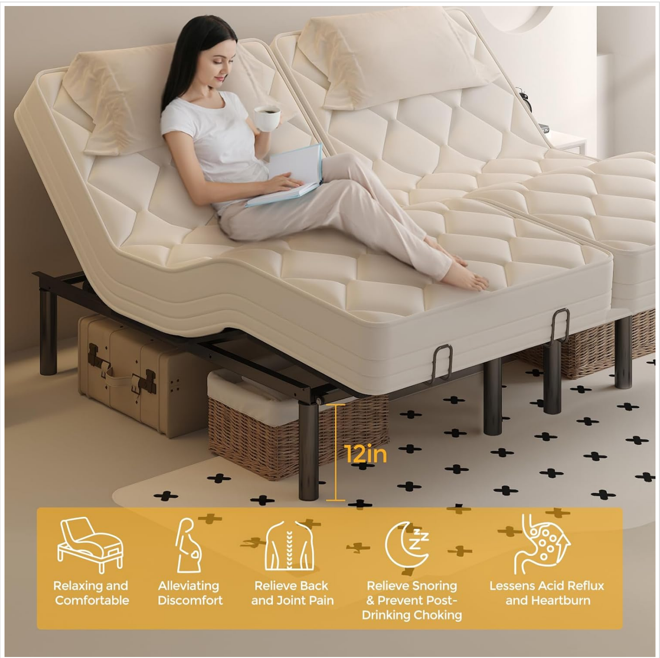
Image 6.2: Visual representation of the health benefits and comfort provided by the adjustable bed frame, including 12-inch under-bed clearance.