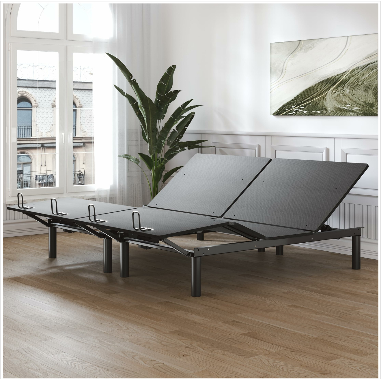
Image 1.1: Adjustable head and foot incline with dimensions and 1000 lbs weight capacity.