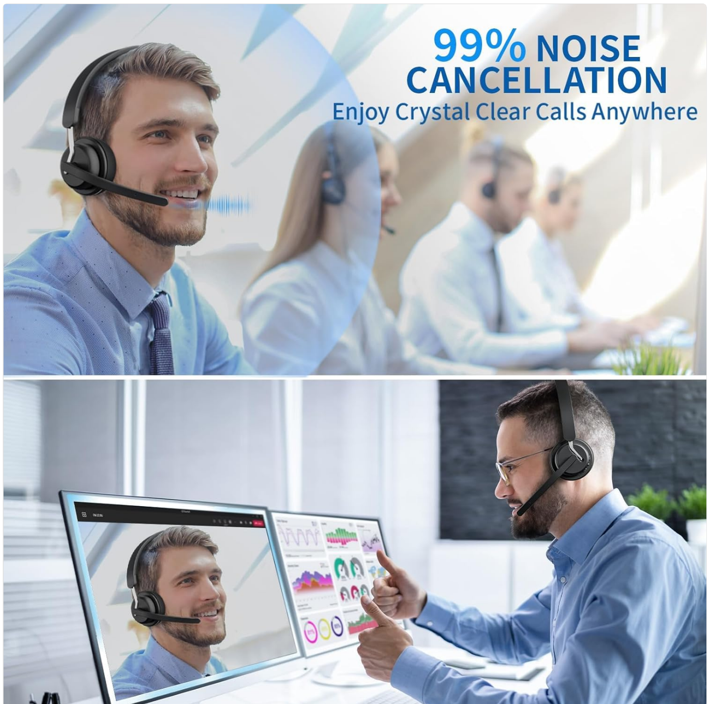
Figure 3.5: 99% AI Noise Cancellation. The advanced AI noise-cancelling microphone effectively reduces background noise, ensuring clear voice transmission in noisy environments, such as busy offices or call centers.