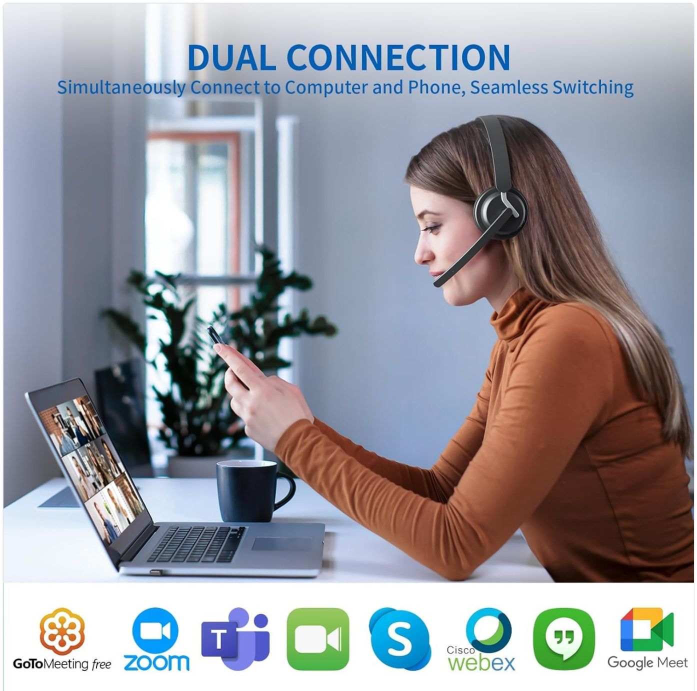
Figure 3.2: Dual Connection Capability. The headset can simultaneously connect to both a computer (via USB dongle) and a mobile phone (via Bluetooth), allowing for seamless switching between devices for calls and audio.