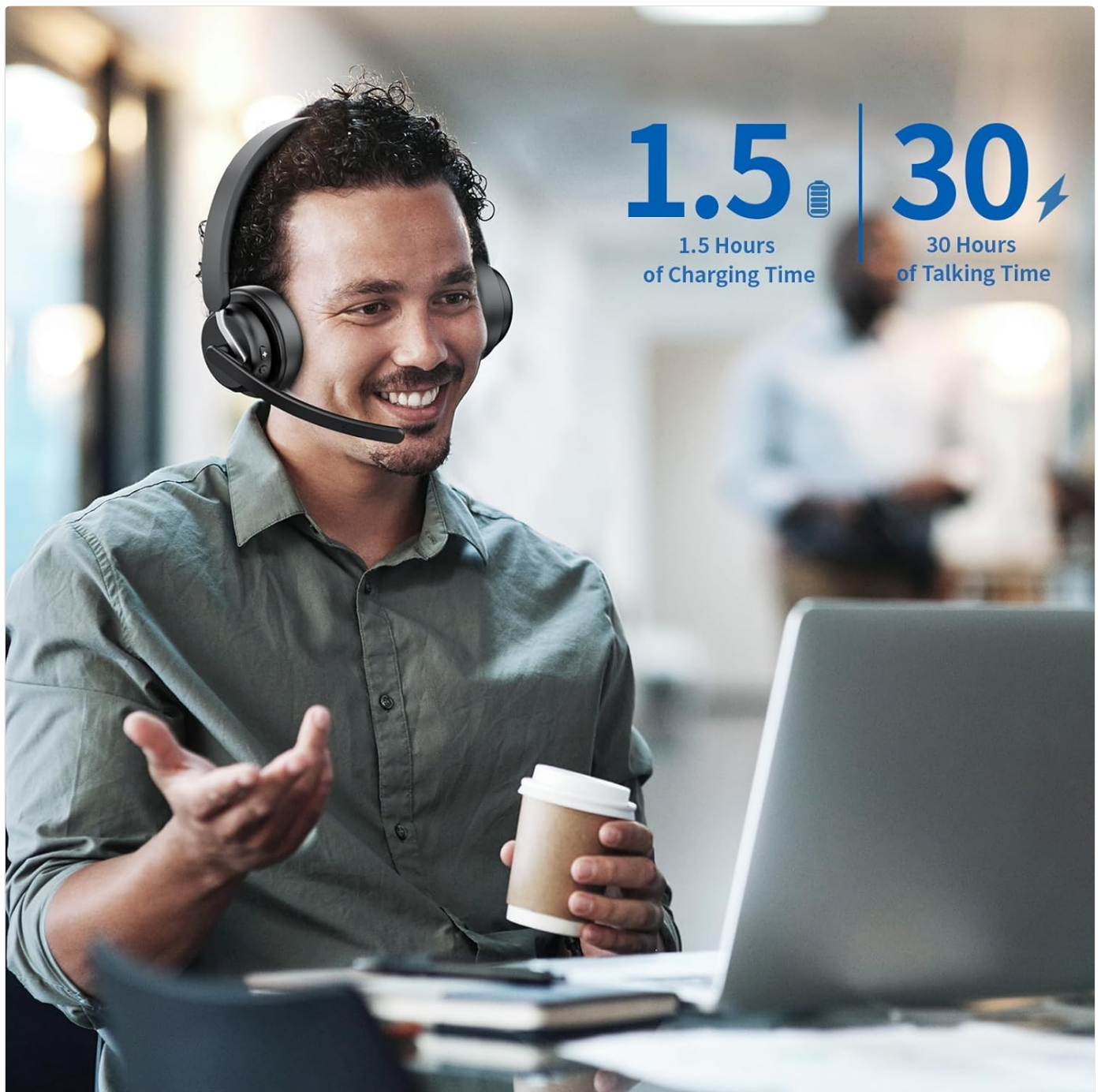
Figure 3.4: Efficient Power Management. The headset offers approximately 30 hours of talk time on a full charge, with a rapid charging time of about 1.5 hours.