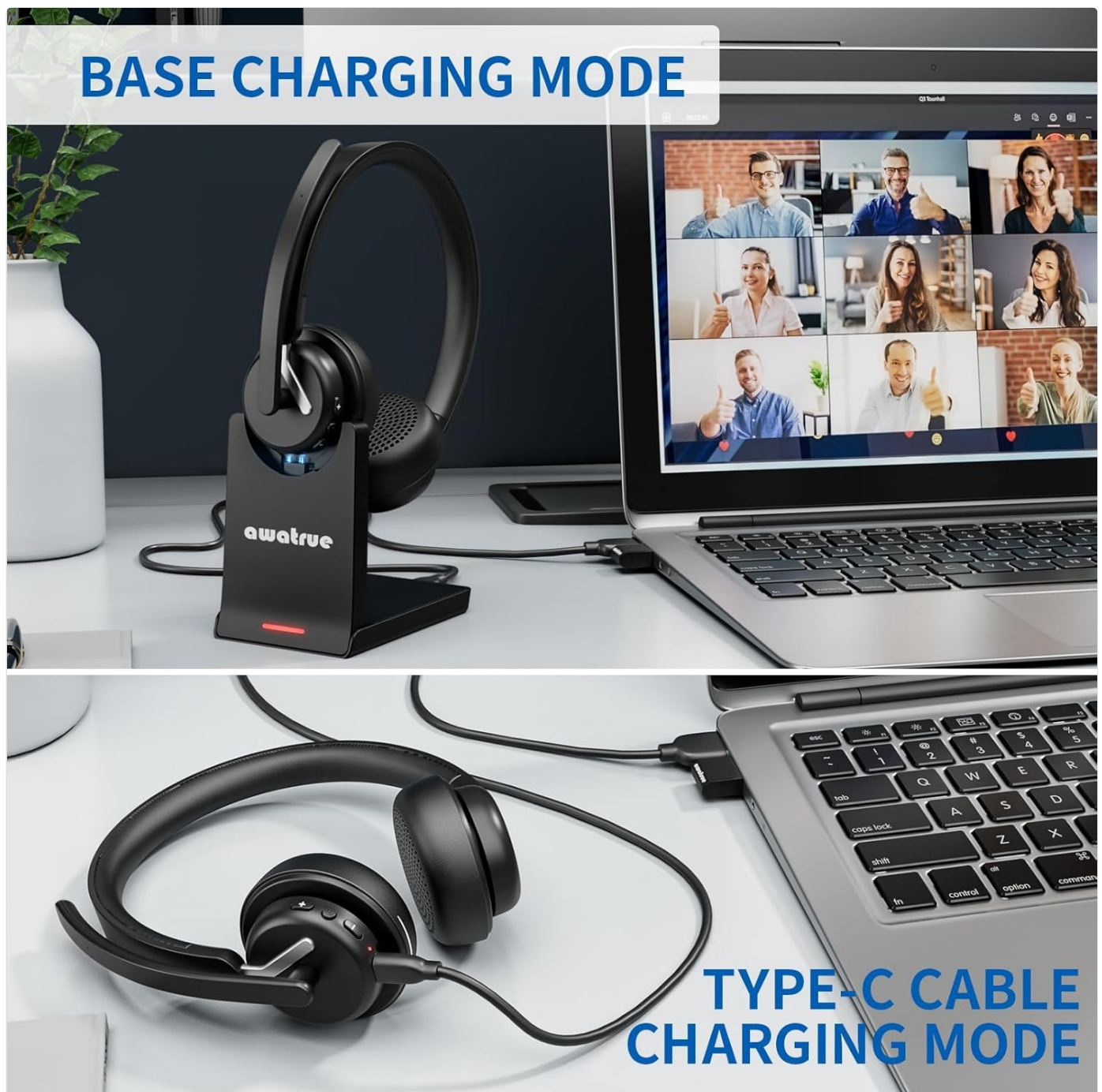
Figure 3.6: Versatile Charging Options. The headset can be charged conveniently using the included charging base or directly via a USB Type-C cable connected to the headset.