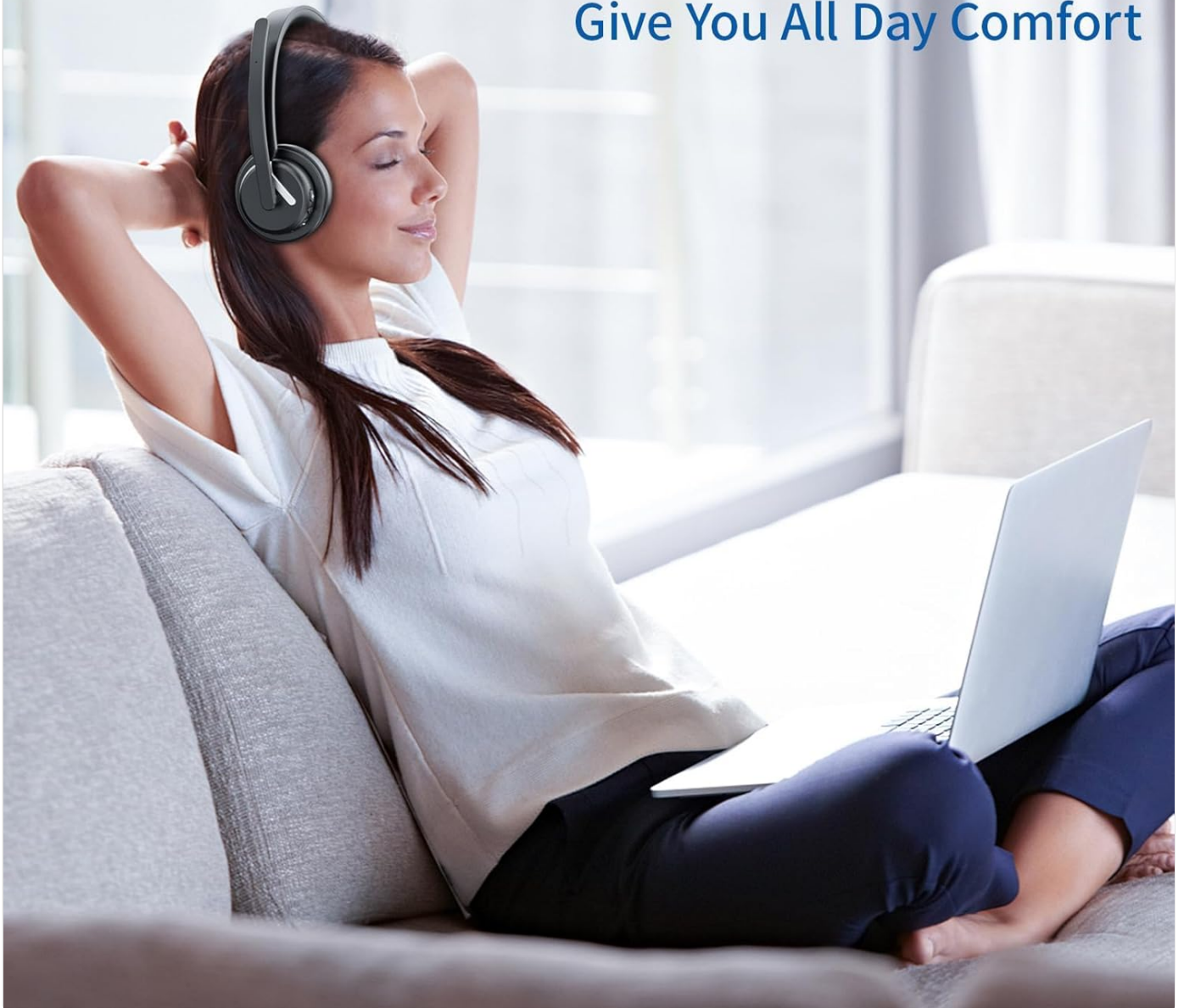
Figure 3.3: Ergonomic Design for All-Day Comfort. The awatru headset is designed with padded earcups and a lightweight frame to ensure comfort during extended periods of use.