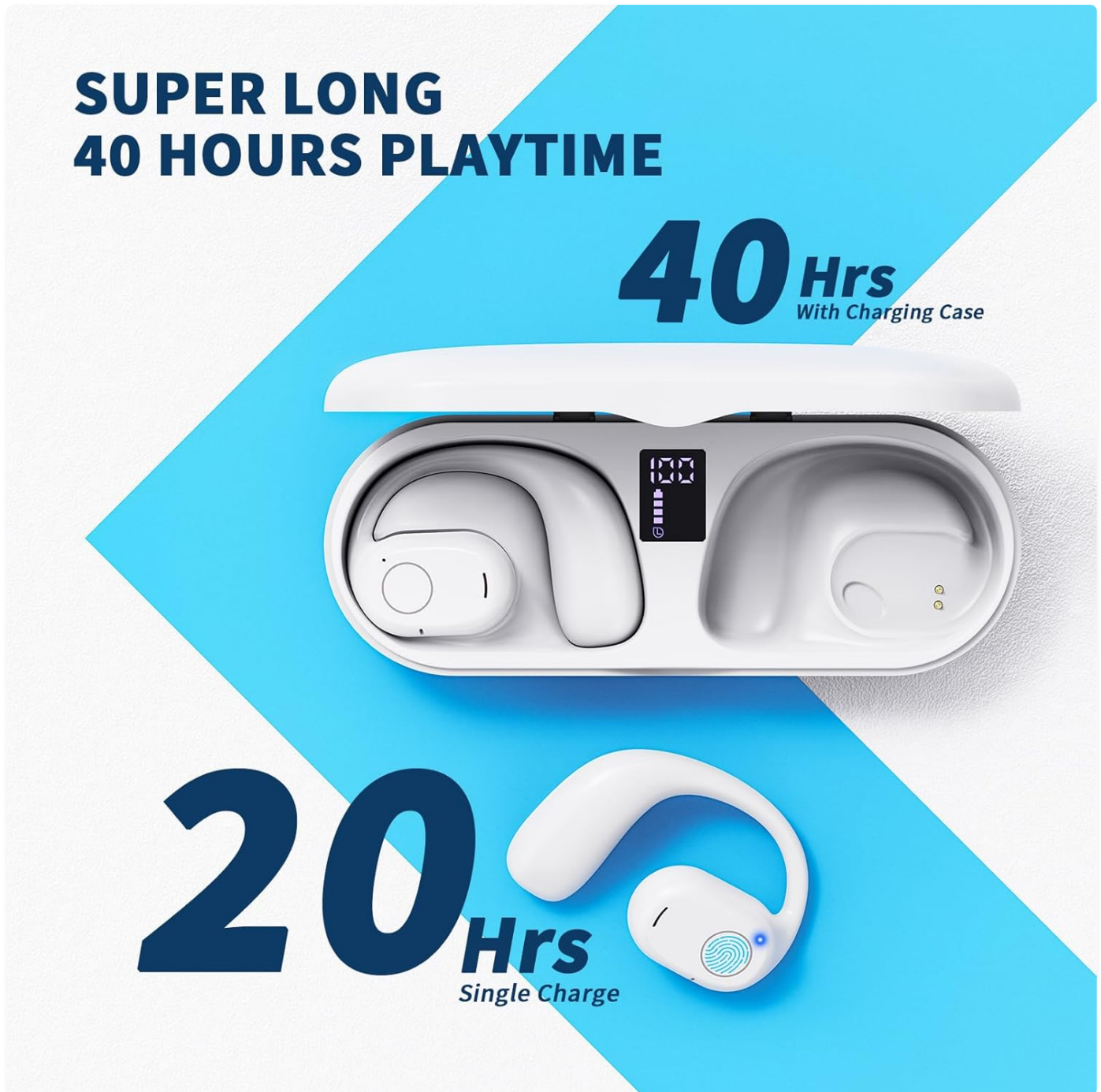
Image: The charging case with earbuds inserted, displaying the battery percentage of the case and individual earbud charge levels.