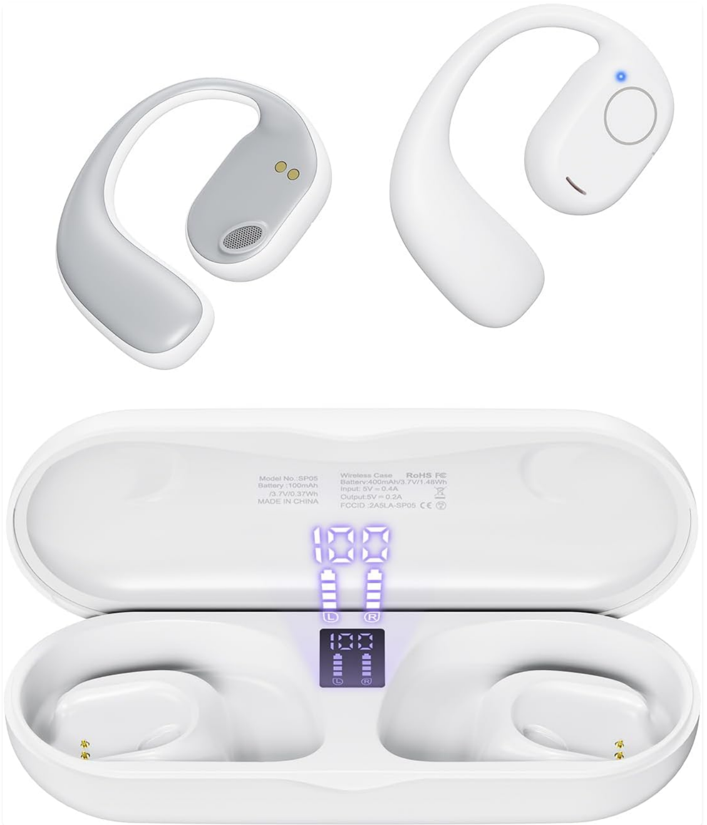
Image: The PSIER Open Ear Bluetooth Headphones, showing both earbuds and the open charging case with a digital display.