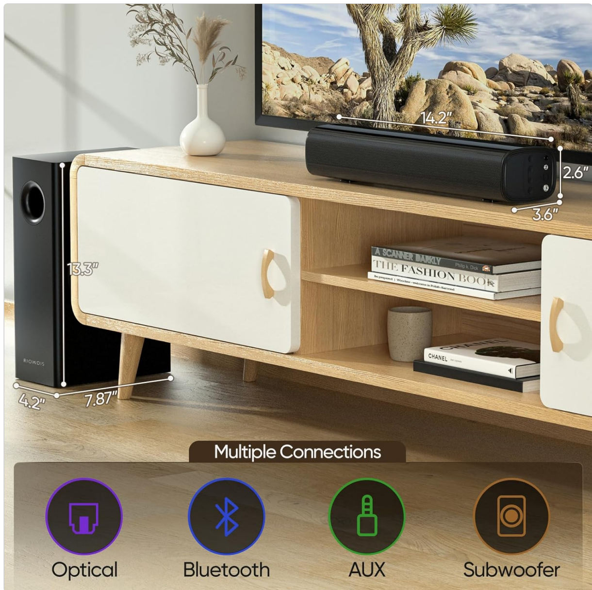
Image: Displays the compact dimensions of the soundbar and subwoofer, along with icons for Optical, Bluetooth, AUX, and Subwoofer connections.