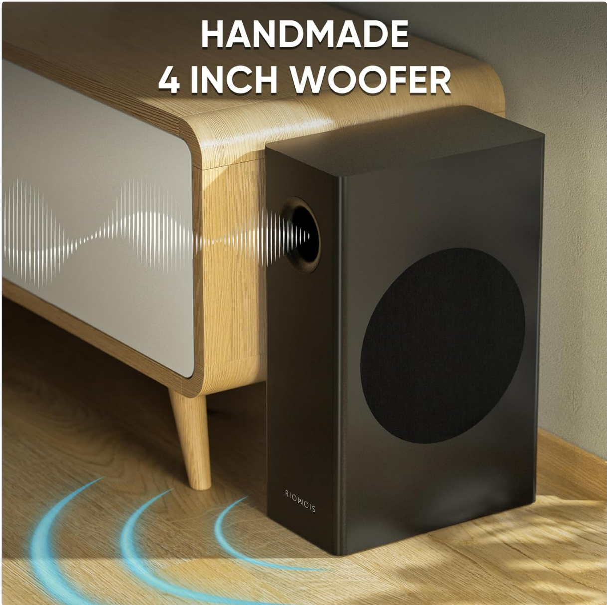
Image: A close-up view of the 4-inch wired subwoofer, highlighting its design and port.