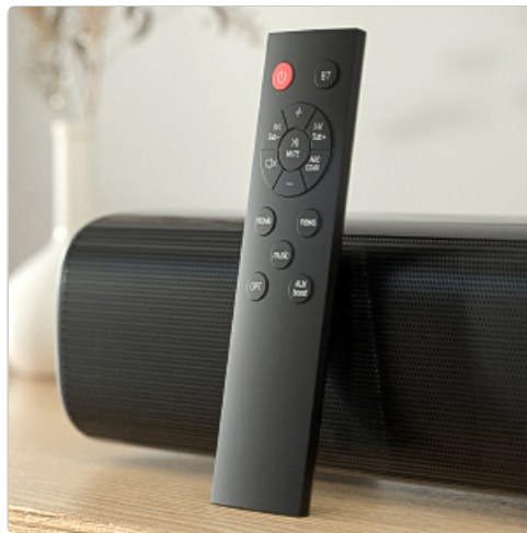
Image: A close-up of the remote control, showing buttons for power, volume, input selection, and sound modes.