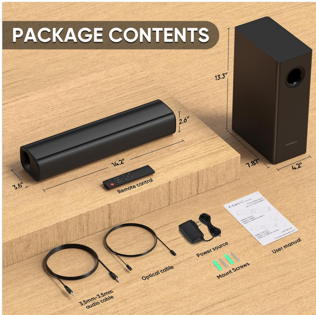
Image: All components included in the RIOWOIS DS6341 Soundbar package, including the soundbar, wired subwoofer, remote, cables, and user manual.