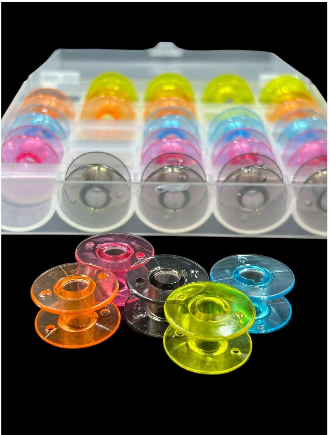
Figure 3: A close-up view of individual bobbins, showcasing their translucent colors.