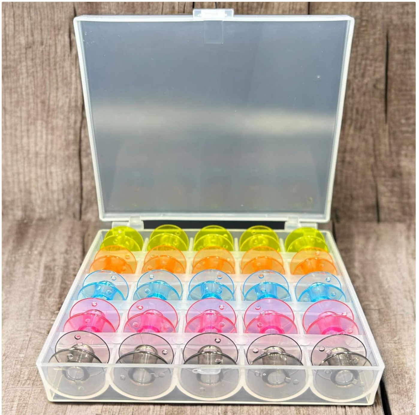
Figure 1: The ZENITH bobbin set with the case open, displaying 25 bobbins in various colors.