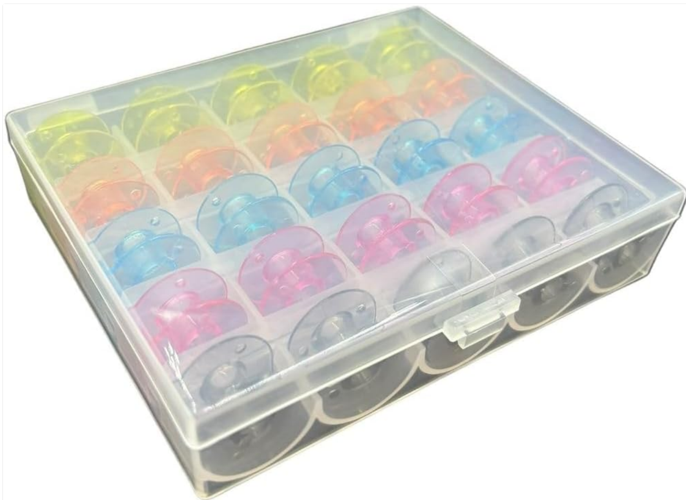
Figure 2: The compact plastic storage case, closed, protecting the bobbins.