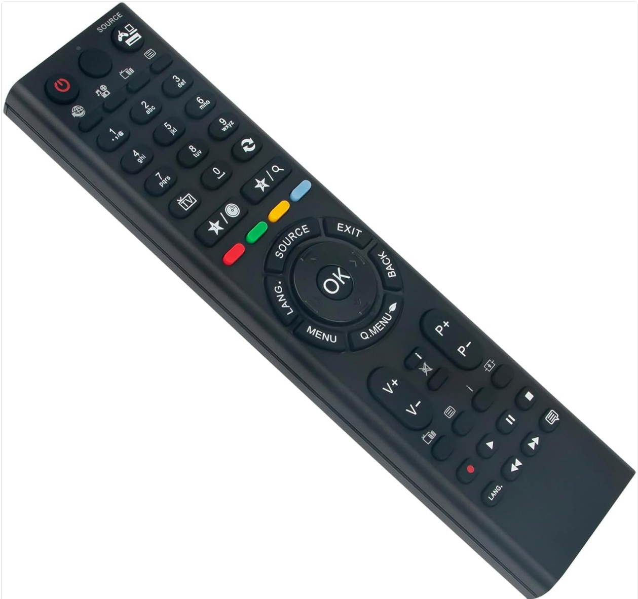
Figure 1: Front view of the remote control, displaying the power button, number pad, navigation keys, volume, channel controls, and special function buttons.

The ALLIMITY MM-S3913R-NP remote control is designed for ease of use and ergonomic comfort. It features a lightweight design and provides stable remote control performance with a transmission distance of up to 10 meters.