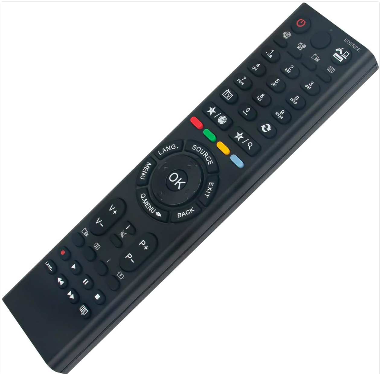
Figure 2: Angled view of the remote control, illustrating its slim profile and button layout from a different perspective.