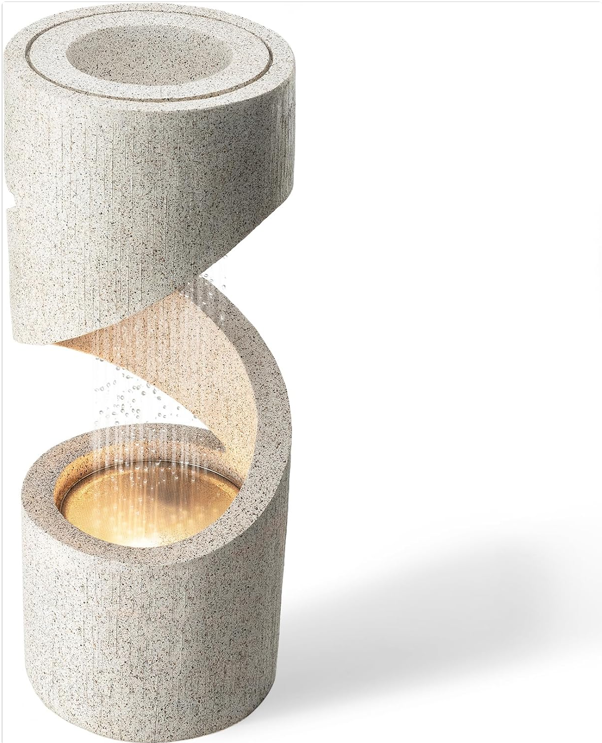
Image: A close-up view of the fountain's lower basin, showing the warm LED light illuminating the cascading water, creating a tranquil effect.