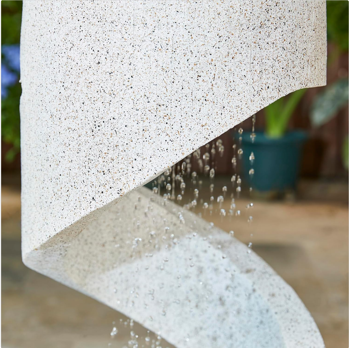
Image: A detailed view of the water gracefully flowing down the spiral structure of the fountain, highlighting the texture of the faux terrazzo finish.