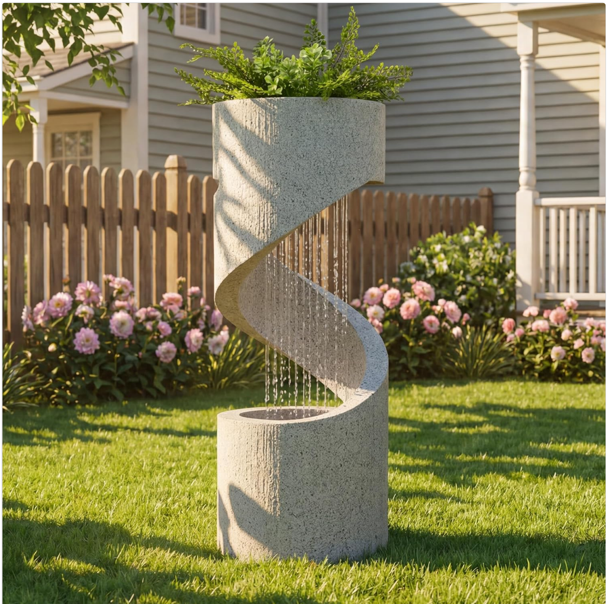
Image: The Glitzhome Outdoor Water Fountain set up in a lush garden environment, showcasing its spiral design and integrated planter.