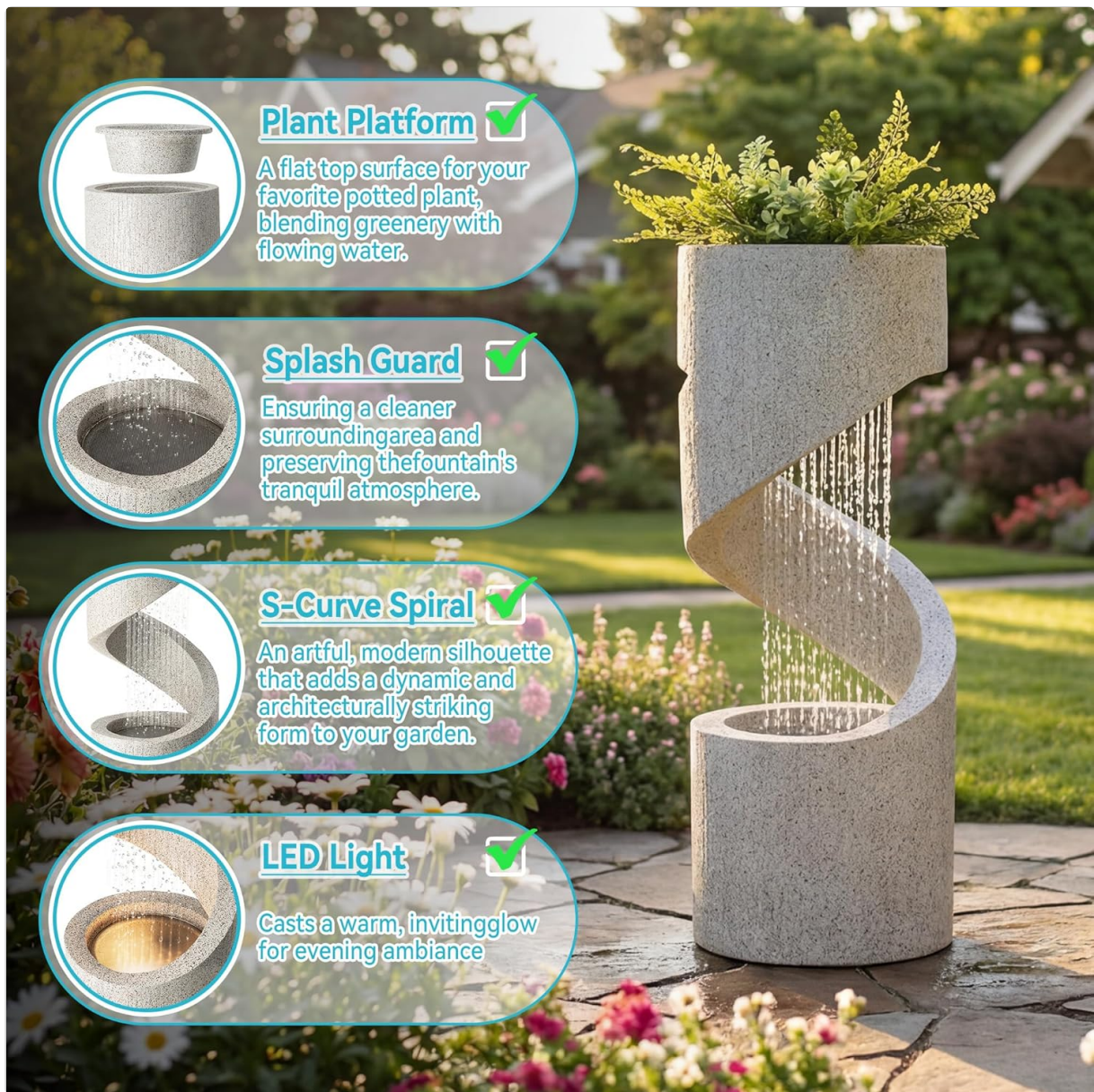
Image: A visual breakdown of the fountain's features, including the plant platform, splash guard, S-curve spiral design, and LED light.

Video: An official Glitzhome video demonstrating the decorative tiered outdoor water fountain in operation, highlighting its design and water flow.