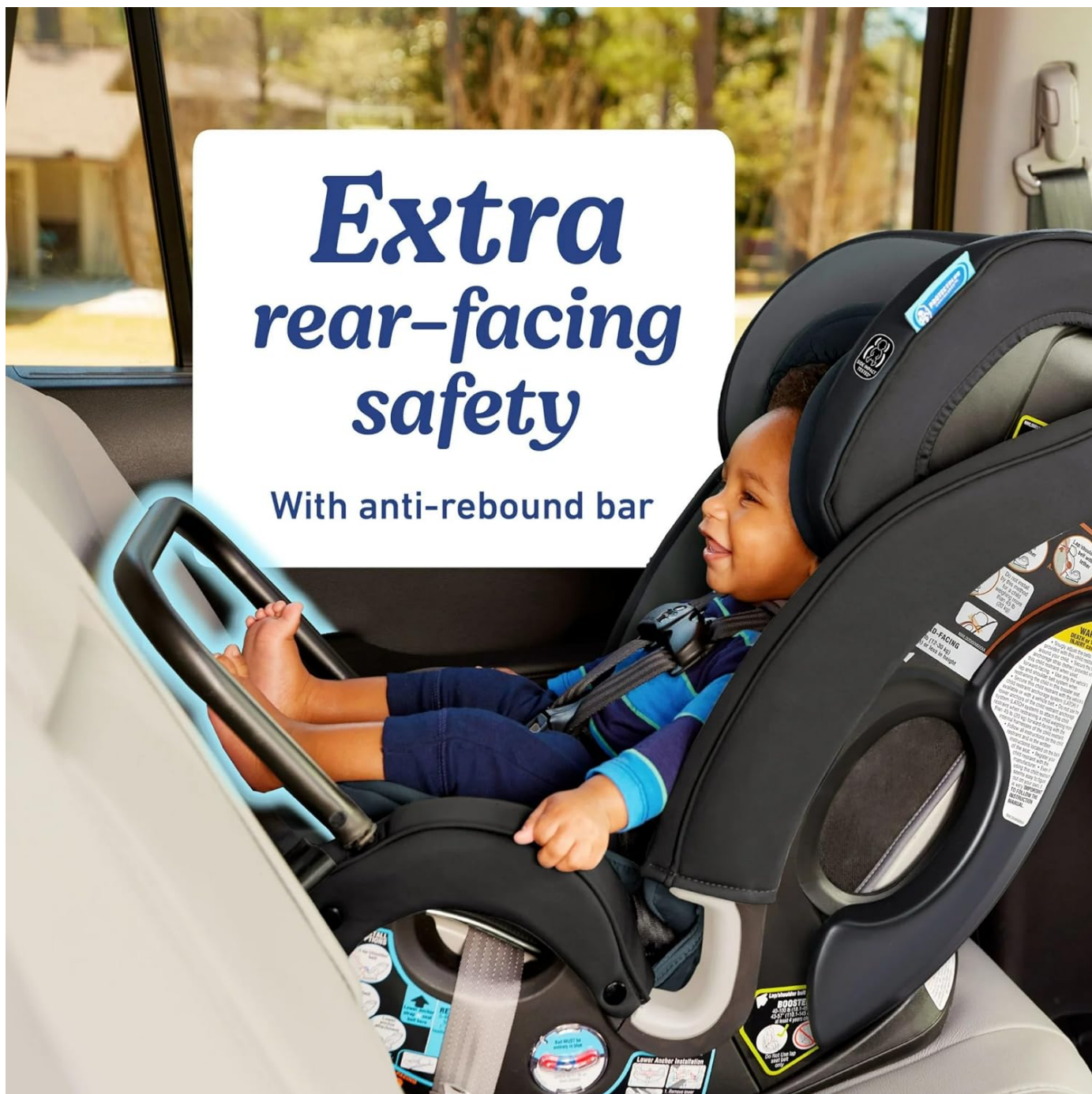
A child seated in the rear-facing position, highlighting the anti-rebound bar feature.