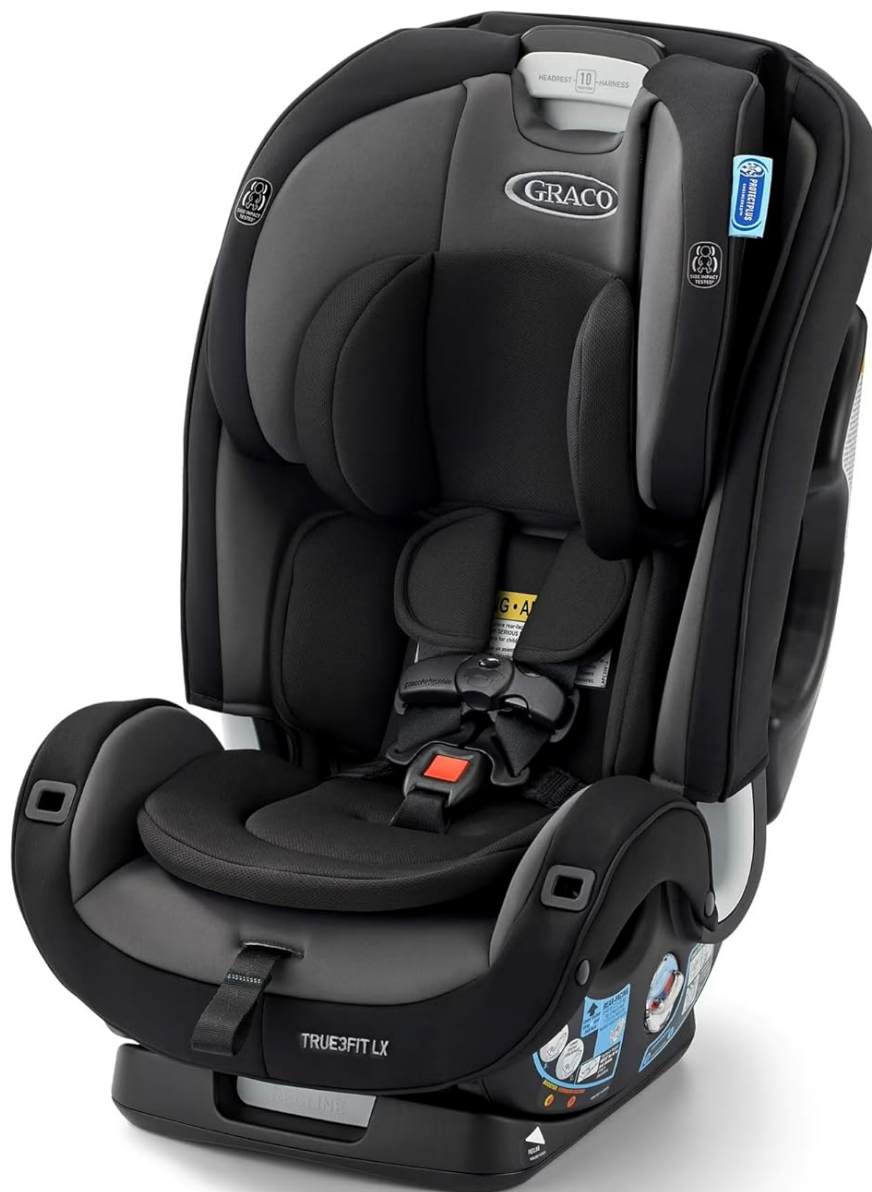
Front view of the Graco True3Fit LX 3-in-1 Slimfit Car Seat.