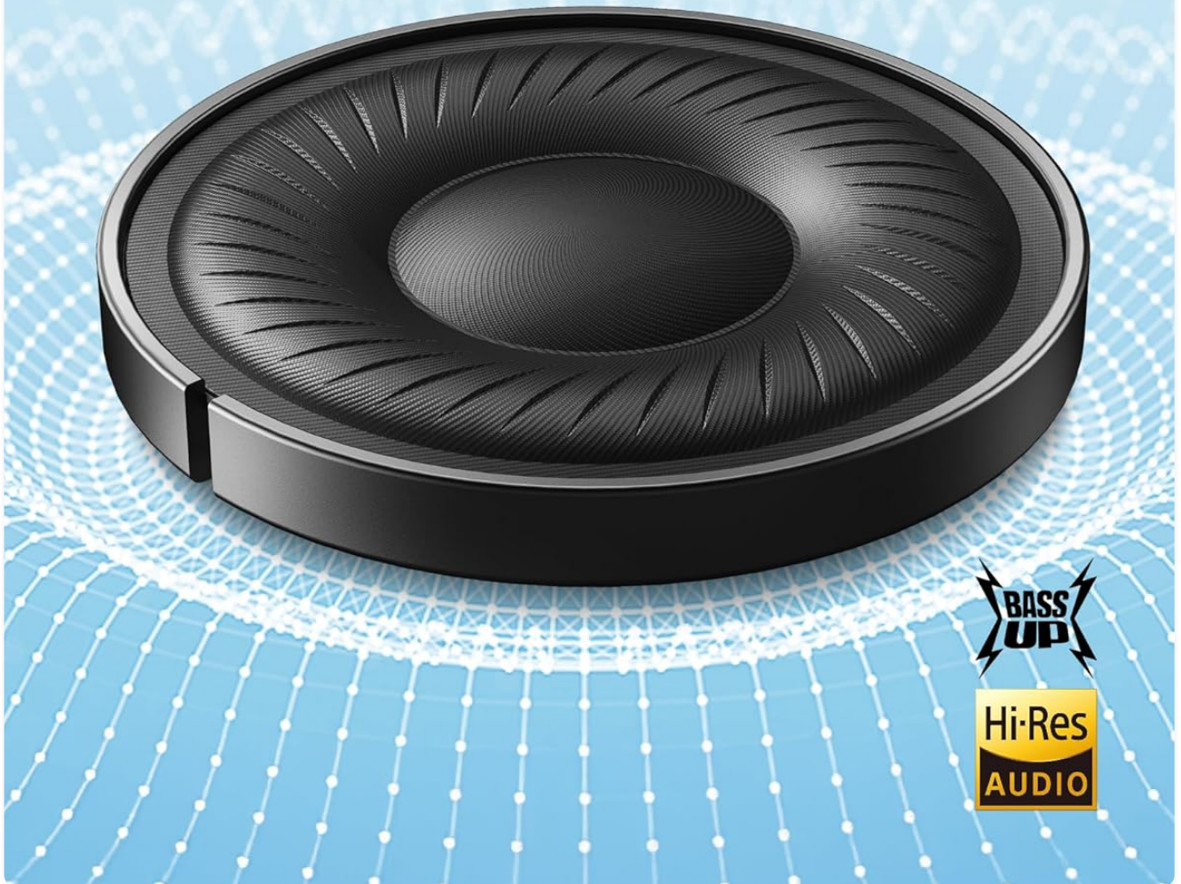
Image: A detailed view of the 40mm dynamic driver, highlighting the BassUp technology and Hi-Res Audio certification for superior sound quality.

40mm dynamic drivers deliver Hi-Res certified audio and thumping bass.