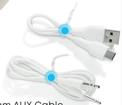
3.5mm AUX Cable

Image: The Soundcore Q20i headphones, a USB-C charging cable, and a 3.5mm AUX cable, as included in the product packaging.