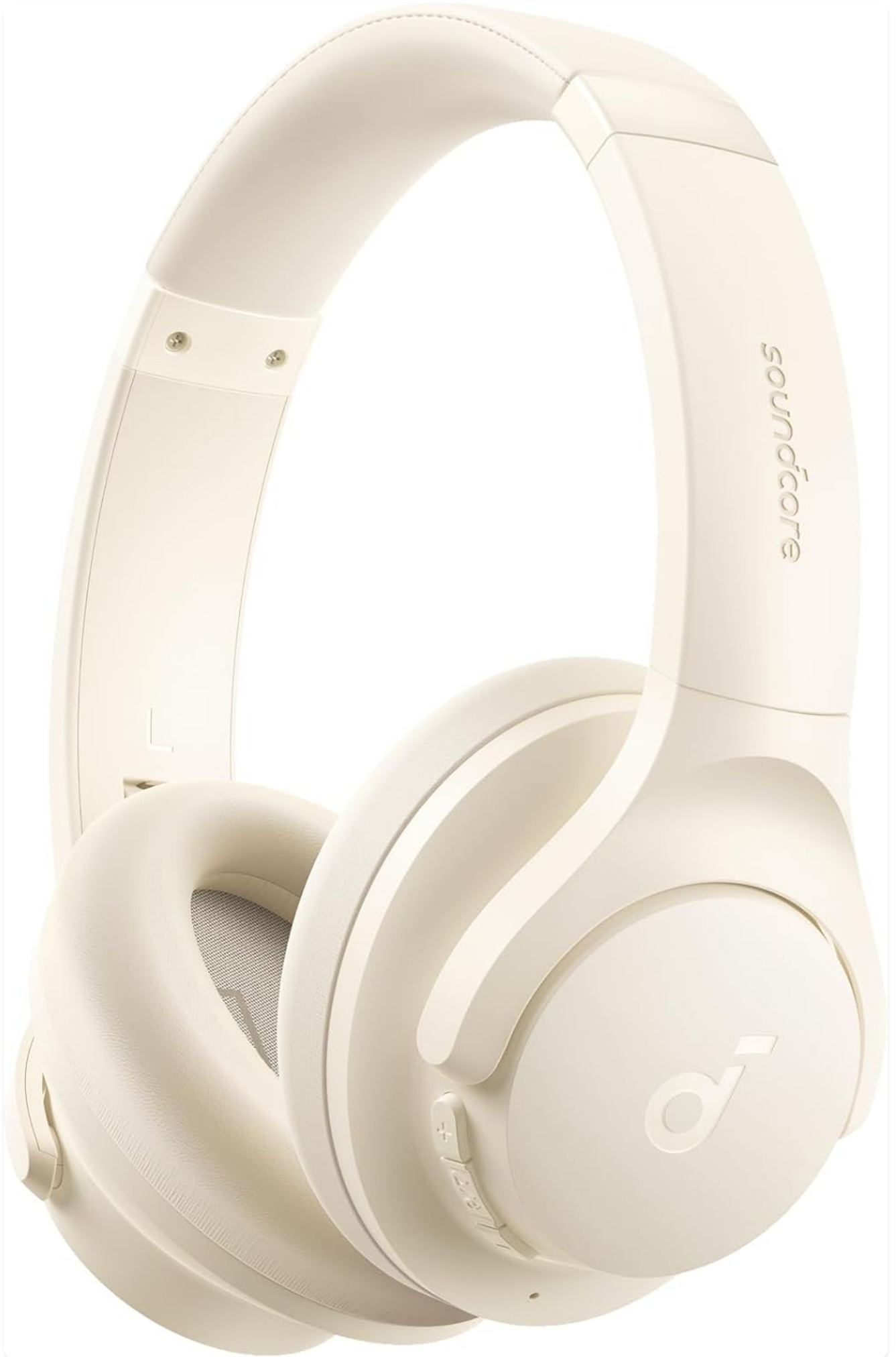
Image: Soundcore Q20i Hybrid Active Noise Cancelling Headphones in white, showcasing their sleek design.