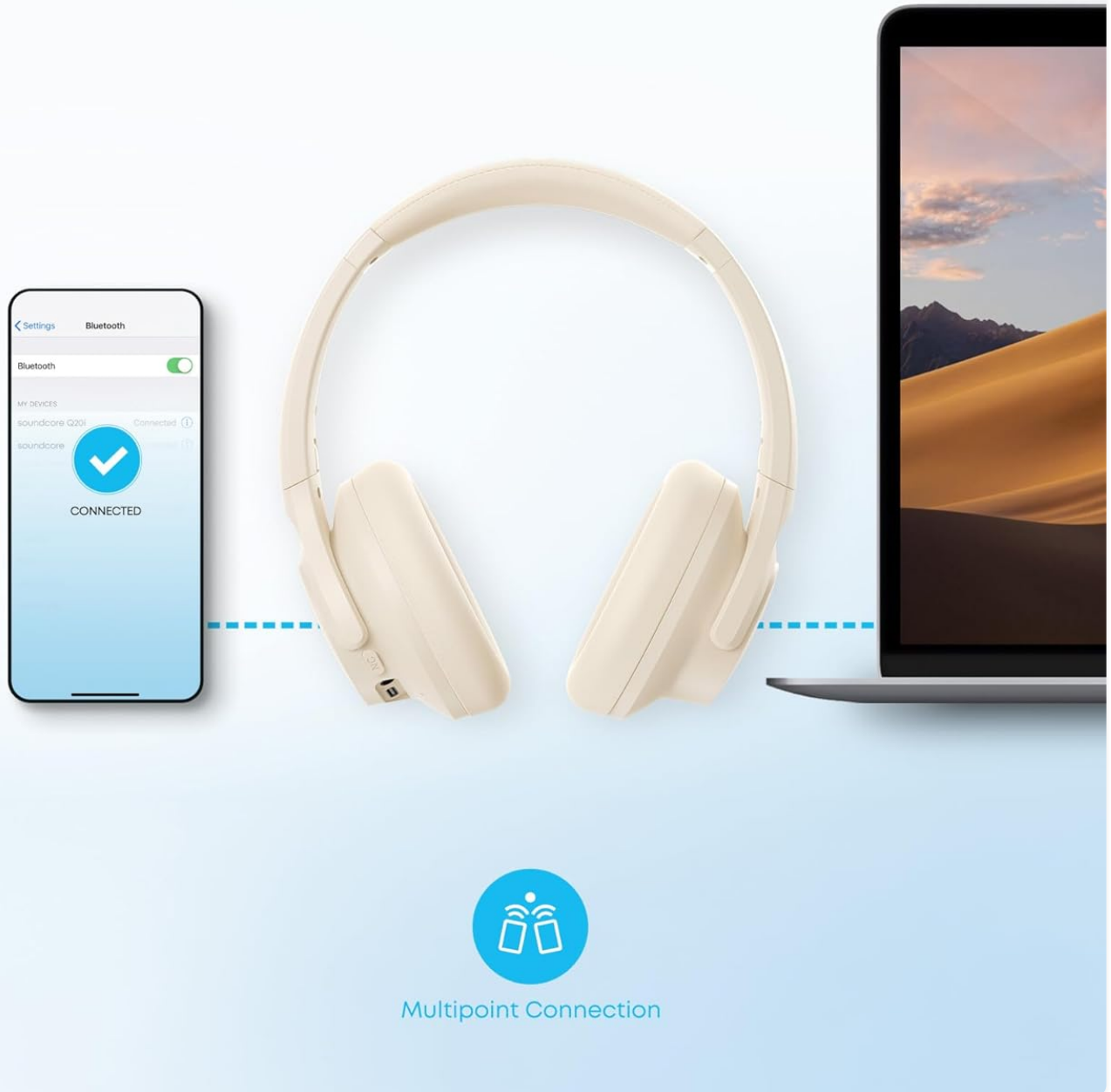
Image: Soundcore Q20i headphones wirelessly connected to both a smartphone and a laptop, illustrating the convenient dual-connection feature.

Connect to two devices simultaneously, and quickly switch between them.