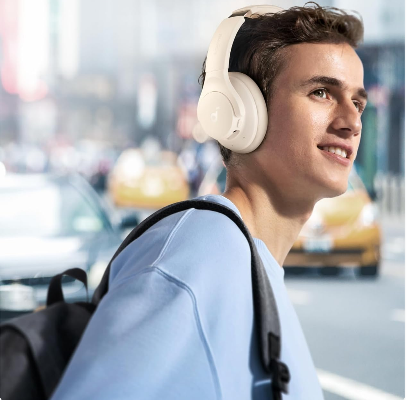
Image: A user wearing Soundcore Q20i headphones while navigating a busy city street, demonstrating the utility of Transparency mode for situational awareness.

Stay aware of your surroundings in Transparency mode.