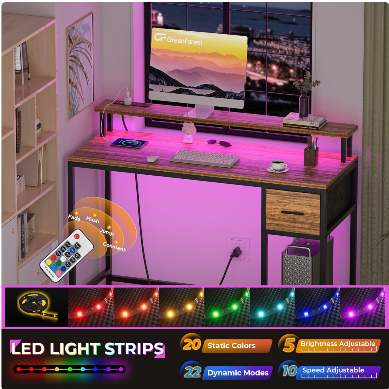
Image: The LED light strips under the monitor stand, displaying various color options and the remote control for adjustment.