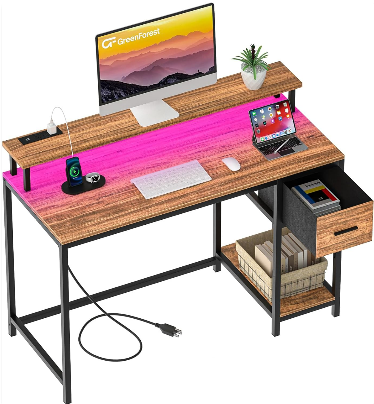
Image: The GreenForest 39-inch Computer Desk, featuring a monitor stand, LED lighting, and side storage, set up in a modern home office.