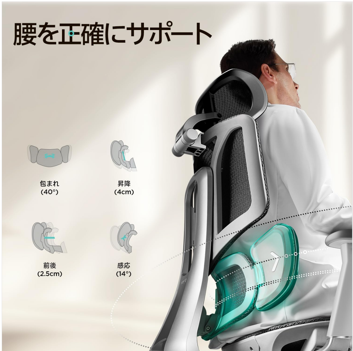
Image: Detailed view of the Hbada E3's adjustable 3-zone lumbar support system.