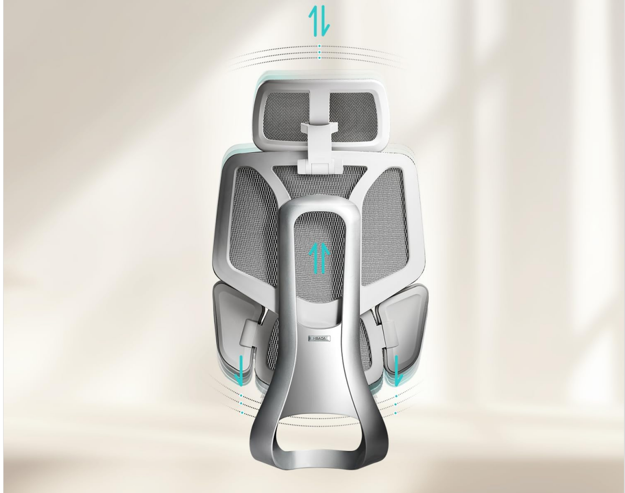
Image: Diagram illustrating the height, rotation, and tilt adjustments of the 3D headrest.