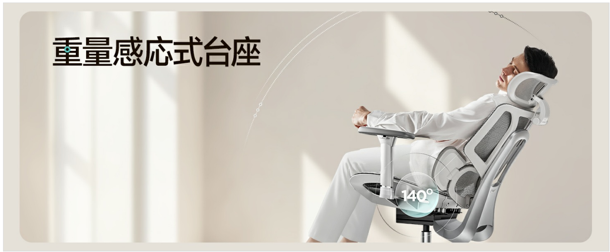
Image: A person demonstrating the 140-degree recline function of the Hbada E3 chair.