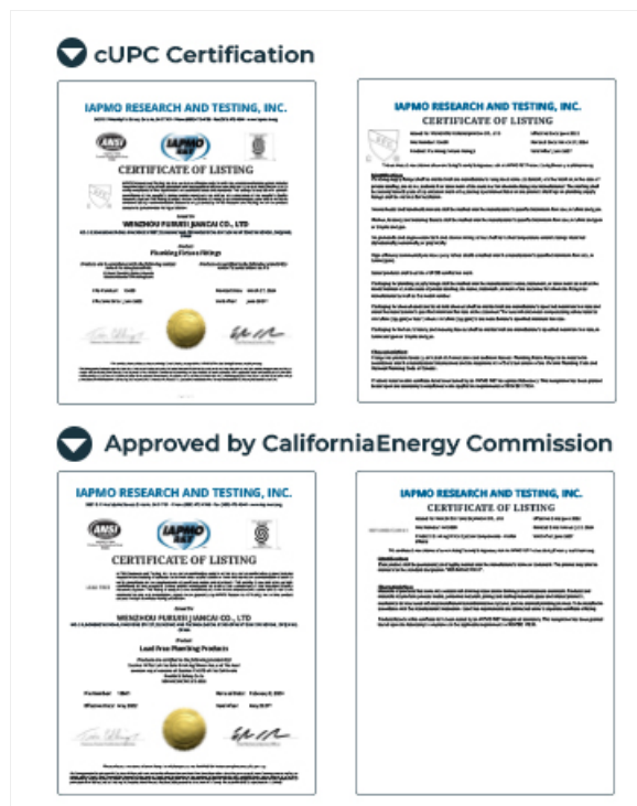
Figure 9: Image showing a cUPC certification document, indicating compliance with plumbing standards.