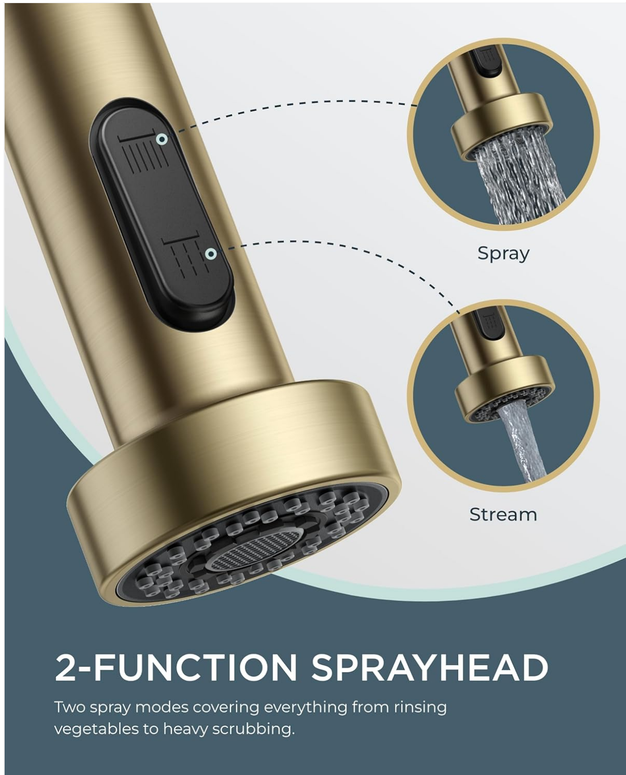
Figure 4: Close-up view of the sprayhead, illustrating the two buttons to switch between Stream and Spray modes. To switch between modes, press the button on the sprayhead. The sprayer hose extends up to 26 inches for extended reach and maneuverability.