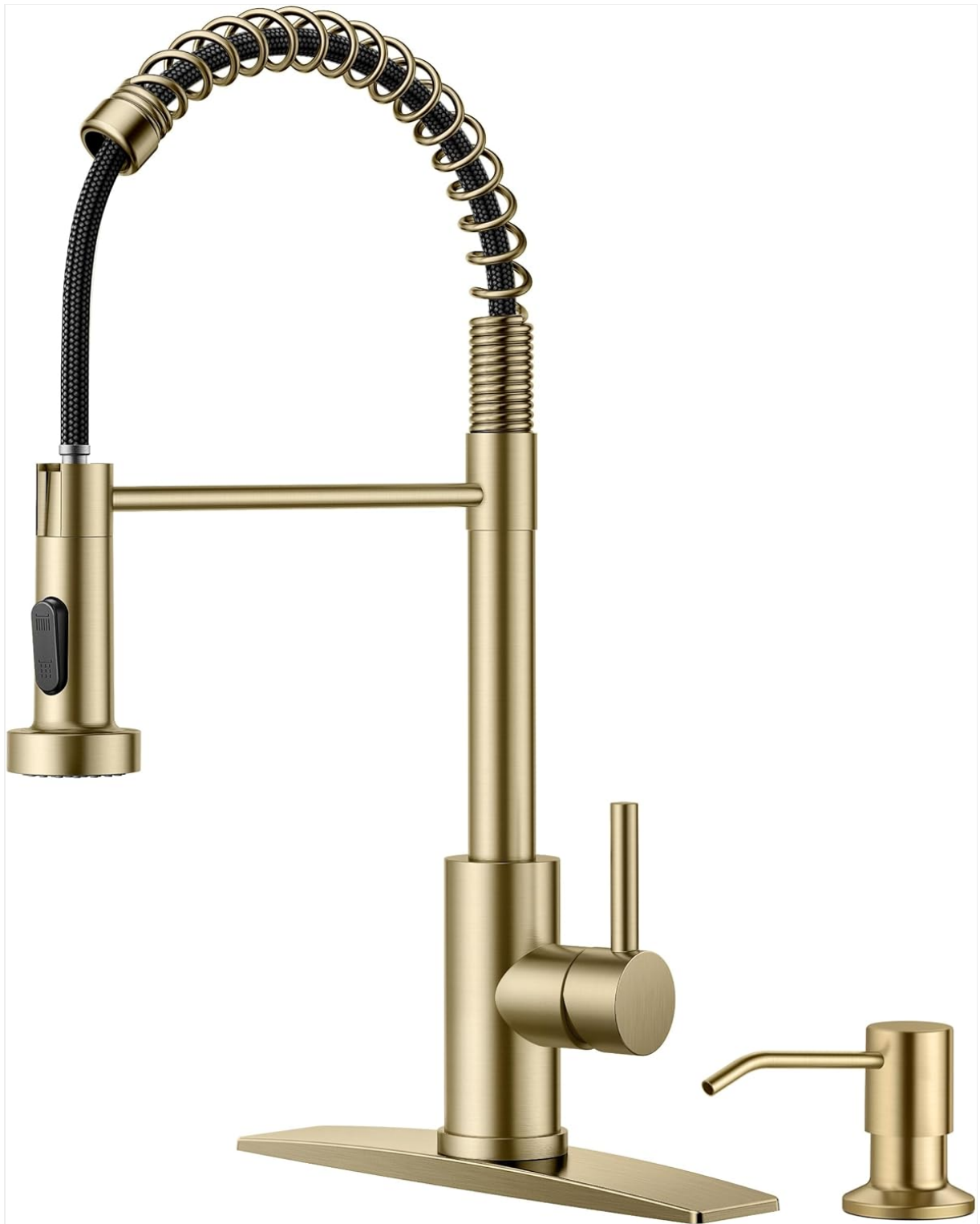
Figure 1: Main components of the FORIOUS Kitchen Faucet and Soap Dispenser. The image shows the gold-finished faucet with its spring-coil spout, pull-down sprayer, single handle, and a matching soap dispenser, all mounted on a deck plate.