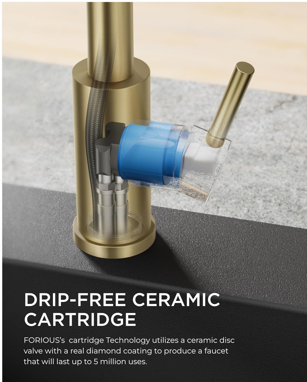
Figure 8: An X-ray view of the faucet's internal structure, highlighting the drip-free ceramic cartridge, which is designed for long-lasting, leak-proof performance.