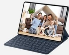
Image: Various devices displaying the camera's live feed, demonstrating multi-platform compatibility.

Your browser does not support the video tag.