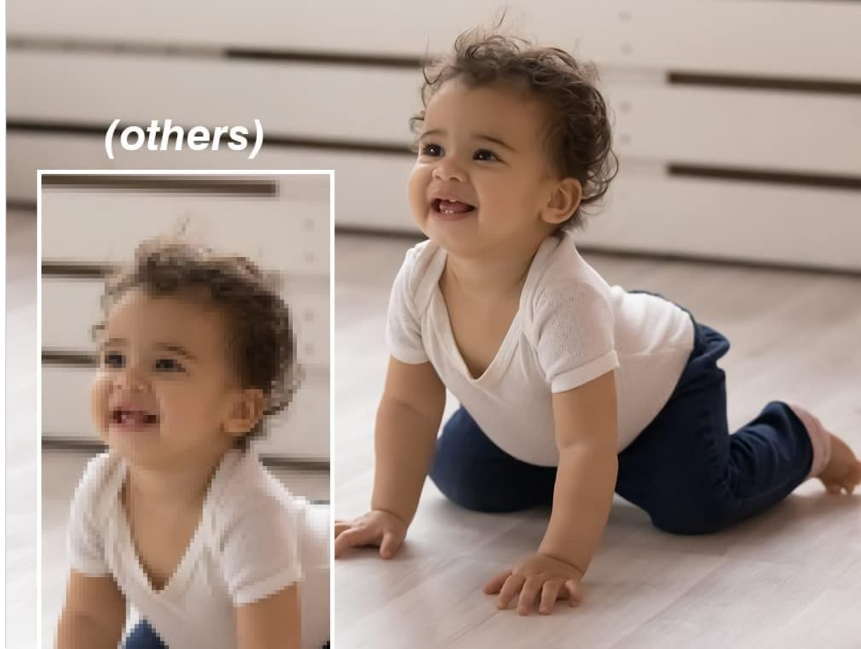
Image: A visual comparison highlighting the superior clarity of 4MP UltraHD (2K) video from the camera.