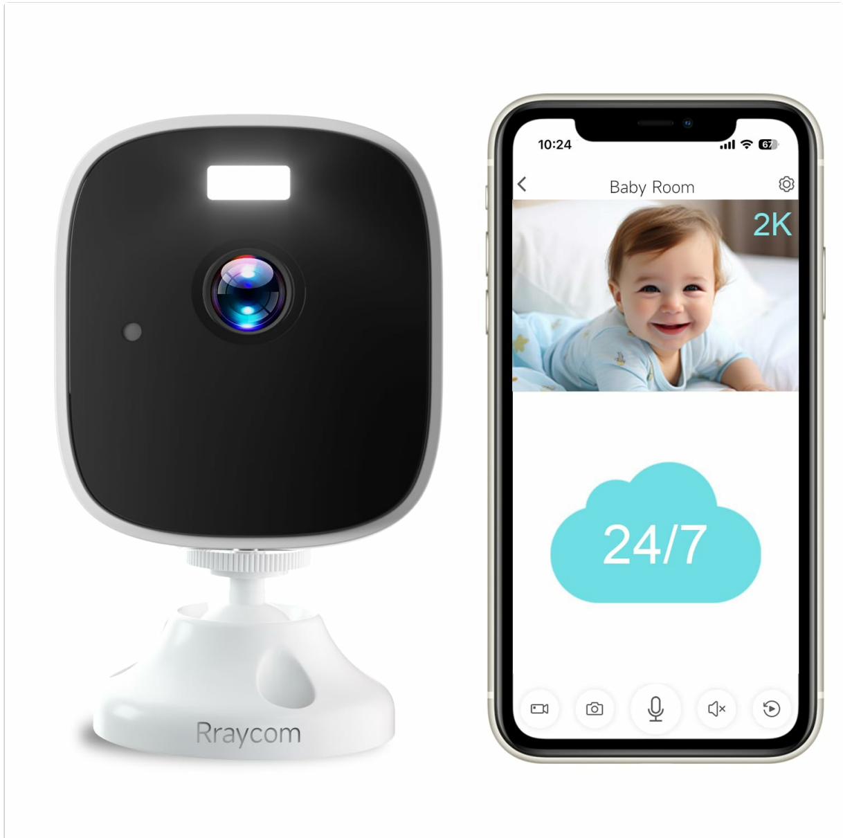
Image: The Rraycom T1 Indoor Home Security Camera, showing its compact design and included stand.

Video: Instructions on how to connect the Rraycom T1 camera to the mobile application.