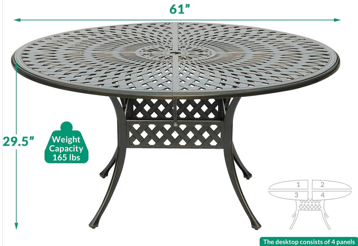
Image: Diagram illustrating the table's dimensions (61" diameter, 29.5" height) and indicating that the desktop consists of four panels. It also shows seating capacities for 4, 6, and 8 persons, and a 2-inch umbrella hole.