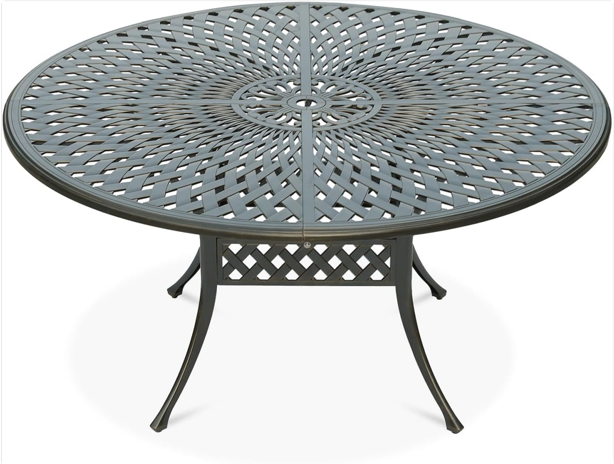
Image: The fully assembled VIVIJASON 61-inch round patio dining table, showcasing its dark bronze cast aluminum finish and intricate lattice pattern.