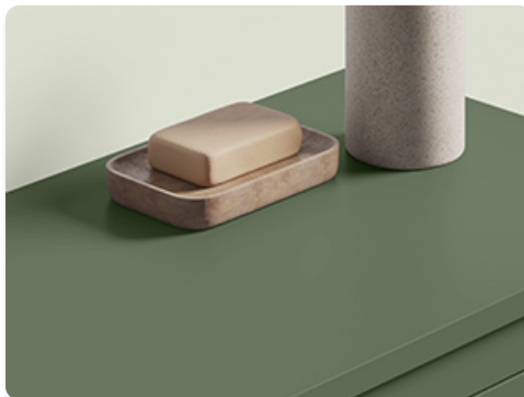
Image: A close-up view of the cabinet's top surface, demonstrating its smooth, painted finish and suitability for holding bathroom accessories.