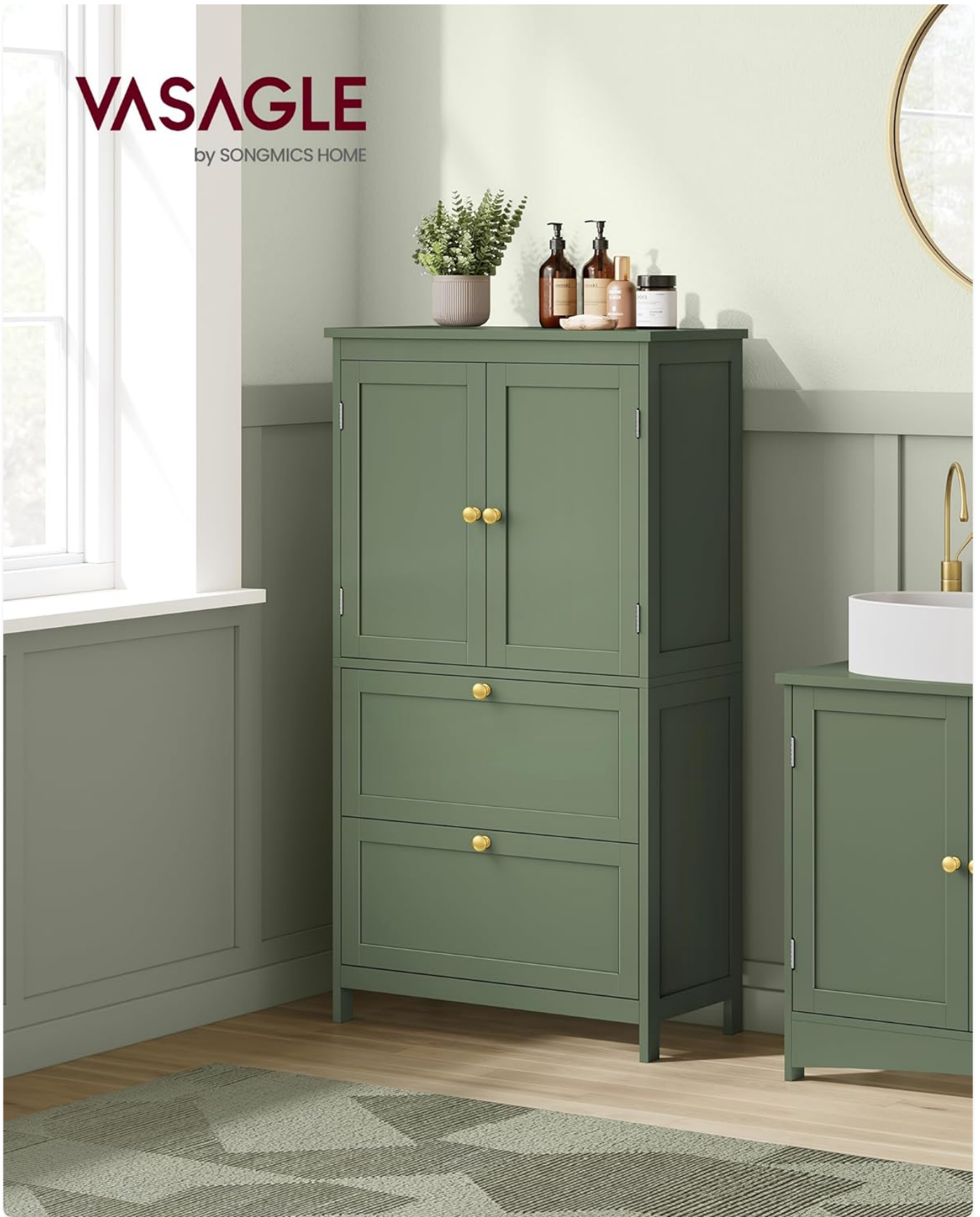
Image: The VASAGLE Bathroom Floor Storage Cabinet (Forest Green) positioned in a modern bathroom, showcasing its design and integration into the space.