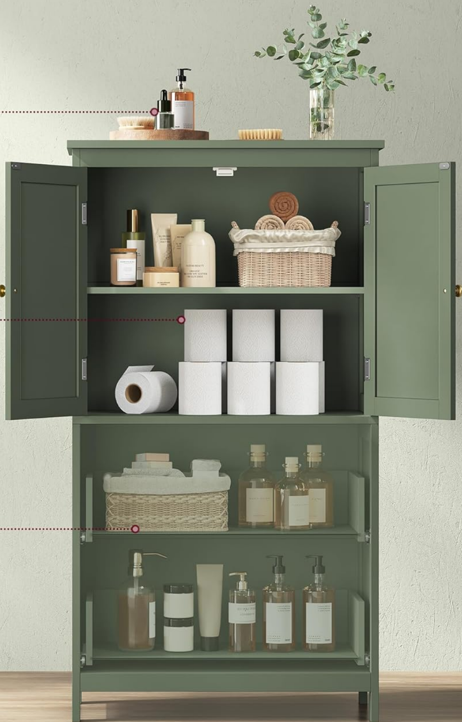
Image: An interior view of the cabinet demonstrating its large storage capacity, with examples of items like toilet paper, toiletries, and towels neatly stored on shelves and in drawers.