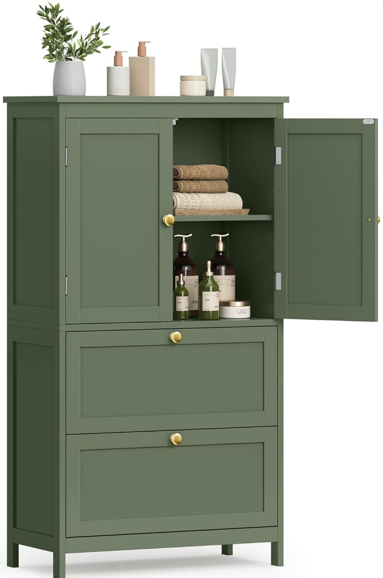
Image: The cabinet with its top doors open, displaying the interior shelving and the two lower drawers. This view highlights the storage