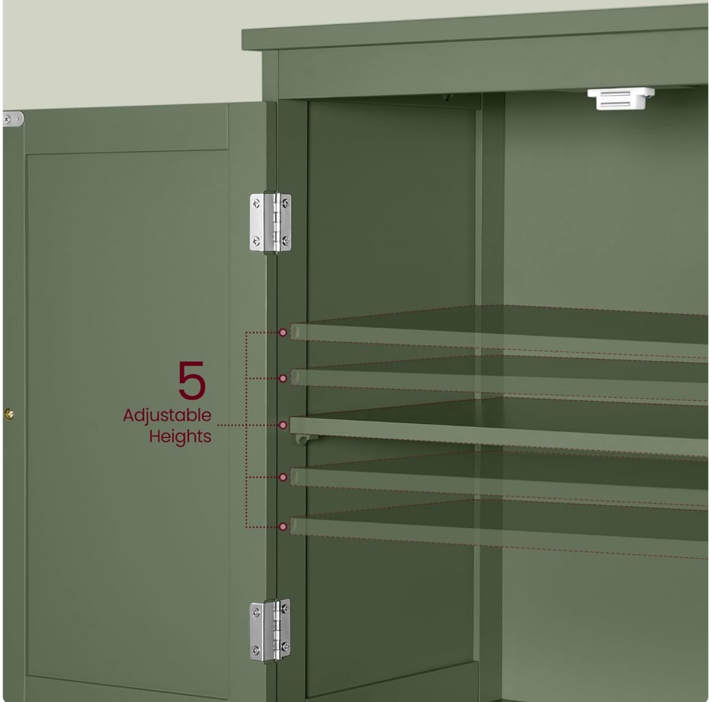
Image: A detailed view highlighting the five distinct height options for the adjustable shelf within the top cabinet, allowing for flexible storage configurations.

5 heights available to fit items of varying sizes