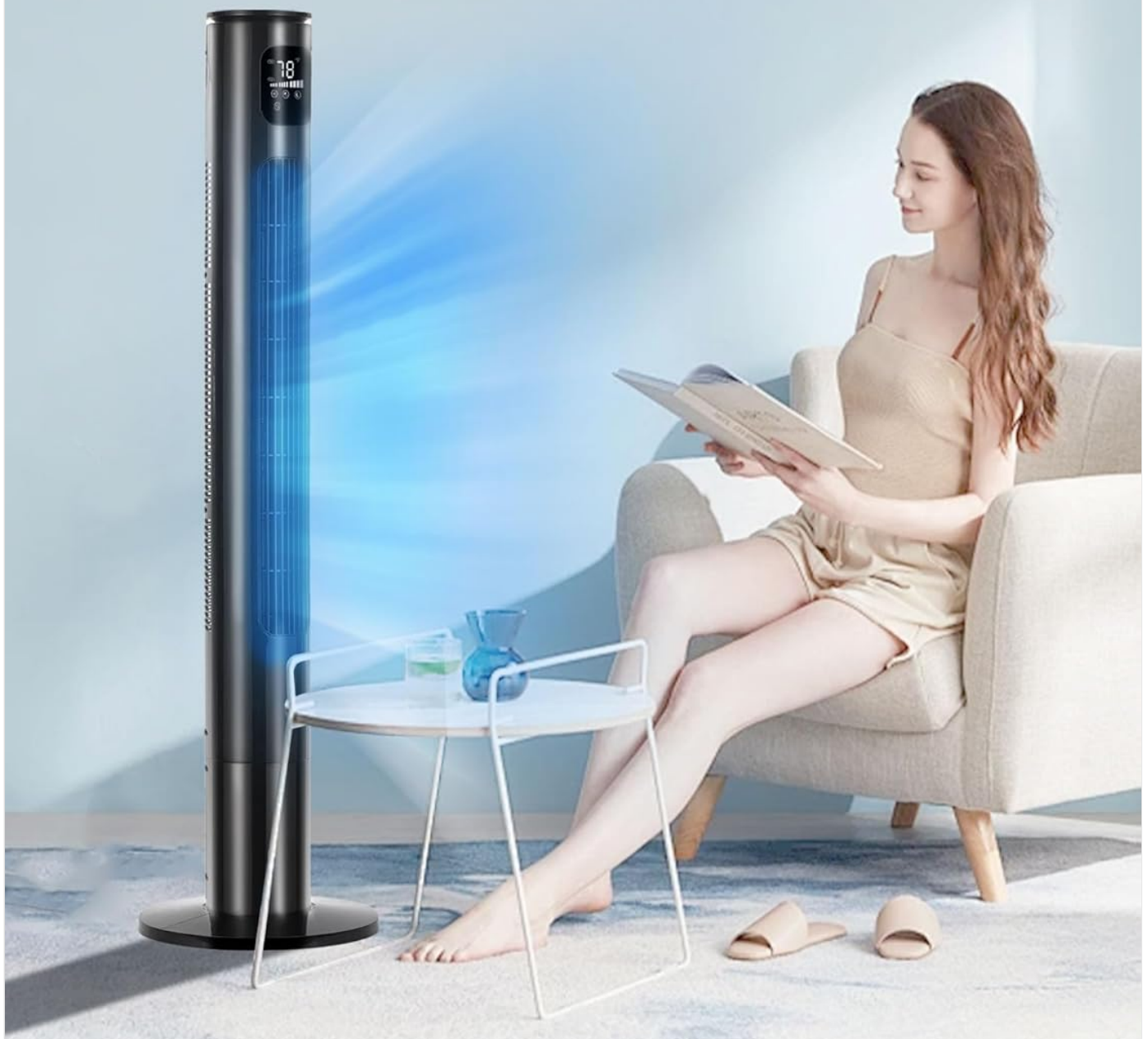
Figure 4: Available wind speeds and modes.