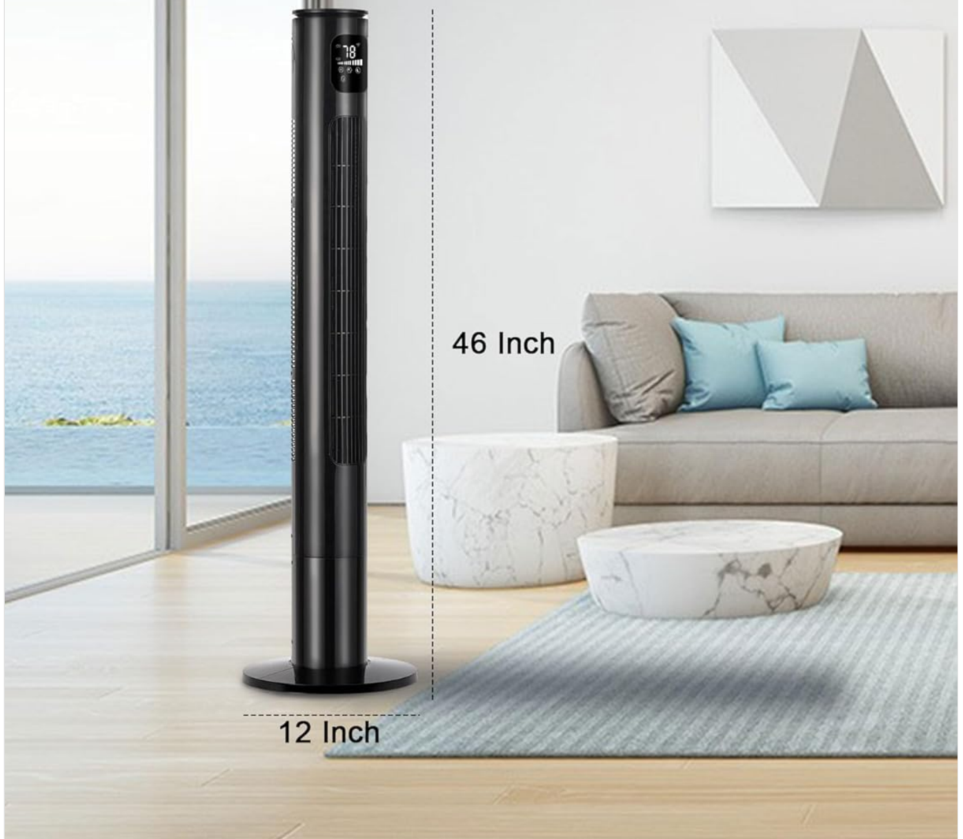
Figure 1: Space-saving design and dimensions of the Uthfy 46-inch Tower Fan.

Slim, space-saving design perfects for any corner.