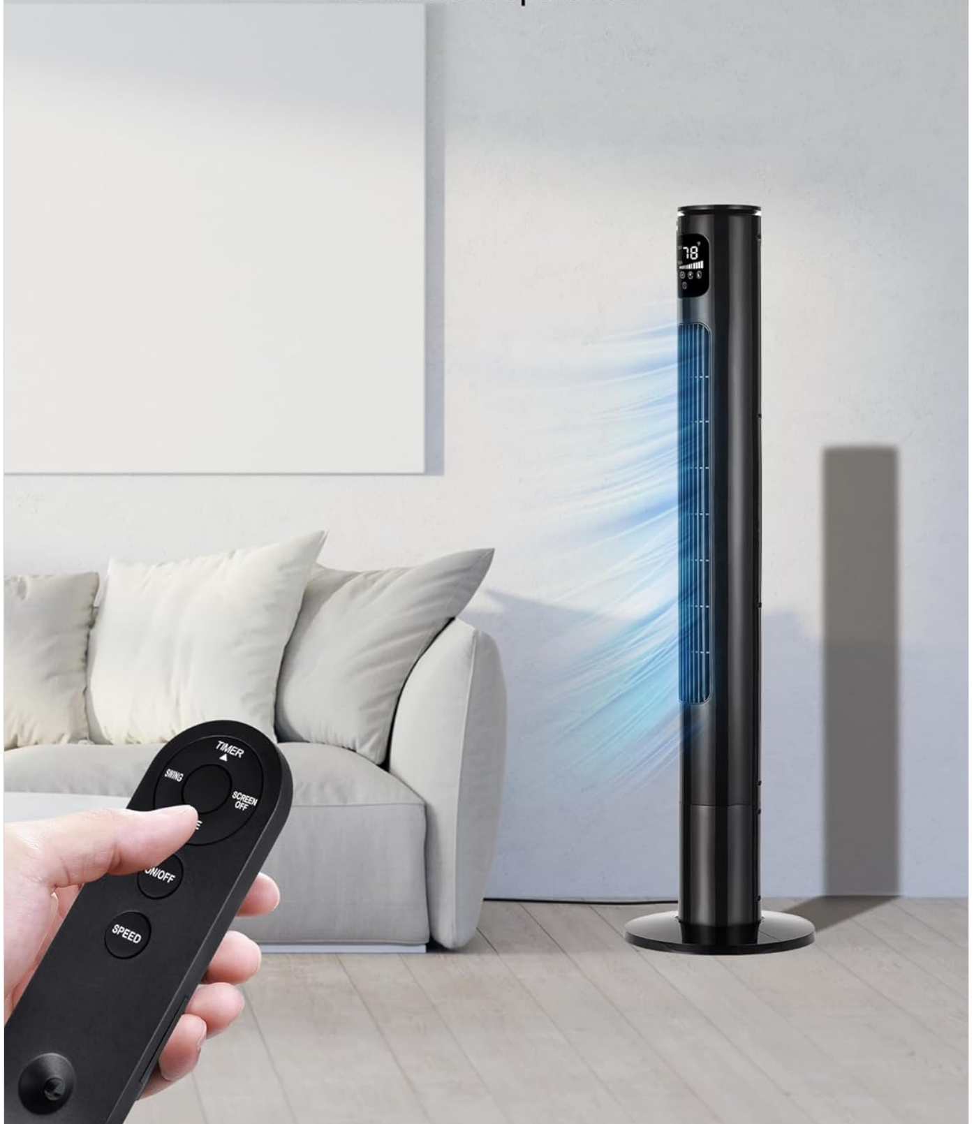
Figure 3: Remote control for convenient operation.

Large remote control with different functions for more convenient operation