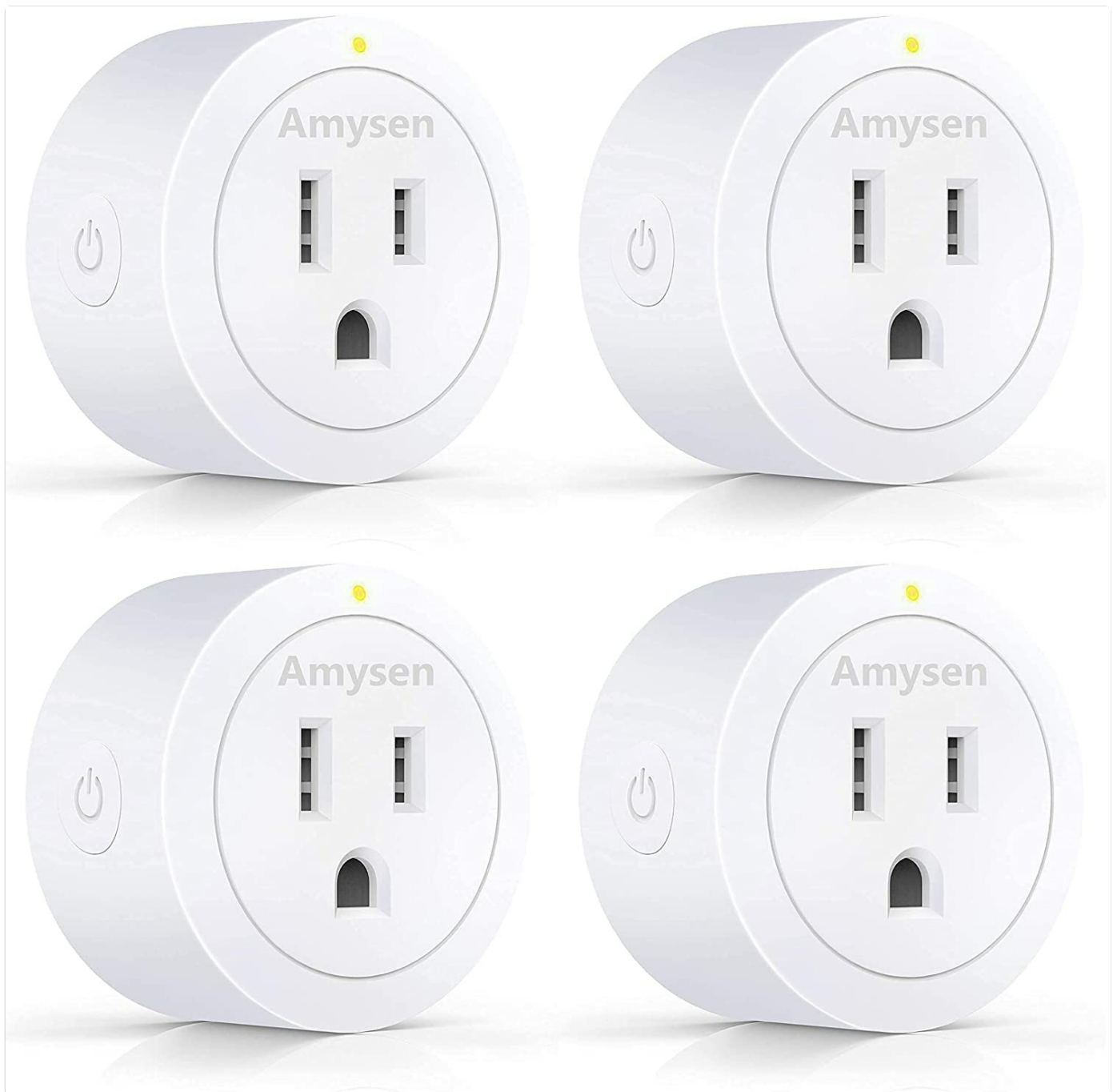
Image: Four Amysen Smart Plugs, highlighting their compact and minimalist design.