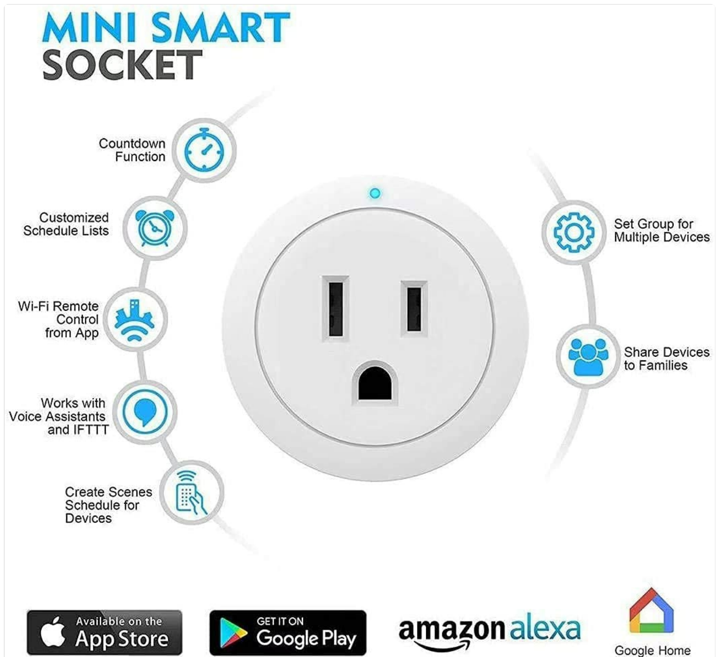
Image: Overview of Amysen Smart Plug features.