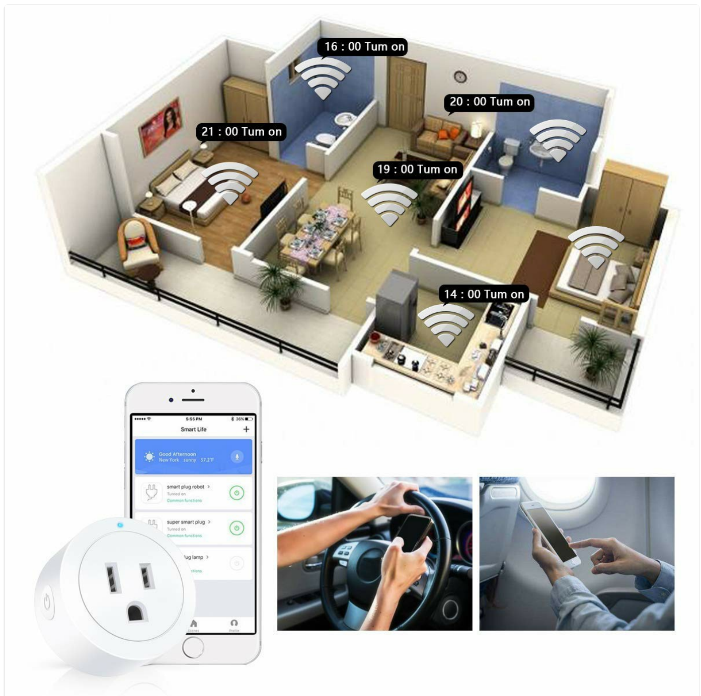
Image: Device sharing with family members.