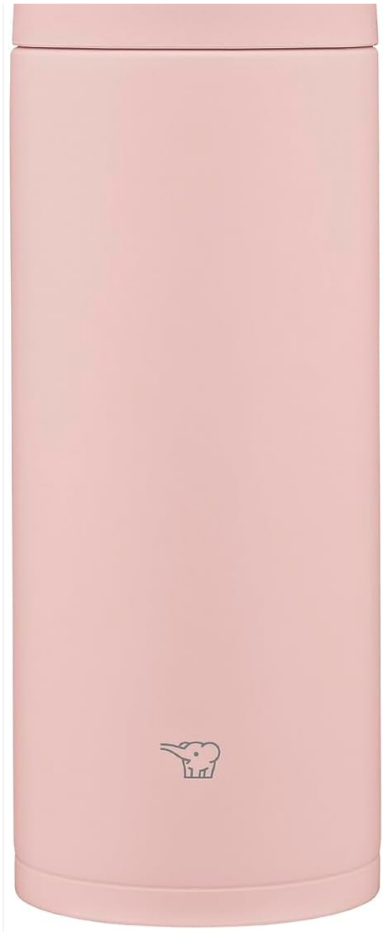
Figure 1: Zojirushi SM-RS50-PA Stainless Steel Mug (Pink)