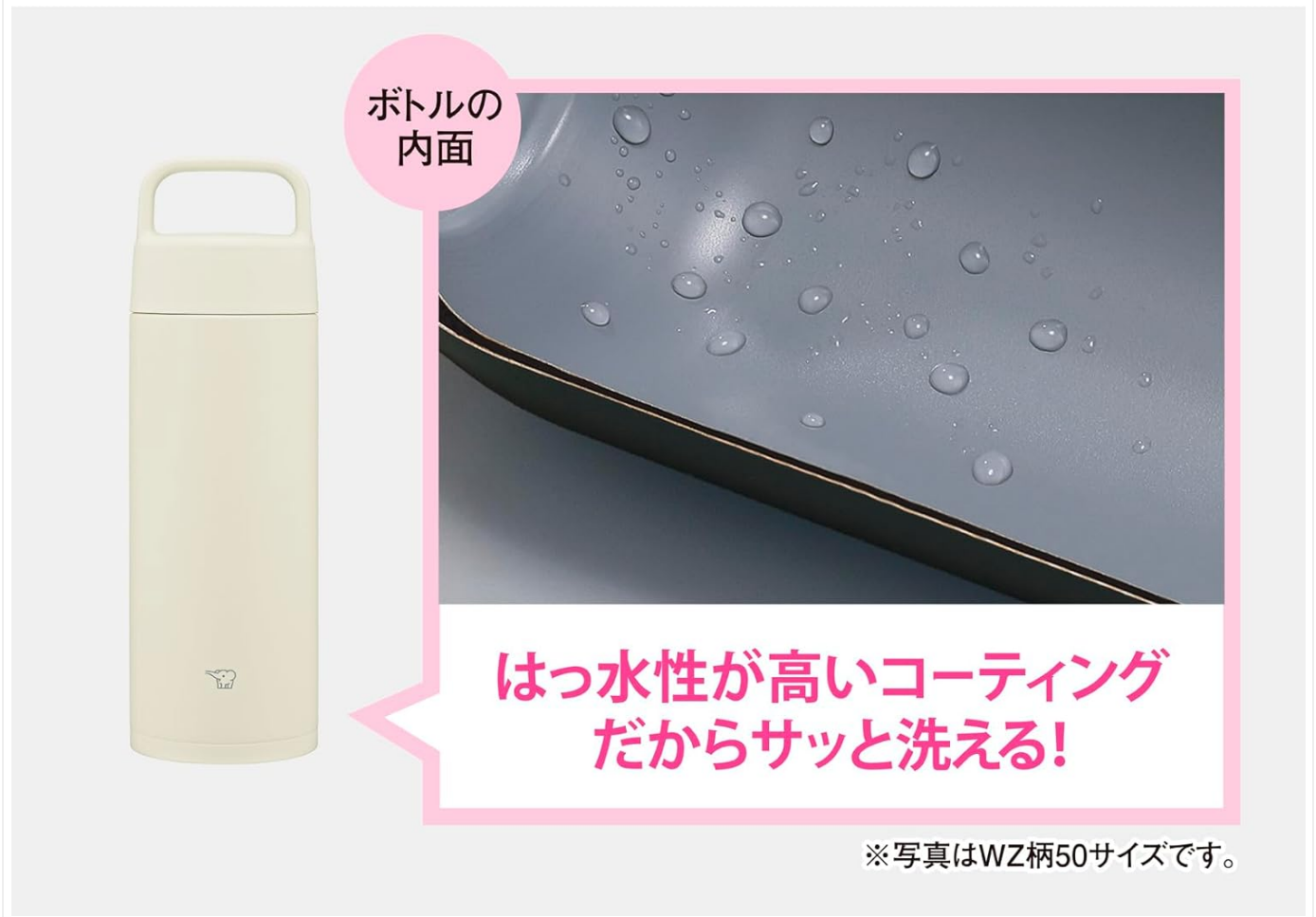
Figure 5: The non-stick coated interior prevents stains and odors, making cleaning effortless.