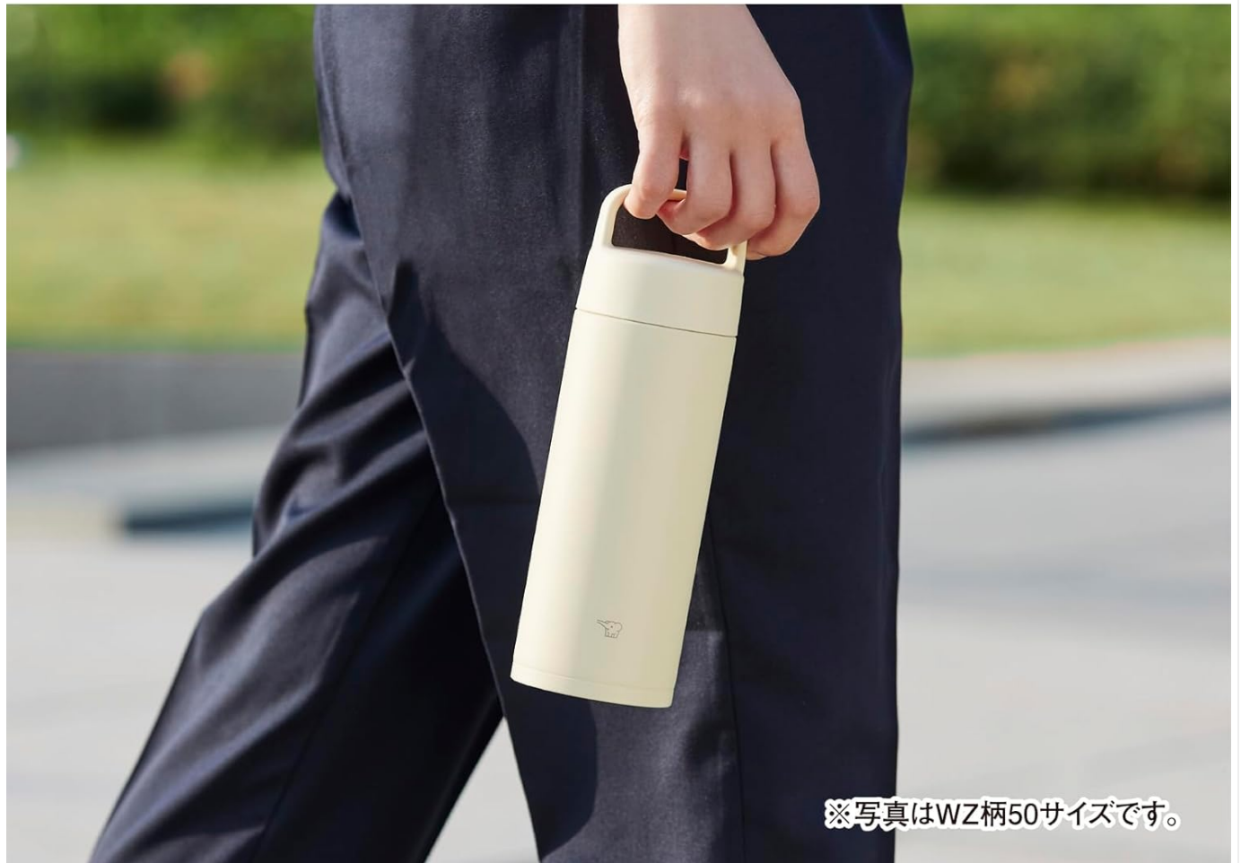
Figure 3: The Zojirushi mug features a convenient handle for easy portability.