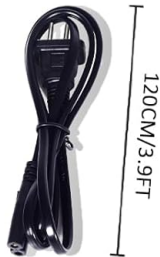
Stromkabel x 1