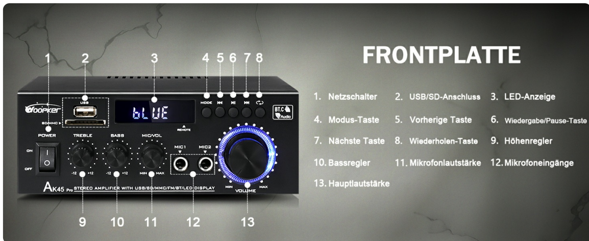
Image: Detailed view of the AK45 Pro amplifier's front panel, highlighting each control and input.