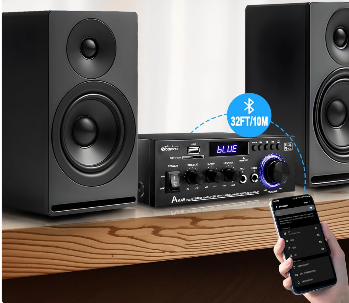
Image: Illustration of a smartphone wirelessly connected to the AK45 Pro amplifier via Bluetooth.