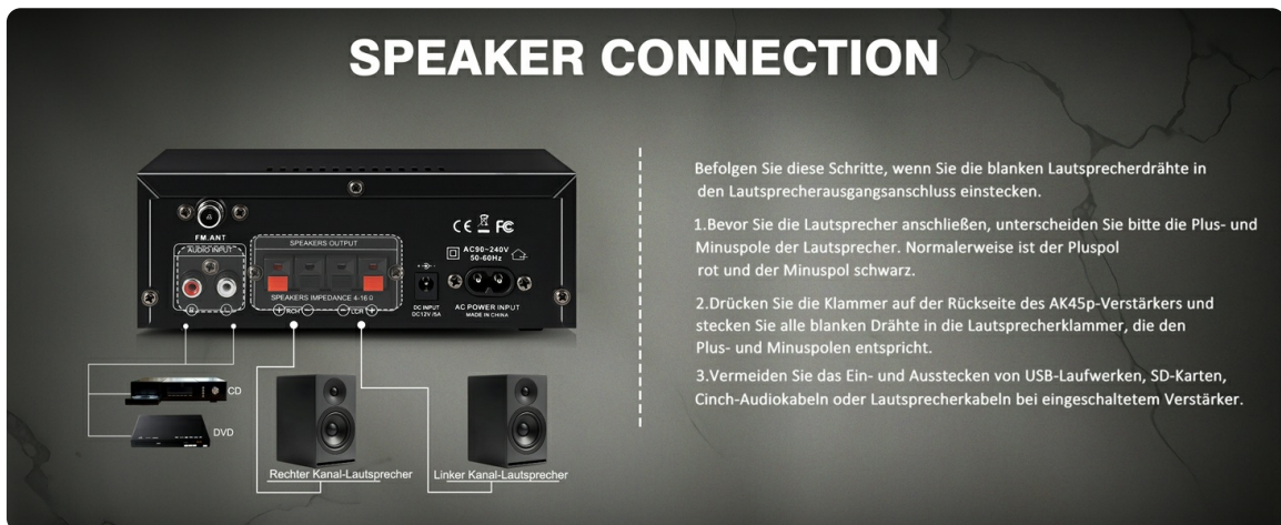
Image: Detailed view of the AK45 Pro amplifier's rear panel, showing all connection ports.