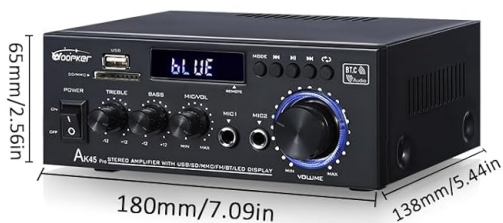
HiFi Stereo Verstärker x 1