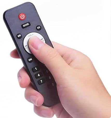
Image: A hand holding the infrared remote control, used for convenient operation of the amplifier from a distance. The included IR remote control allows you to conveniently manage power, volume, mode selection, track skipping, and other functions from a distance.