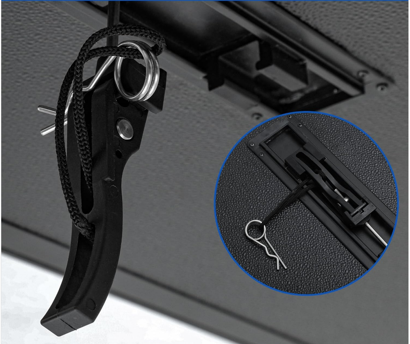
Figure 6: The rear clamp features an upgraded iron ring release structure for secure driving.