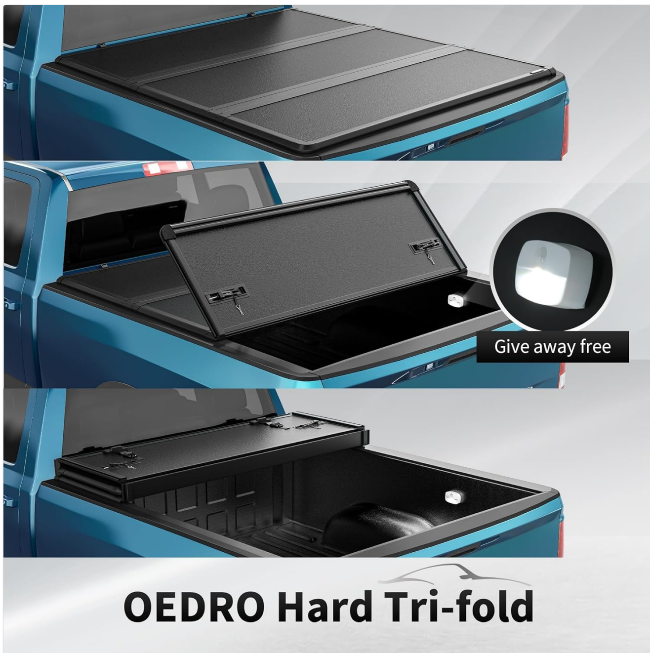
Figure 7: The tri-fold cover can be easily folded back to access the truck bed.

To access your truck bed, release the rear clamps and fold the cover sections towards the cab. Secure the folded sections using the integrated nylon straps to prevent movement while driving. Avoid driving with the cover partially opened without securing it.