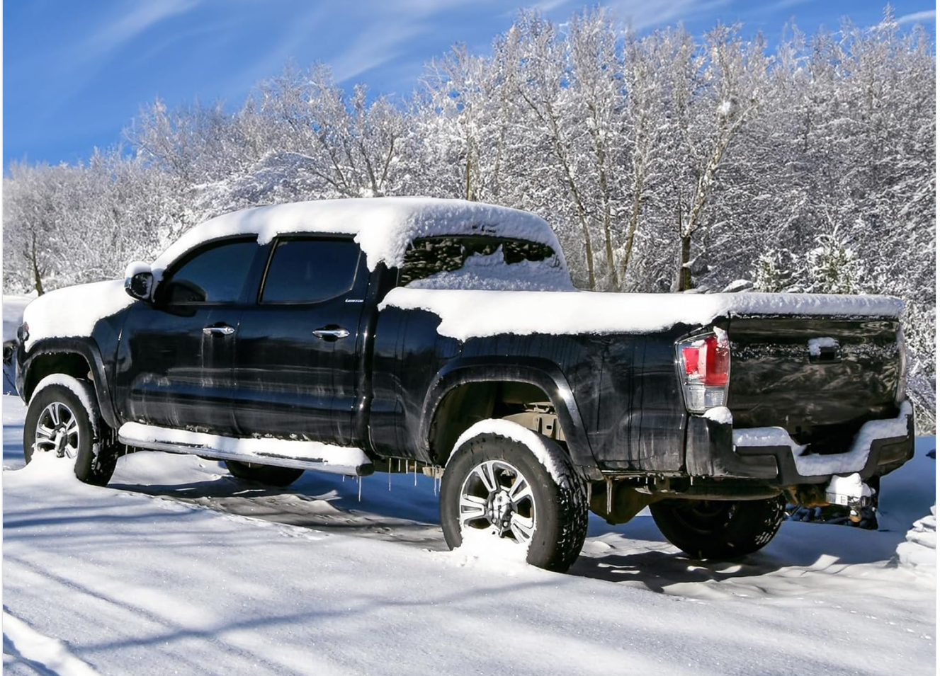
Figure 10: The cover is designed to safeguard your cargo in severe weather conditions.