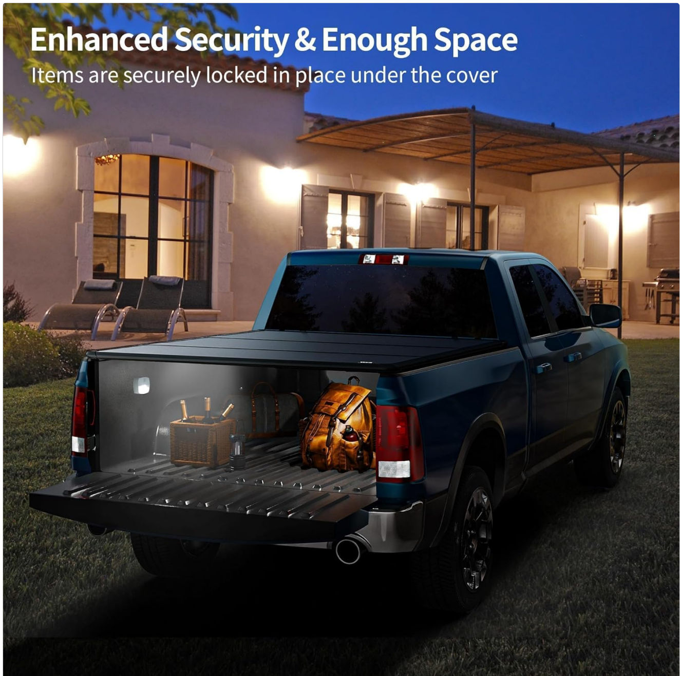
Figure 9: Enhanced security and ample space for items under the cover.

Items are securely locked in place under the cover