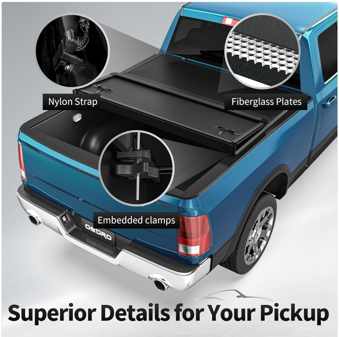
Figure 5: The cover features nylon straps, embedded clamps, and fiberglass plates for secure fitment.