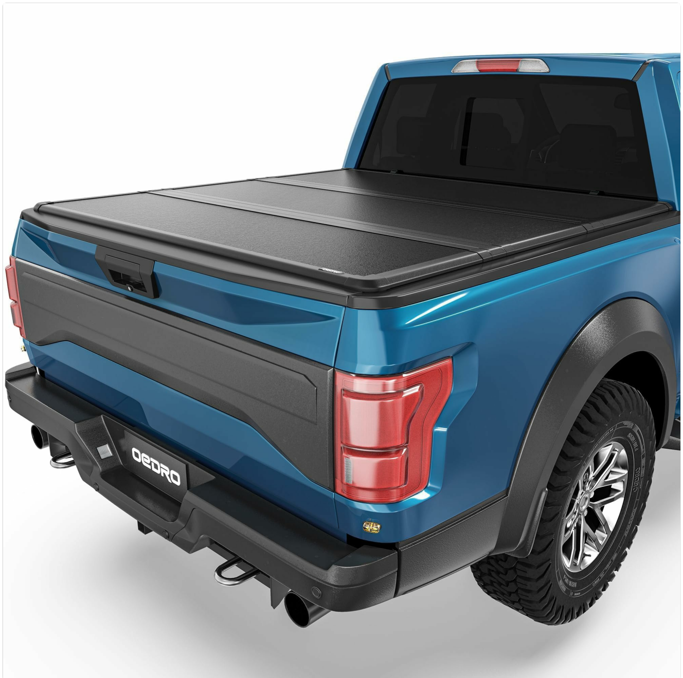
Figure 1: OEDRO FRP Hard Tri-fold Tonneau Cover installed on a Ford F150.