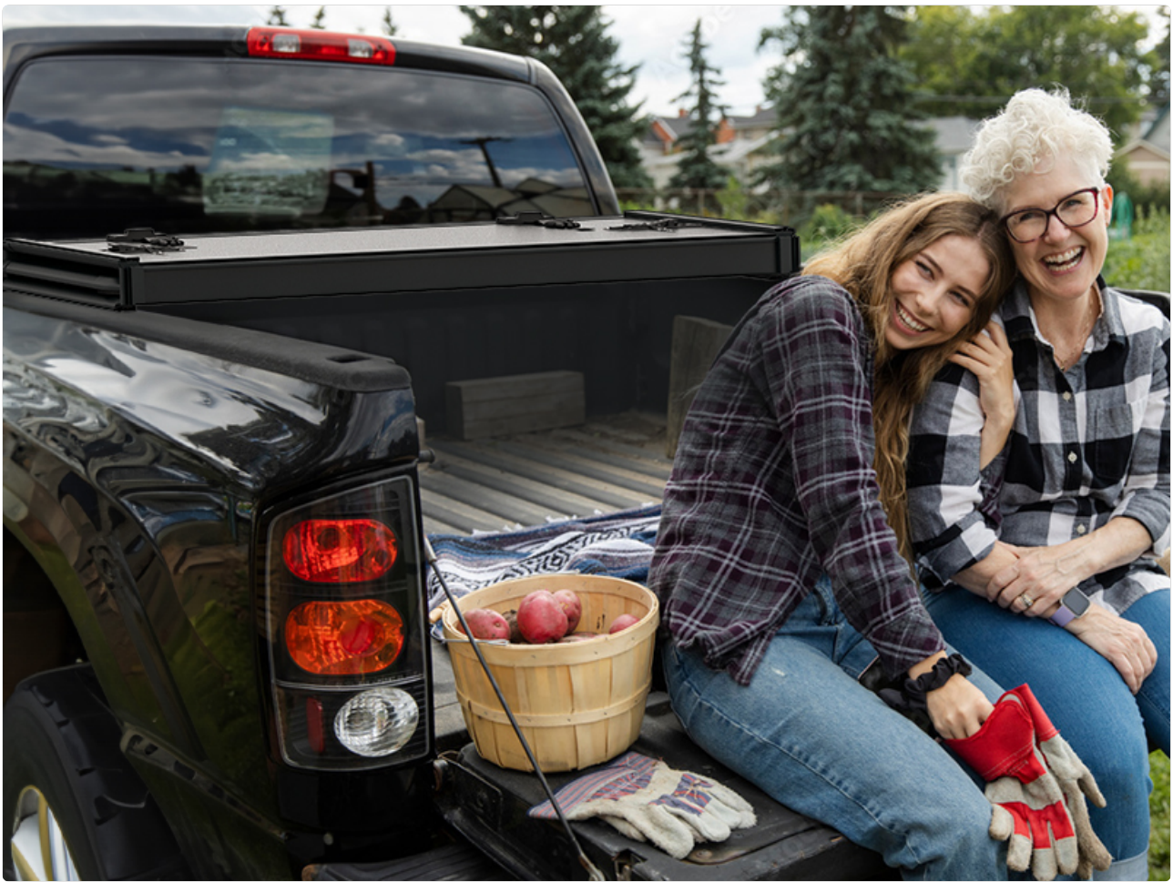
Figure 8: The cover provides a secure and sleek appearance when fully closed.