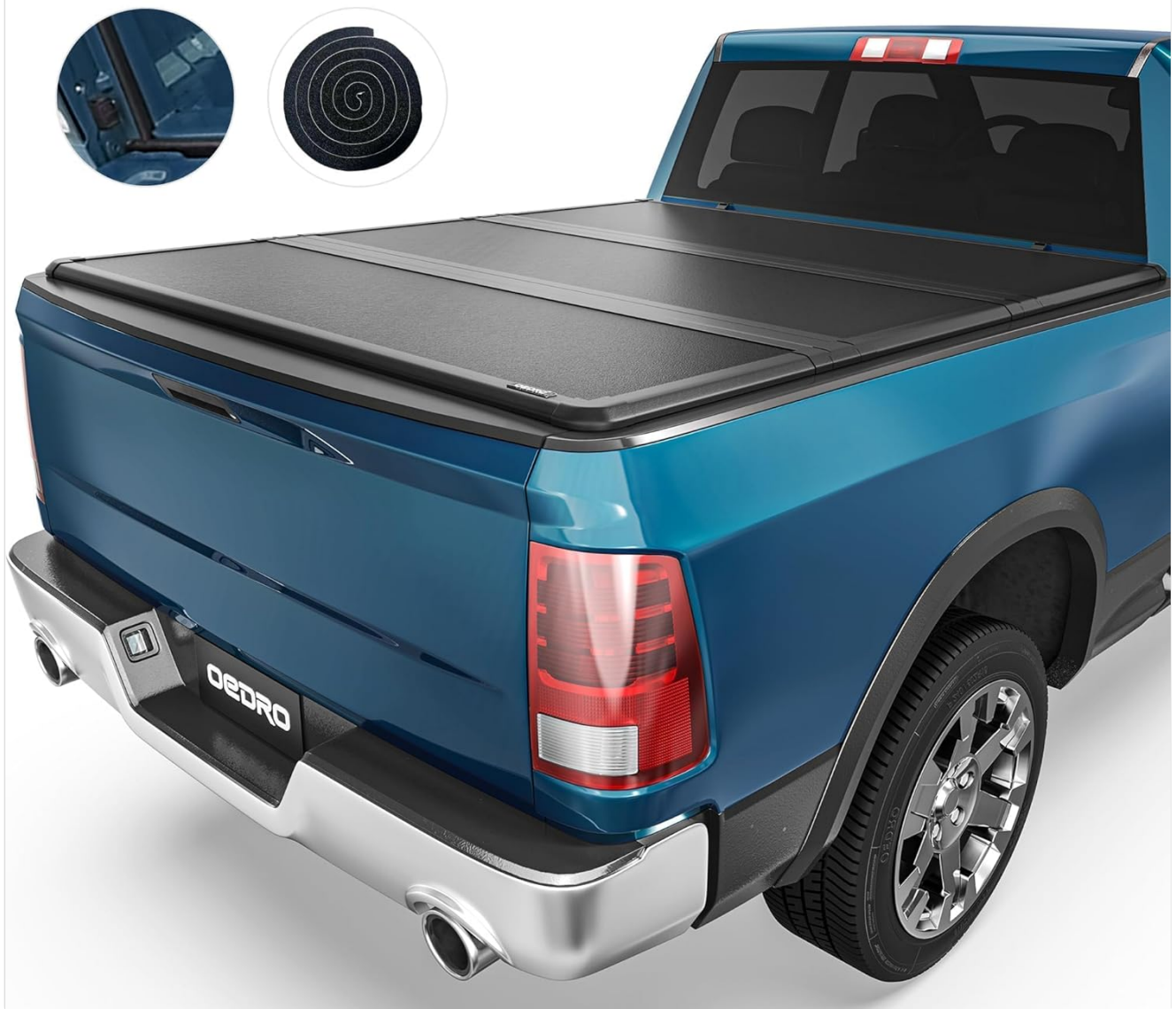
Figure 4: Weather strips are included for enhanced sealing against the elements.