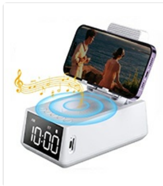
Figure 8: A small hole at the base of the stand allows for charging your phone while in use.