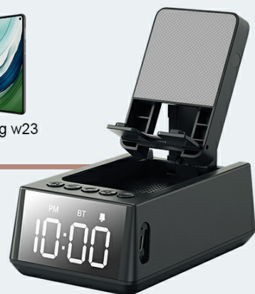
Figure 3: Overview of Deeyaple S207 features, including battery capacity, charging ports, audio capabilities, and stand design.