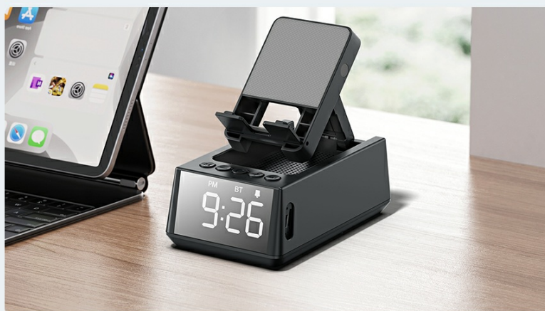
Figure 4: Detailed view of the device's adjustable bracket, base, and non-slip mat.

Equipped with an LED digital display, time can still proceed as usual when the screen is turned off.