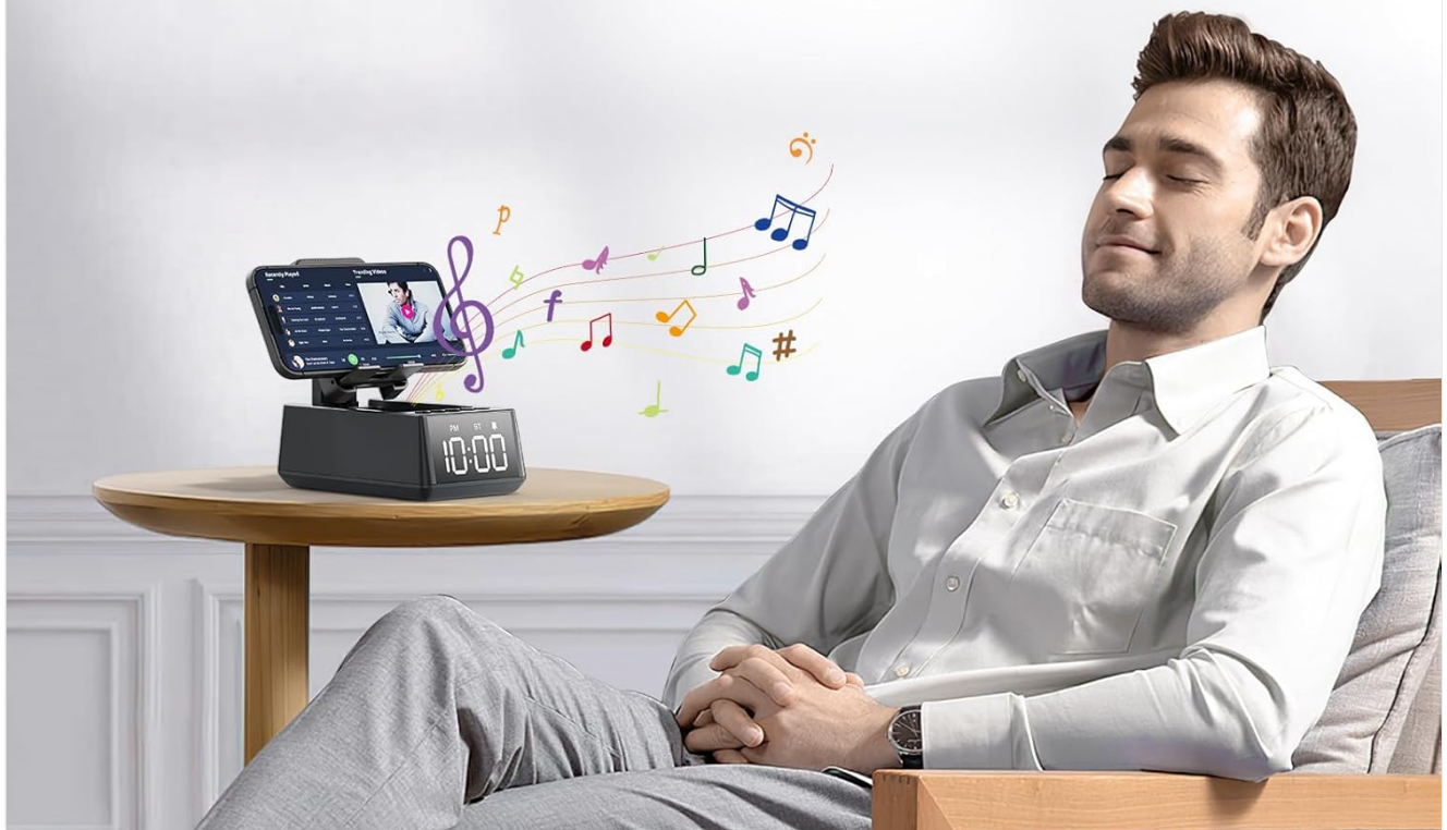
Figure 1: The Deeyaple S207 multi-functional device.