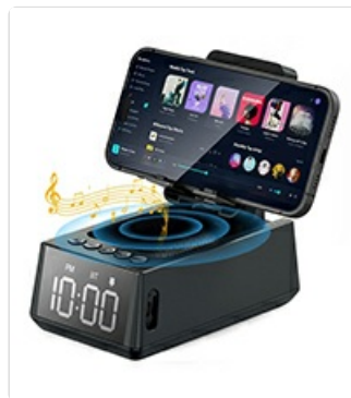
Figure 6: The LED digital display shows the current time.