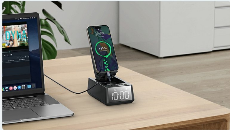
Figure 2: The Deeyaple S207 functions as a stand, speaker, and digital clock.

Combines a Bluetooth speaker, clock, and stand into one all-in-one device.