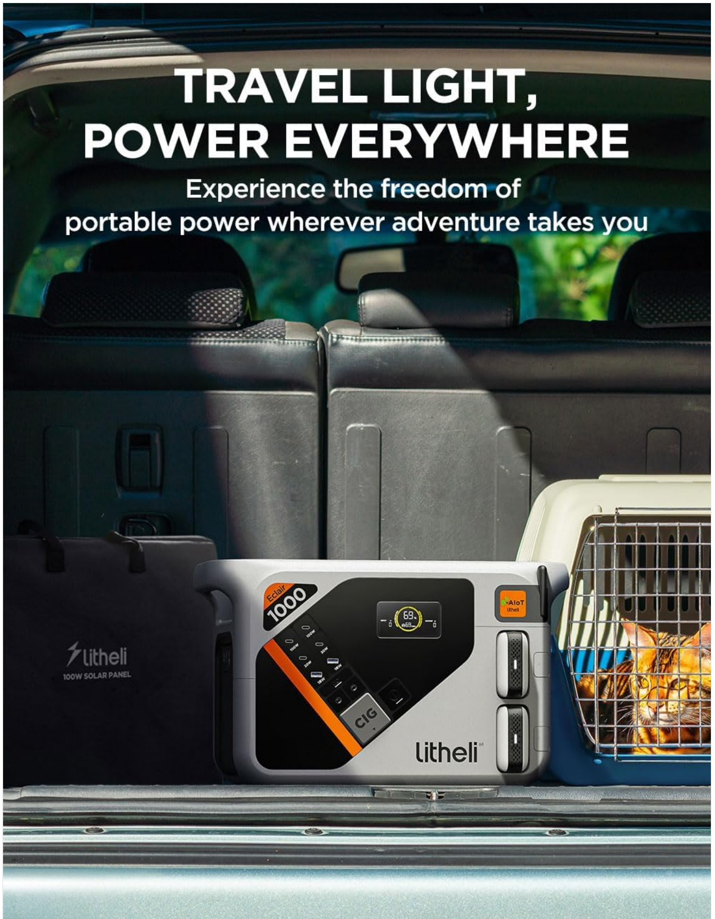
Image: Detailed view of the Litheli Eclair 1000's control panel and output ports, including USB-A, USB-C, AC outlets, Car Port, and Pogo Pin.

Experience the freedom of portable power wherever adventure takes you