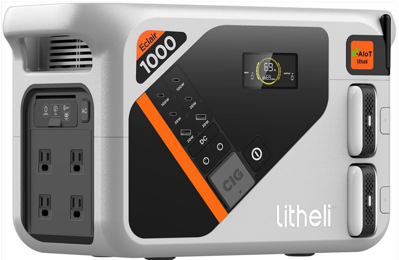
Image: Front view of the Litheli Eclair 1000 Portable Power Station, showcasing its display and various output ports.

This manual provides essential instructions for the safe and efficient operation, maintenance, and troubleshooting of your Litheli Eclair 1000 Portable Power Station. Please read this manual thoroughly before using the product and retain it for future reference.