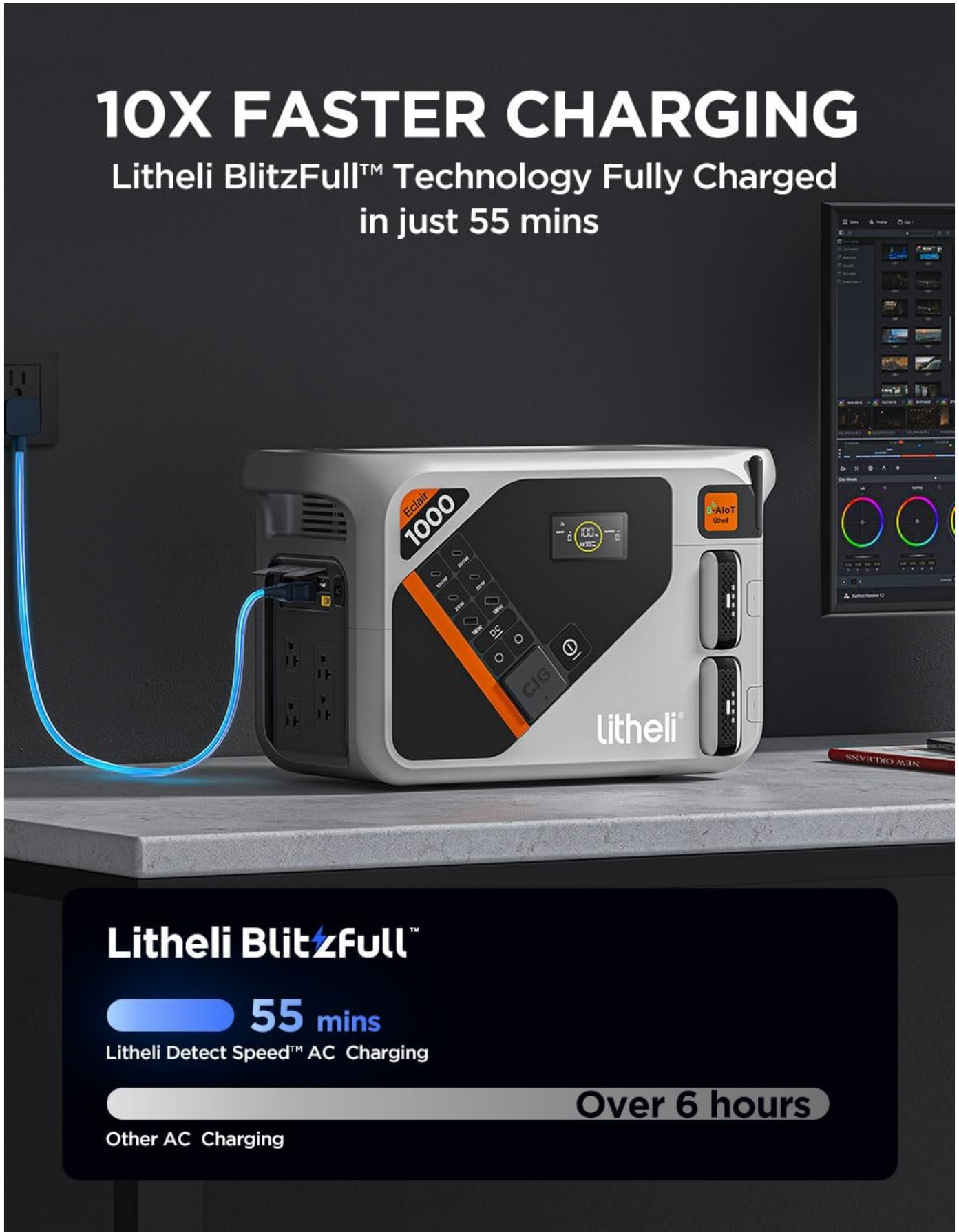
Image: The Litheli Eclair 1000 connected to a wall outlet for AC charging, highlighting its fast charging capability.

3. Placement: Place the unit on a stable, flat surface in a well-ventilated area, away from direct sunlight or heat sources.