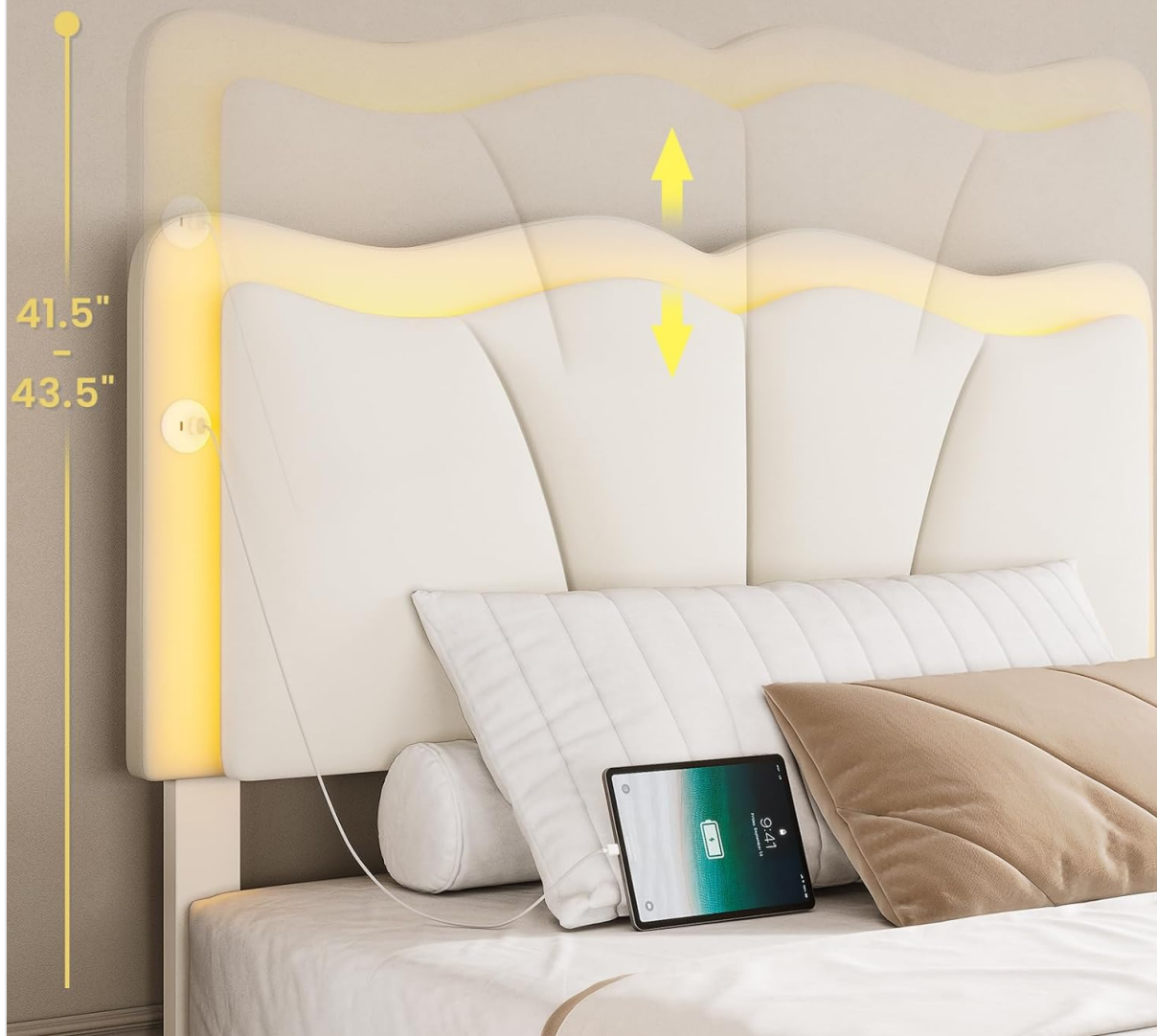
Image: A close-up of the adjustable headboard, showing a smartphone connected to a USB charging port, highlighting the integrated charging station.