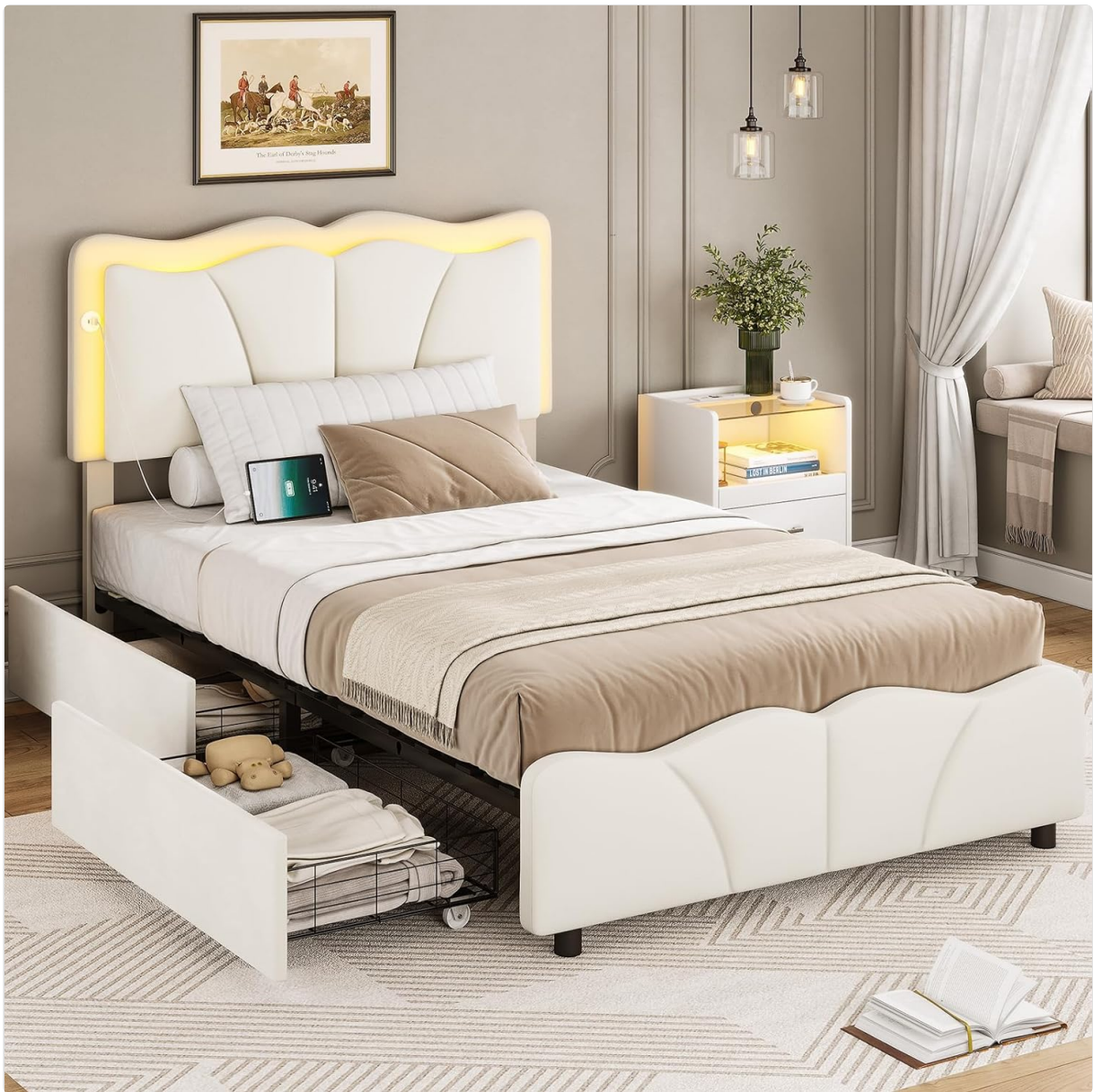
Image: The MSmask Twin Platform Bed Frame in white, featuring an illuminated headboard and one storage drawer pulled out, showcasing its design and storage capability.