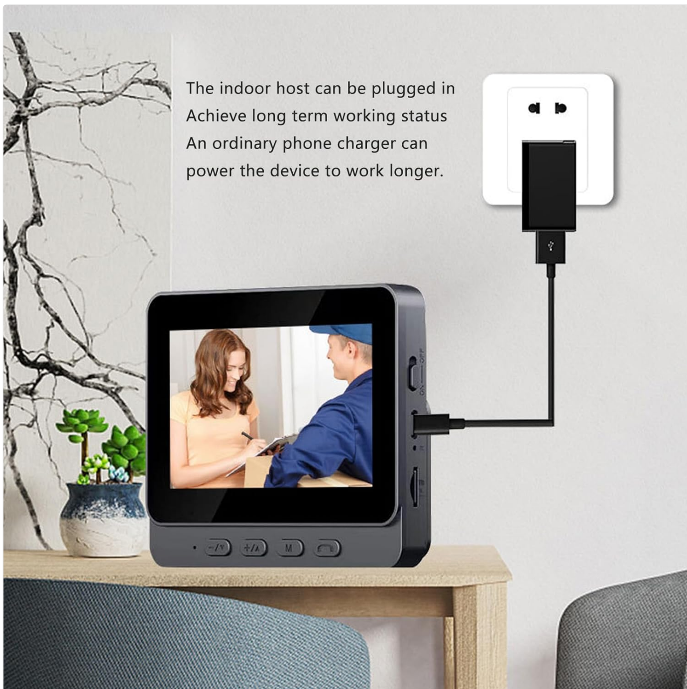
Figure 4.1: Charging the indoor monitor unit.