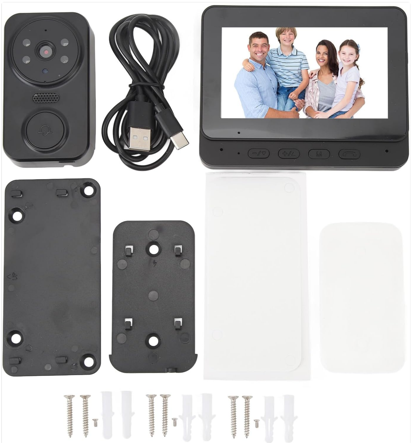
Figure 3.1: Complete package contents.