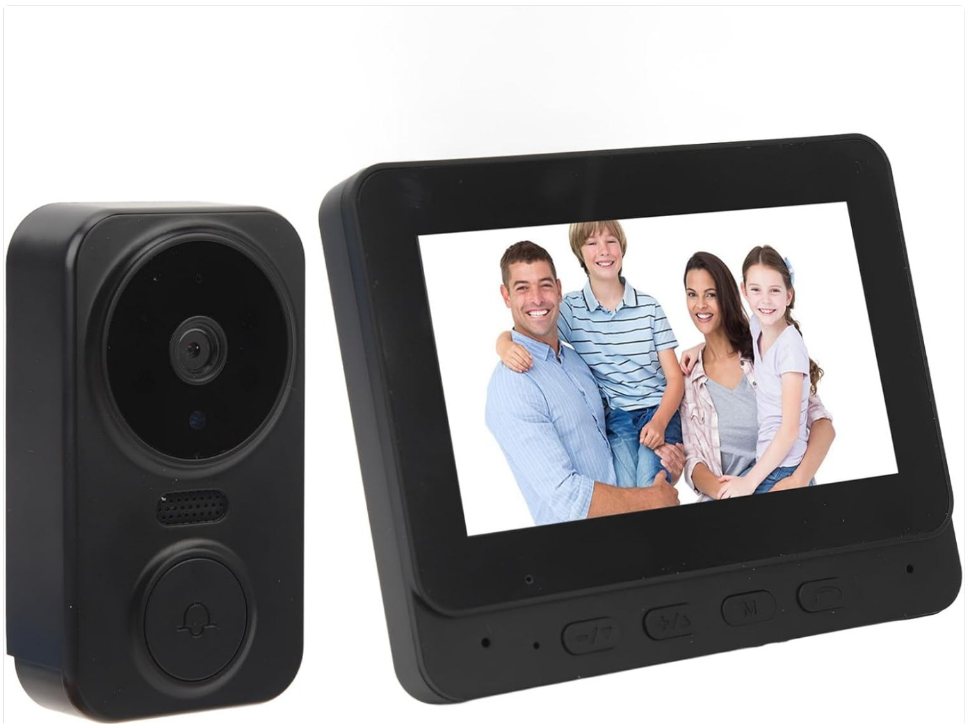
Figure 2.1: The Wireless Video Intercom System, featuring the outdoor doorbell and indoor monitor.