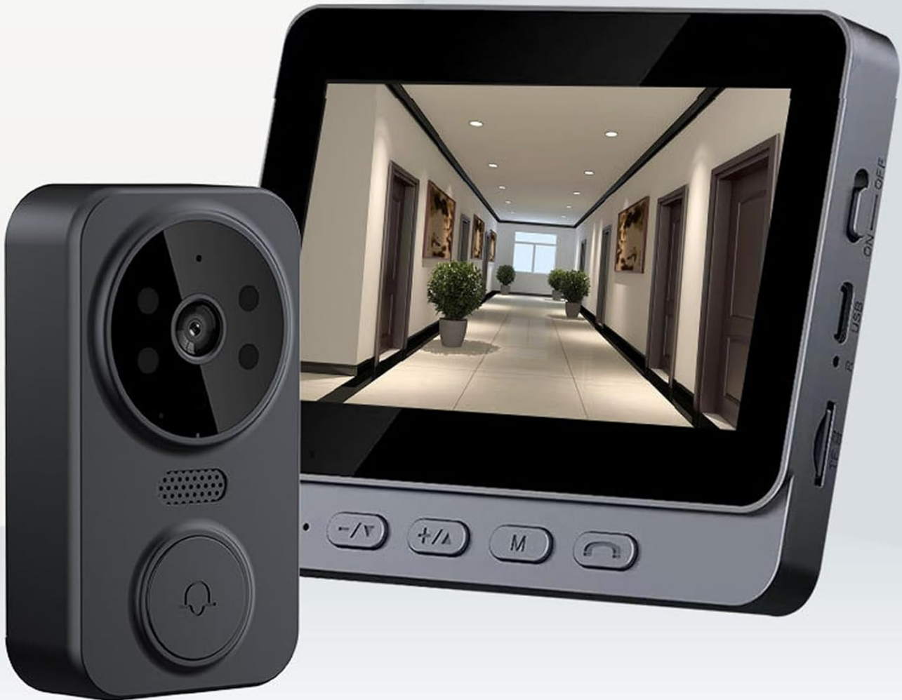
Figure 2.5: Reliable operation even during power outages or network disruptions.

Power outages and network disconnections are available as usual Patented technology, built in signal, private protocol wireless transmission. Not affected by network fluctuations Power failure/disconnection can continue to use. Don't be afraid of unexpected situations