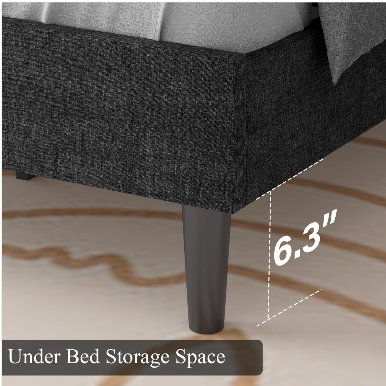
Figure 8.2: Illustration of the 6.3-inch under-bed clearance for storage.