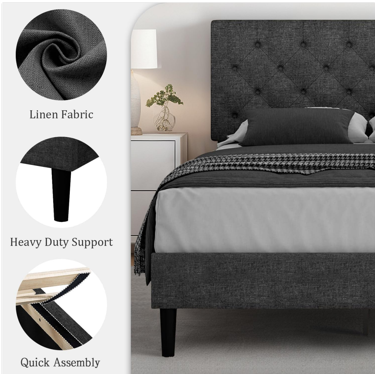
Figure 3.1: Key features including linen fabric, heavy-duty support, and quick assembly design.