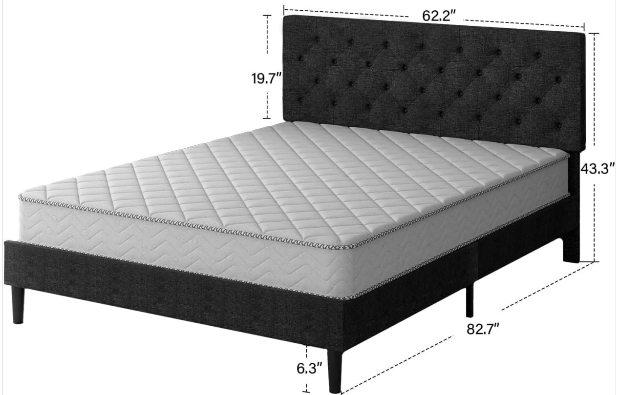
Figure 8.1: Detailed dimensions and weight capacity for the HOMBCK Queen Bed Frame.