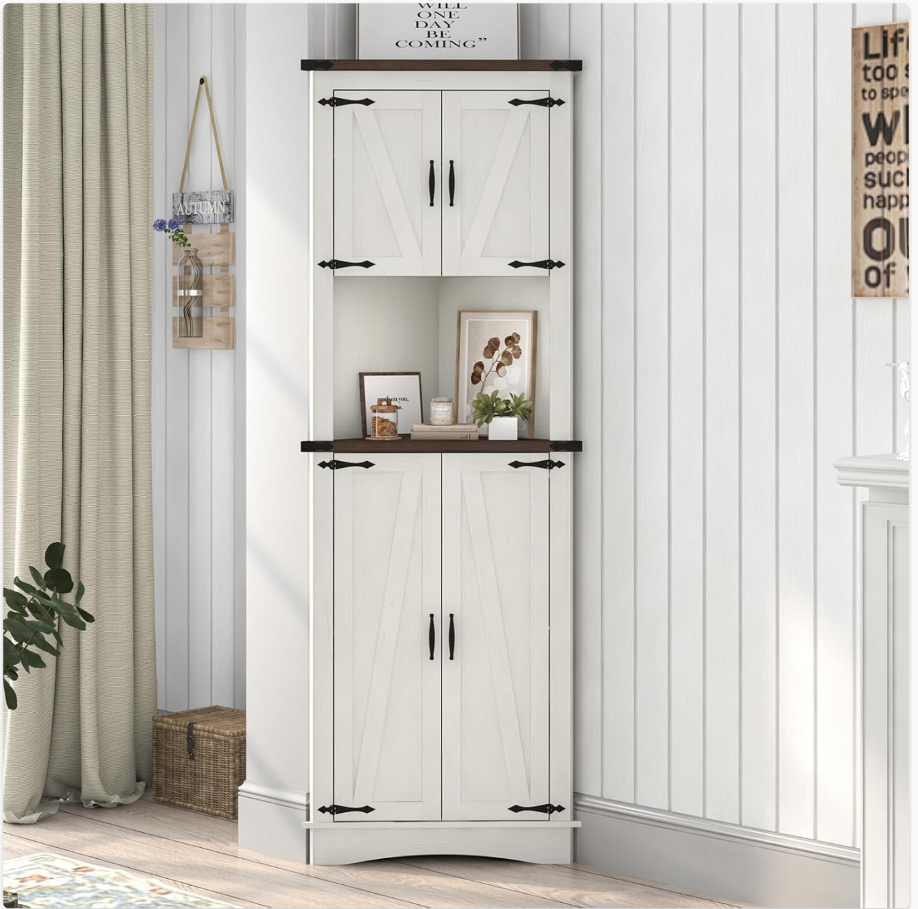
Image: The 68-inch tall farmhouse corner cabinet in rustic white, featuring barn doors and a multi-tiered design, positioned in a room corner.