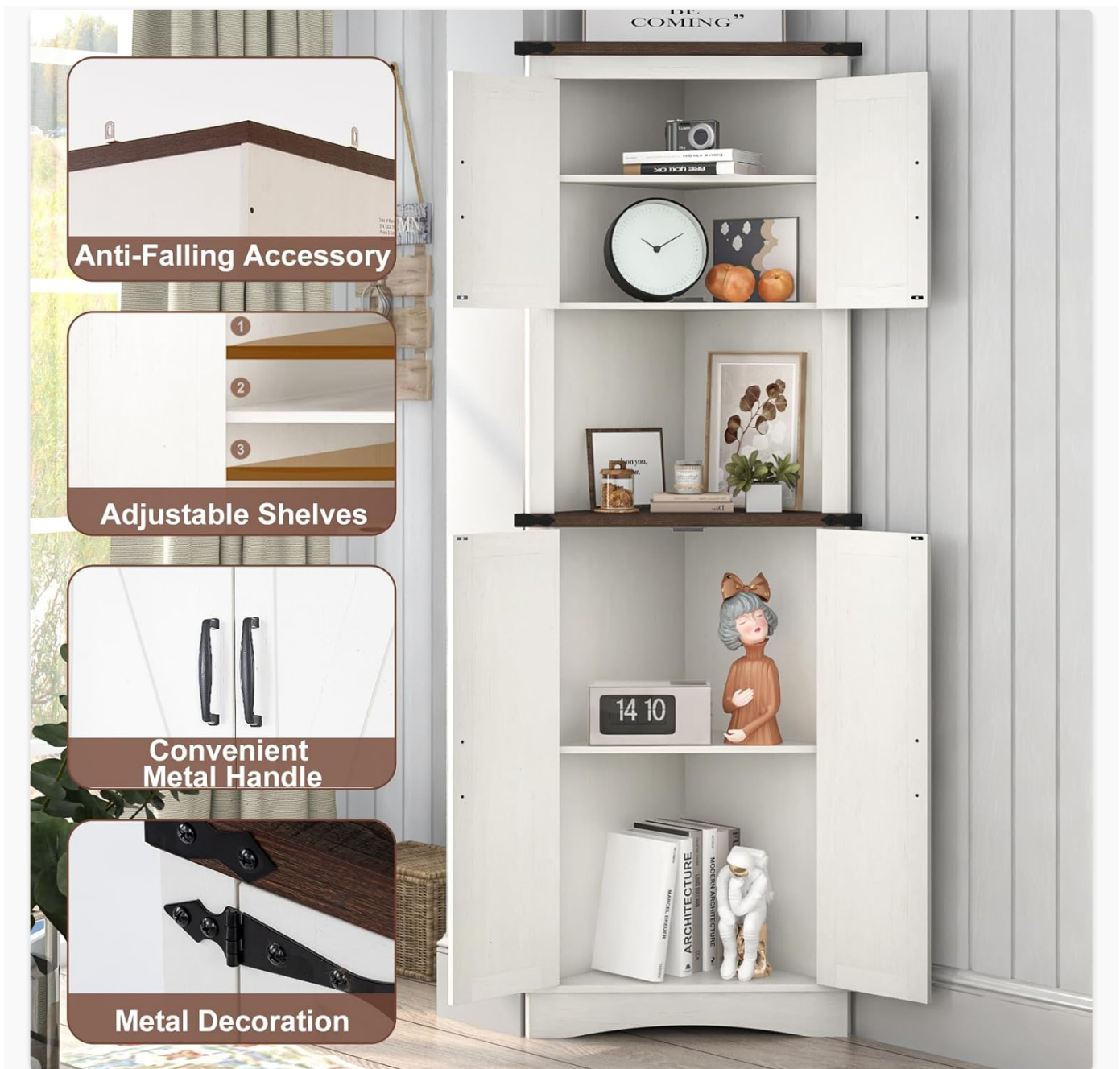
Image: A detailed view highlighting the anti-falling accessory for wall mounting and the three-position adjustable shelf mechanism within the cabinet.