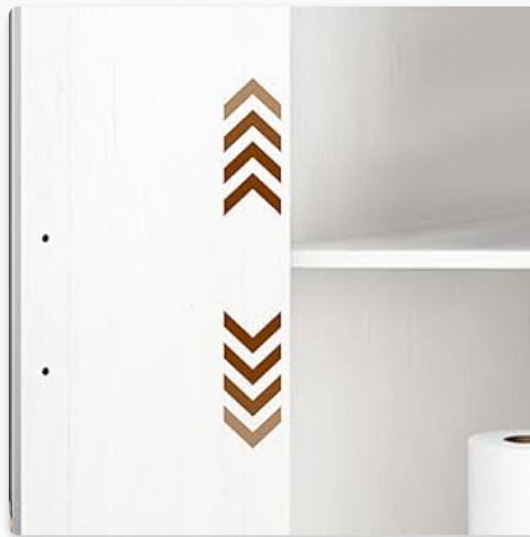
Image: A diagram illustrating the three possible positions for adjusting the internal shelves within the cabinet.