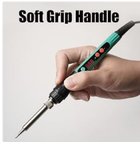
Soft Grip Handle: Provides comfort and control during operation.