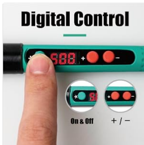
Press the ** button to turn the iron on or off.