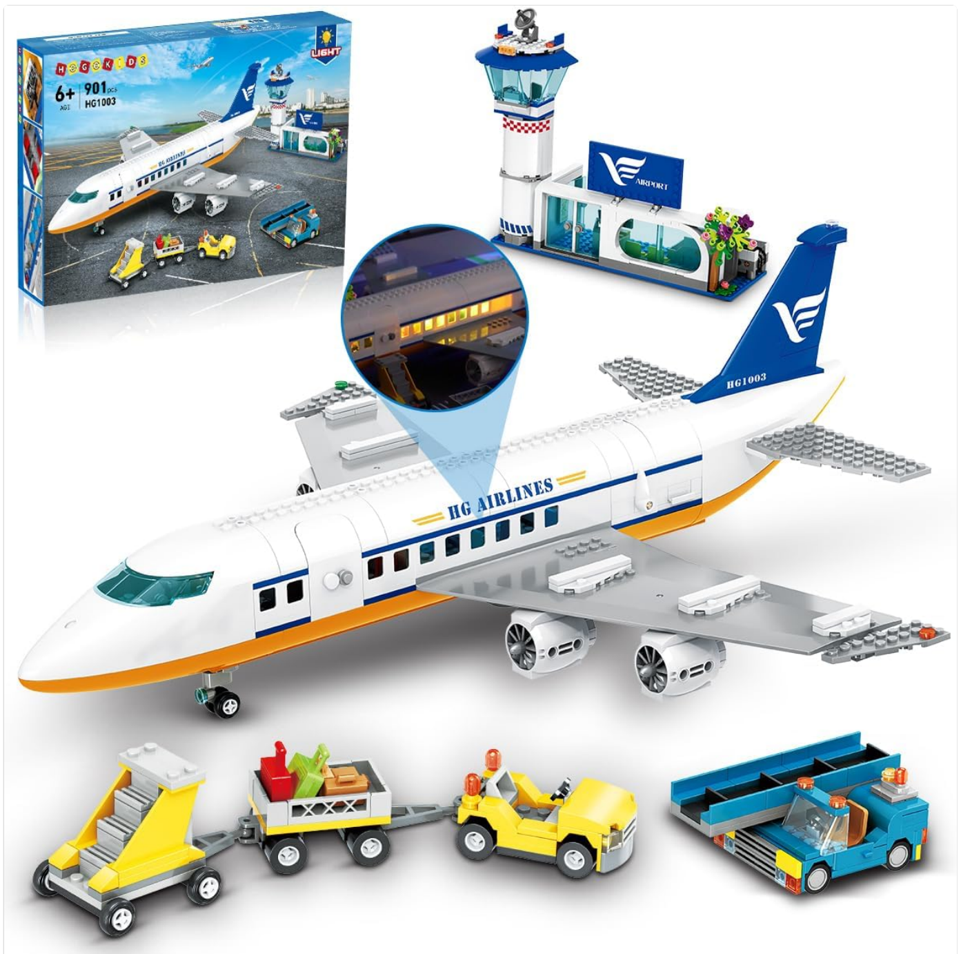
Figure 1.1: Complete HOGOKIDS City Passenger Airplane Building Set, showcasing the airplane, airport terminal, radar tower, and ground support vehicles.