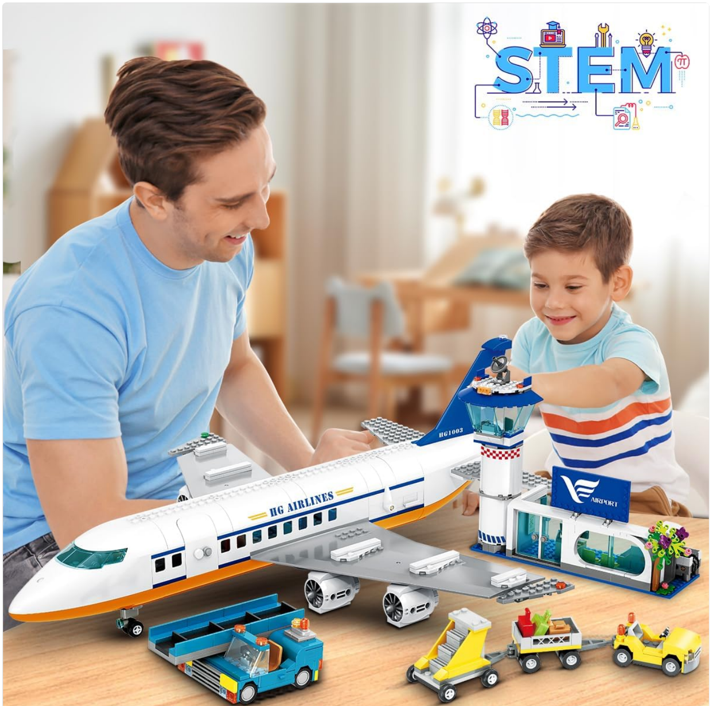
Figure 2.1: The assembly process, demonstrating the construction of the airplane and terminal.