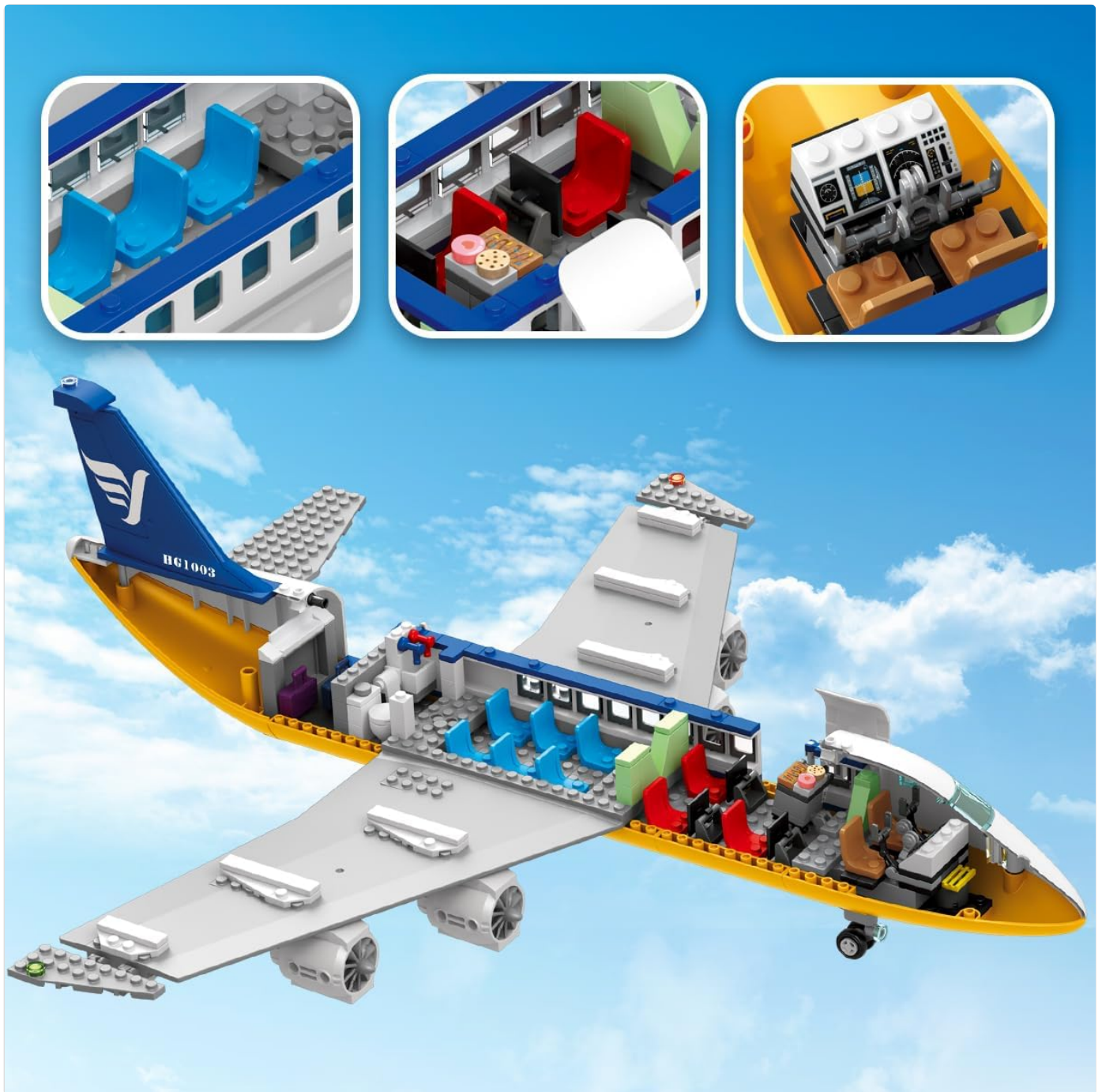
Figure 3.2: Close-up view of the airplane's interior, highlighting the cockpit, passenger seating, and catering area.