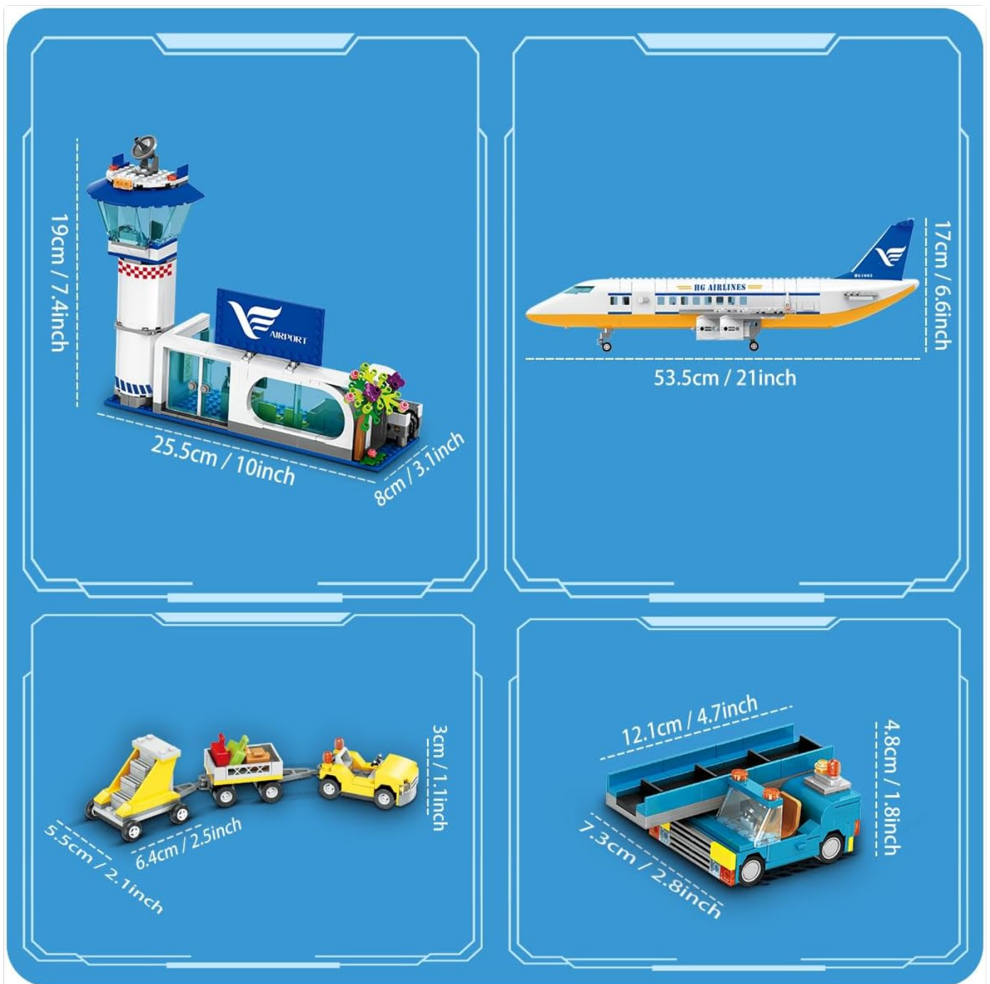
Figure 6.1: Dimensional specifications for the main components of the building set.