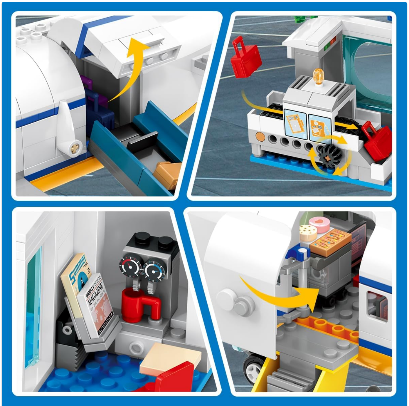
Figure 3.3: Detailed view of the luggage handling system and catering cart, demonstrating interactive elements.