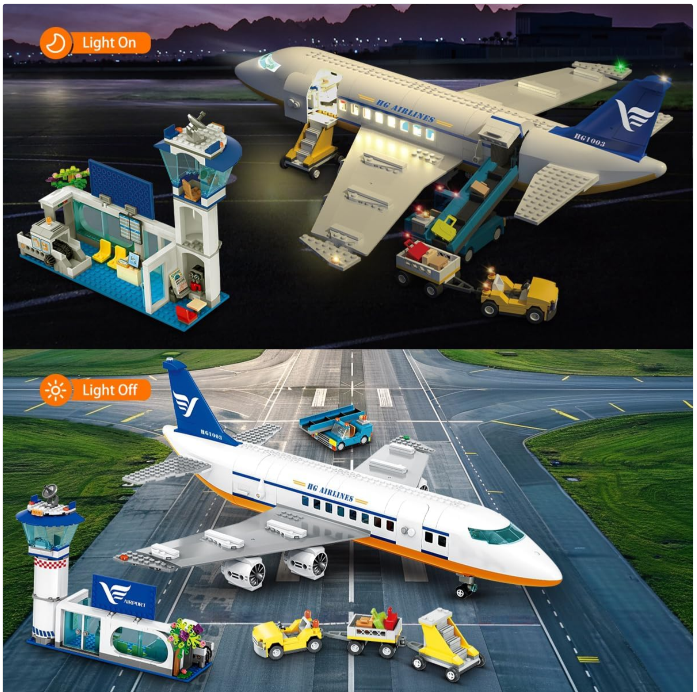
Figure 3.1: The airplane demonstrating its LED light feature, shown in both illuminated and unilluminated states.