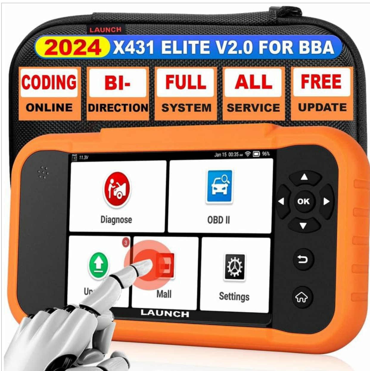
Image: The LAUNCH X431 Elite V2.0 BBA diagnostic tool connected to a vehicle's OBDII port, displaying its main menu.