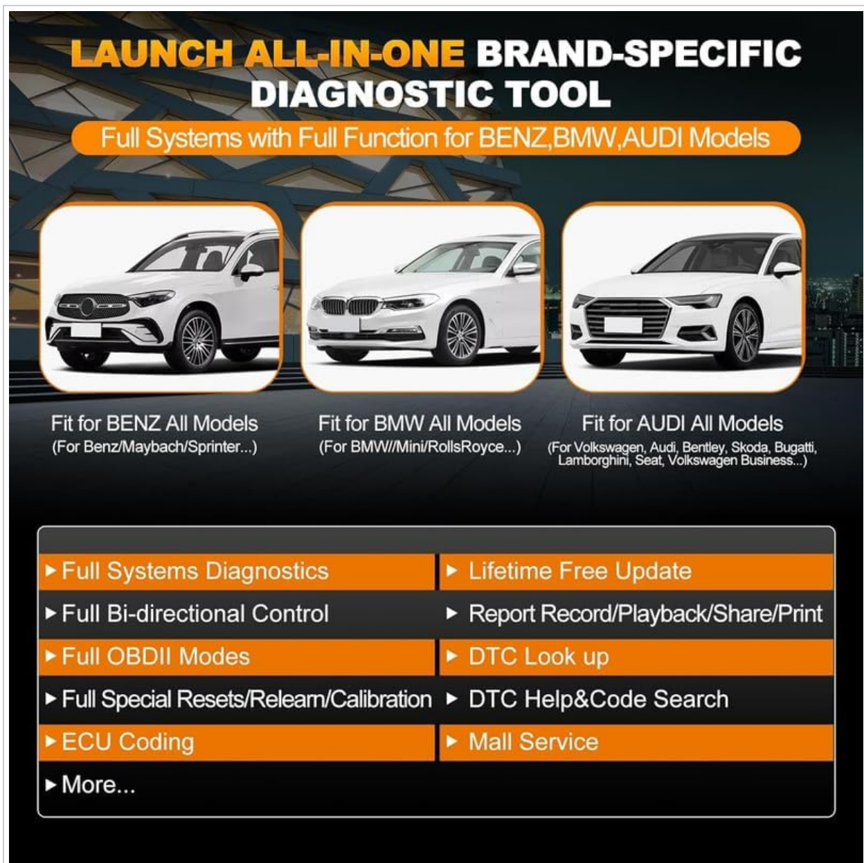
Image: LAUNCH X431 Elite V2.0 BBA Diagnostic Tool highlighting supported brands (Benz, BMW, Audi) and key features like Full Systems Diagnostics, Bi-directional Control, OBDII Modes, Resets, ECU Coding, and Lifetime Free Update.