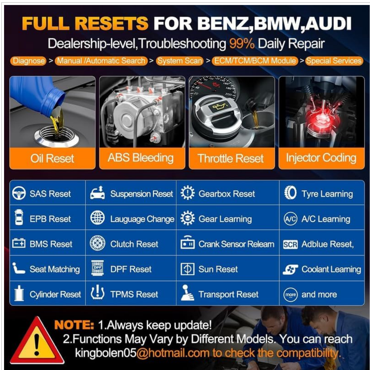
Image: The LAUNCH X431 Elite V2.0 BBA displaying a wide array of reset functions for Benz, BMW, and Audi vehicles, such as Oil Reset, ABS Bleeding, and Injector Coding.