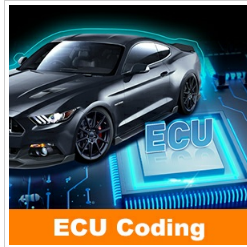
Image: A visual representation of the ECU Coding function, showing a car's computer system.