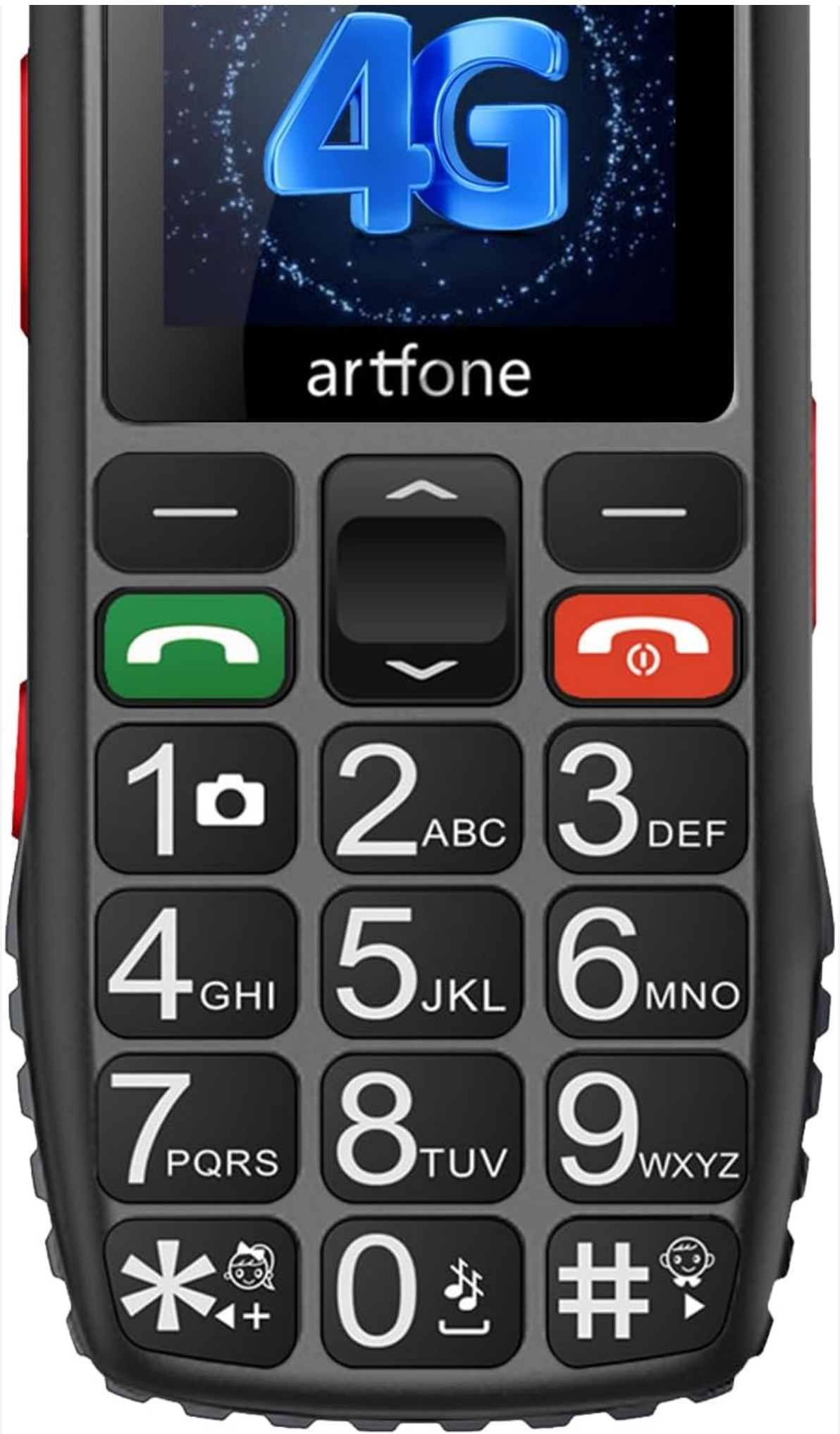
Image 3.1: Front view of the artfone C1 4G Senior Mobile Phone, showing the display, large keypad, and call/end buttons.