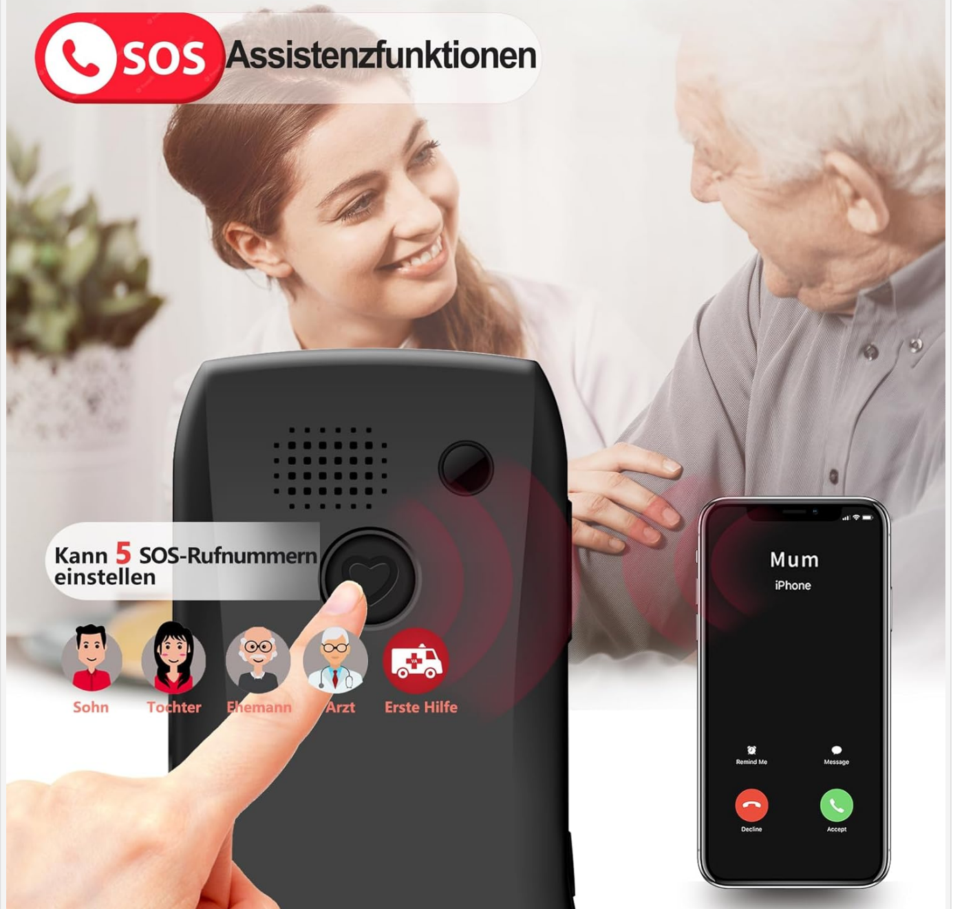
Image 5.5: The SOS assistance function, located on the back of the phone, allows users to quickly contact up to 5 pre-set emergency numbers by pressing and holding the button.