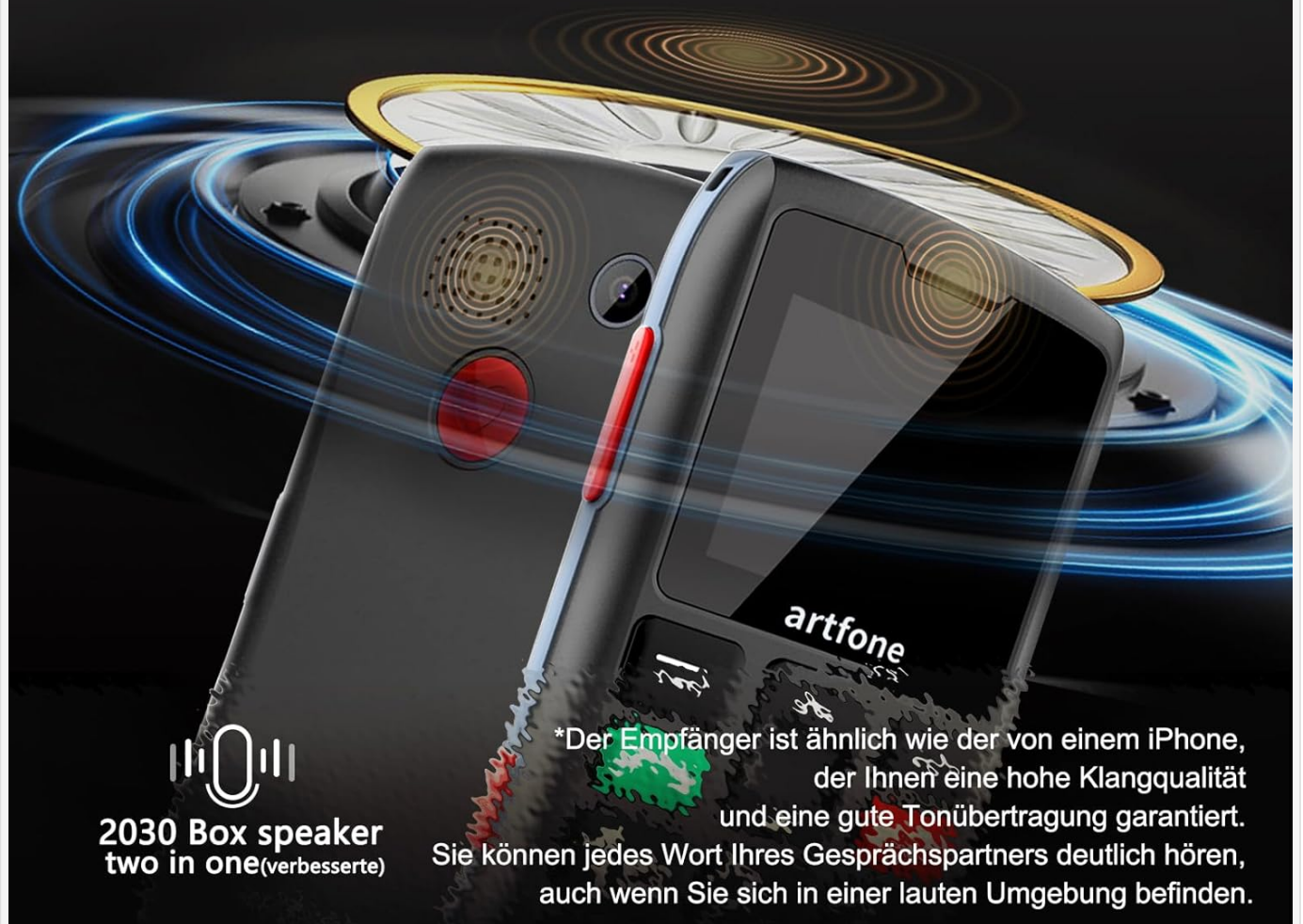
Image 5.3: The artfone C1 4G is equipped with a high-resolution speaker, ensuring clear and loud audio for calls and notifications.