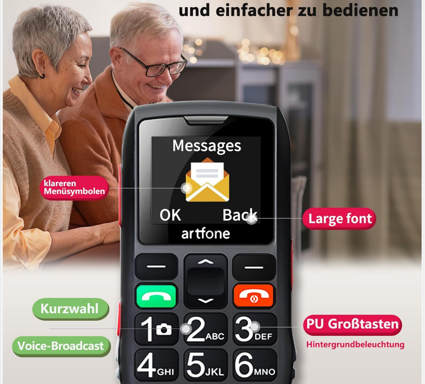
Image 5.1: The artfone C1 4G features a large font display and clear menu symbols for enhanced readability, making it user-friendly for seniors.