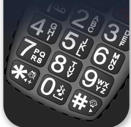
Image 5.2: This image illustrates the T9 predictive text input method for messages and the integrated flashlight feature.

Drücken Sie lange auf die Ziffern 2-9 auf dem Startbildschirm, und der gespeicherte Kontakt wird gewählt