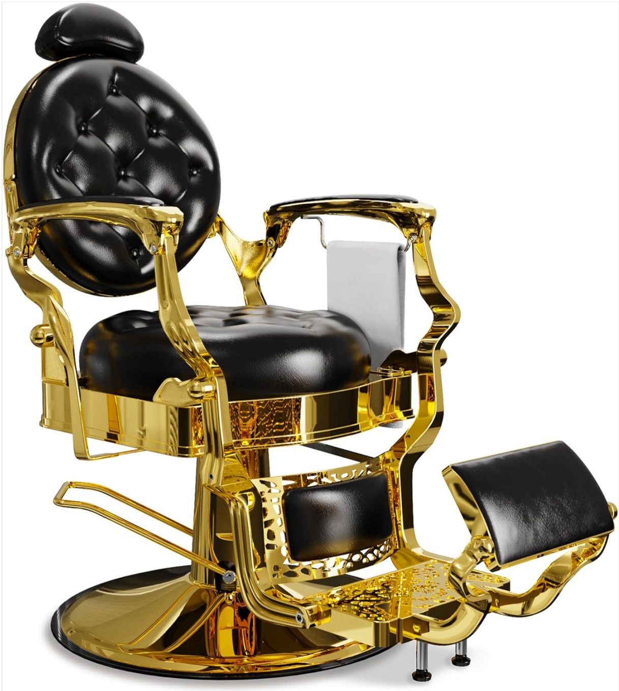
Figure 3.1: Main components of the Baasha Vintage Reclining Barber Chair Model 154.

This image displays the fully assembled Baasha Vintage Reclining Barber Chair Model 154, showcasing its black and gold design, adjustable headrest, and footrest. It represents the complete product after successful assembly.