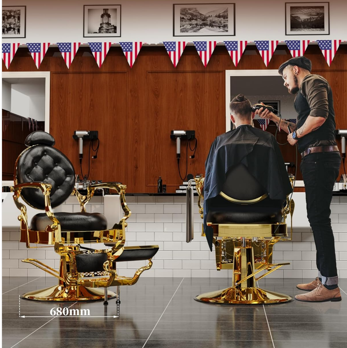
Figure 5.1: Illustration of the chair's sponge cushioning for comfort.

Heavy-duty Hydraulic Pump Withstand 440 lbs