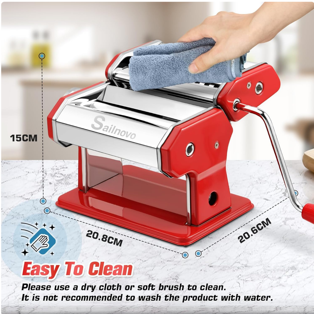
Image: This diagram highlights the dimensions of the pasta maker and provides visual instructions for easy cleaning using a dry cloth or brush.