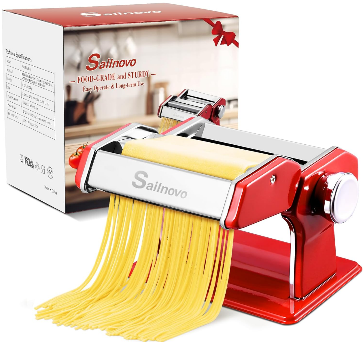
Image: The Sailnovo Pasta Maker Machine packaging, illustrating the product and its key features.