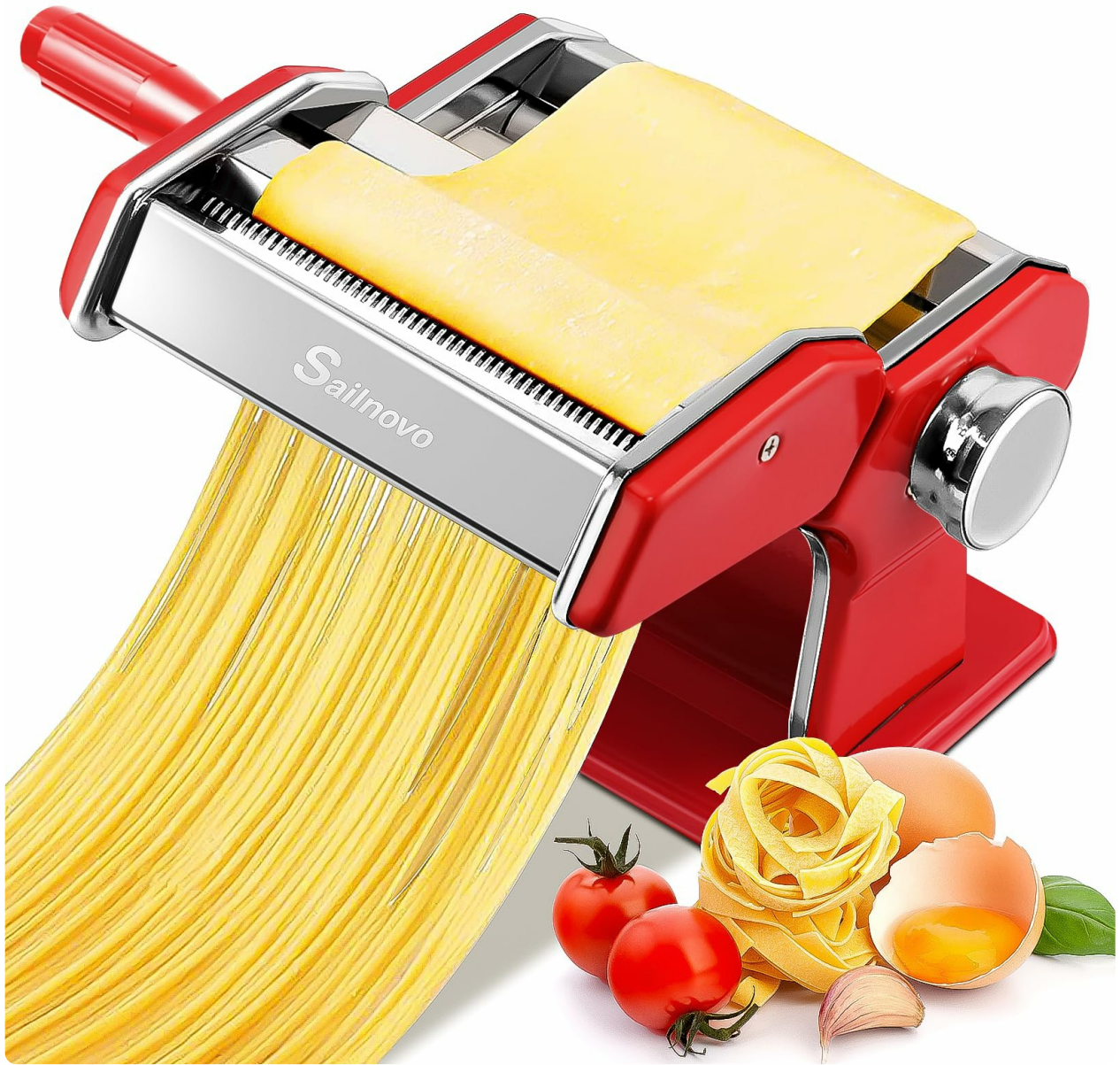
Image: The Sailnovo Pasta Maker Machine in red, showcasing its design and functionality on a kitchen counter.