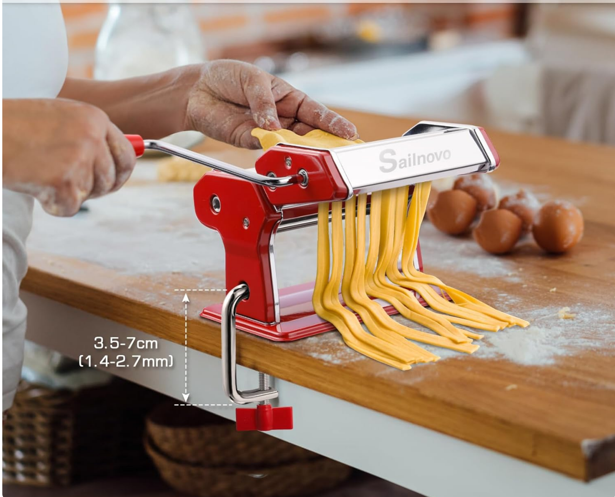
Image: A user demonstrates attaching the stable table clamp to the pasta maker, securing it to a countertop.

Fit for the table with a thickness of 3.5-7cm(1.4-2.7mm)